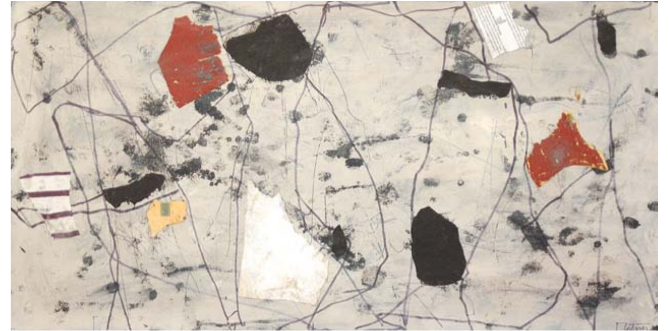
18. Untitled III mixed media on paper 33 x 65 cm