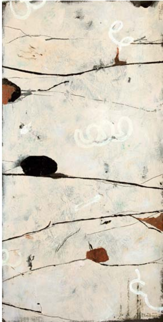
11. Untitled II oil on paper 65 x 33 cm