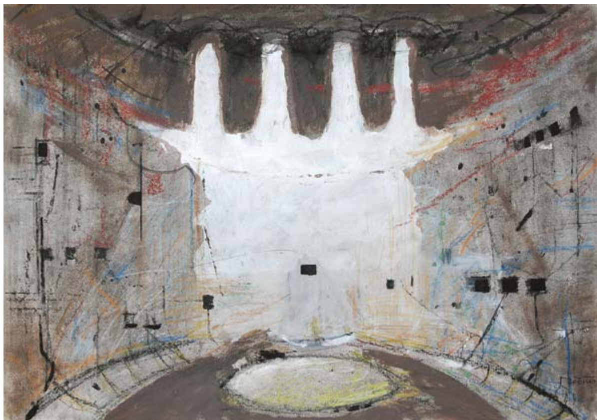
7. Light Emanation mixed media on paper 42 x 59 cm