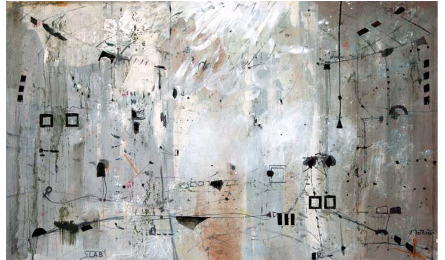
22. In the Laboratory mixed media on paper 39 x 65 cm