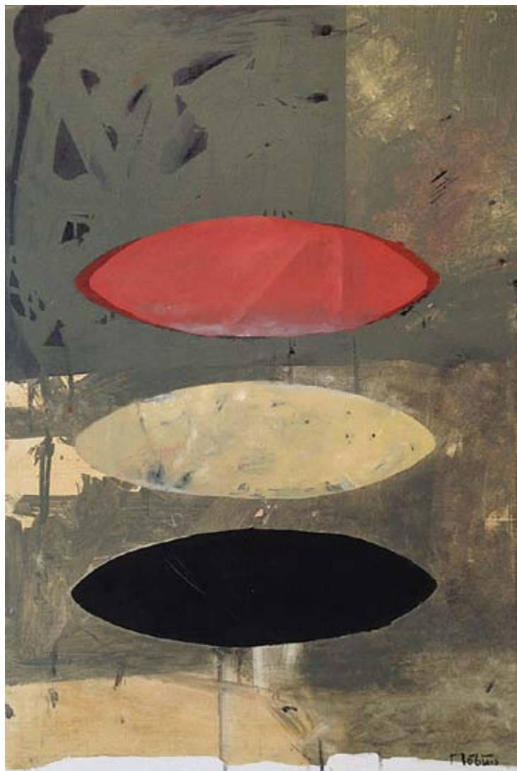
5. Totem Pole oil on canvas 70 x 46 cm