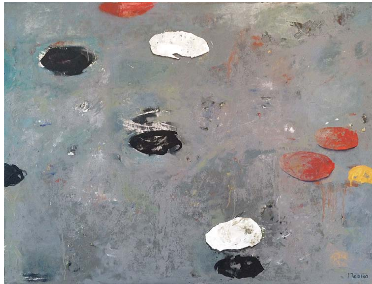
6. Water Lilies I oil on canvas 80 x 105 cm