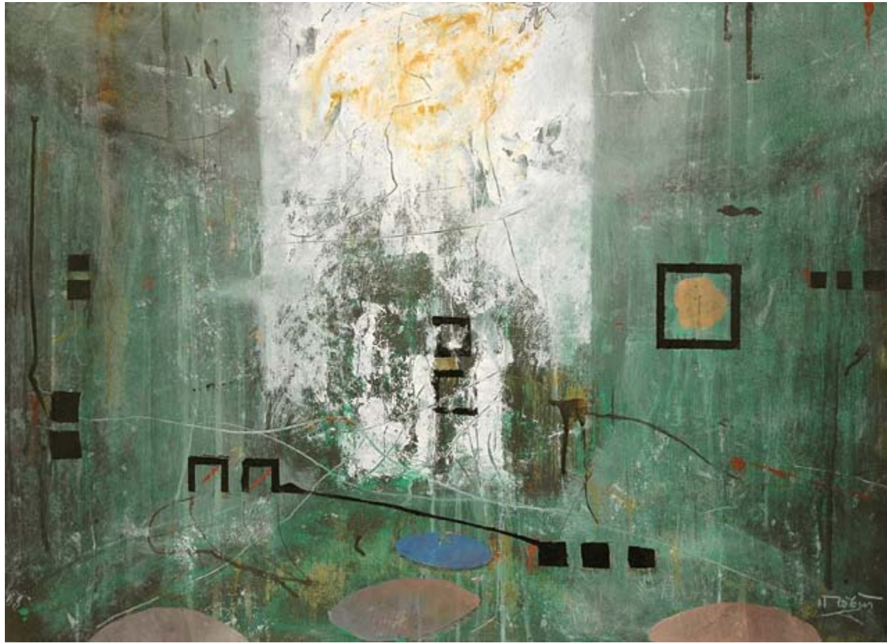
21. In the Laboratory mixed media on paper 42 x 58 cm