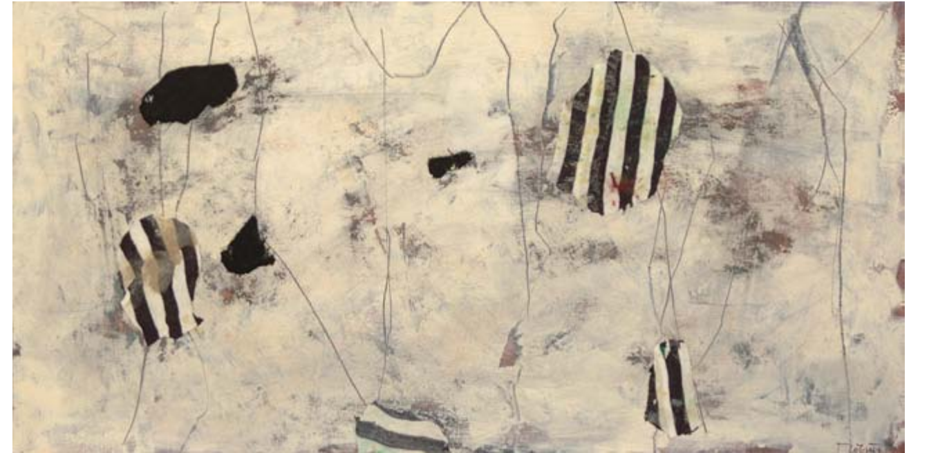
24. Untitled V mixed media on paper 33 x 65 cm