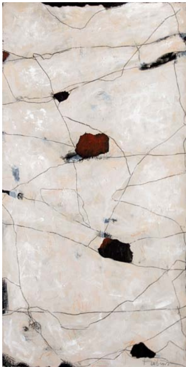
19. Untitled IV mixed media on paper 65 x 33 cm