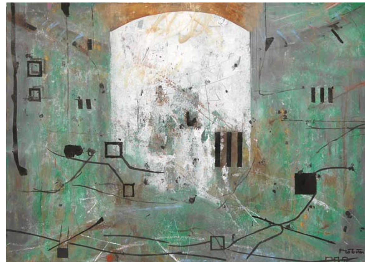
16. Relays and Contacts mixed media on paper 42 x 58 cm