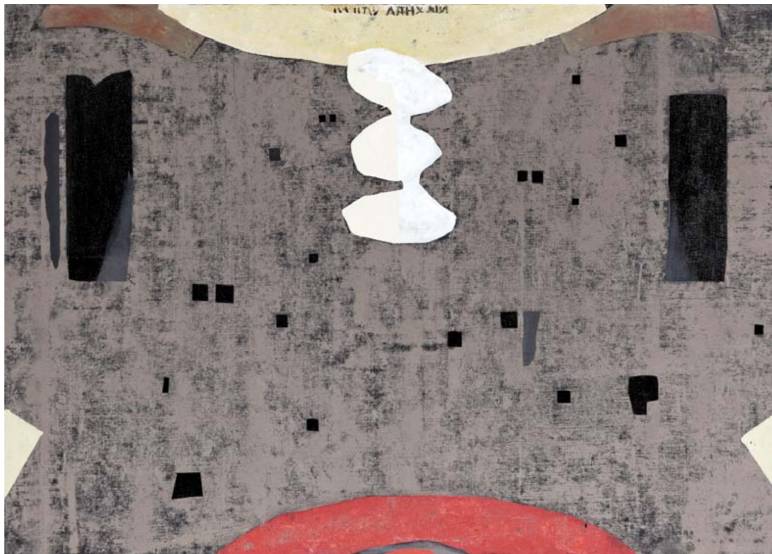
15. Construction oil on canvas 90 x 126 cm