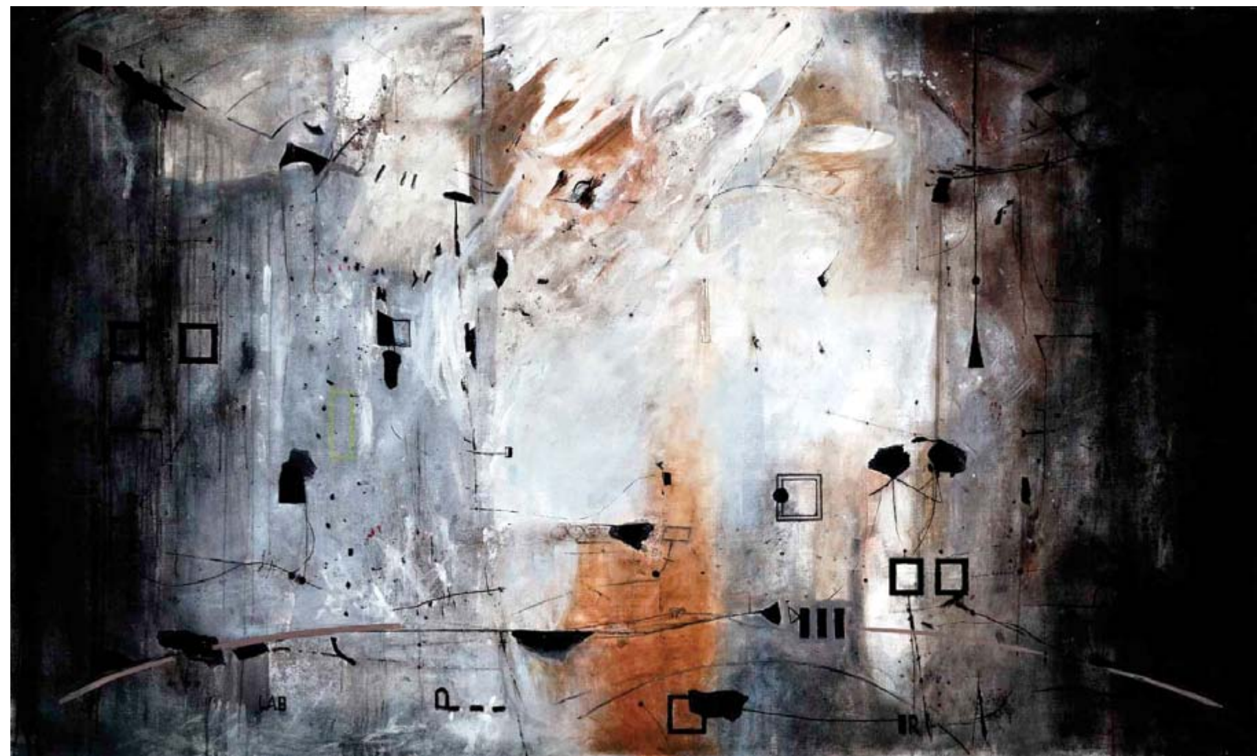
8. In the Laboratory oil on canvas 117 x 185 cm