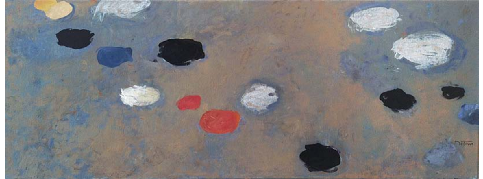
14. Water Lilies III oil on canvas 46 x 123 cm