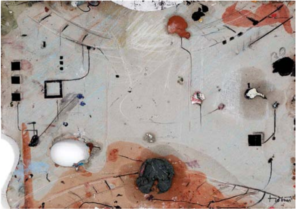
25. Painted Pallet oil on cardboard 30 x 42 cm