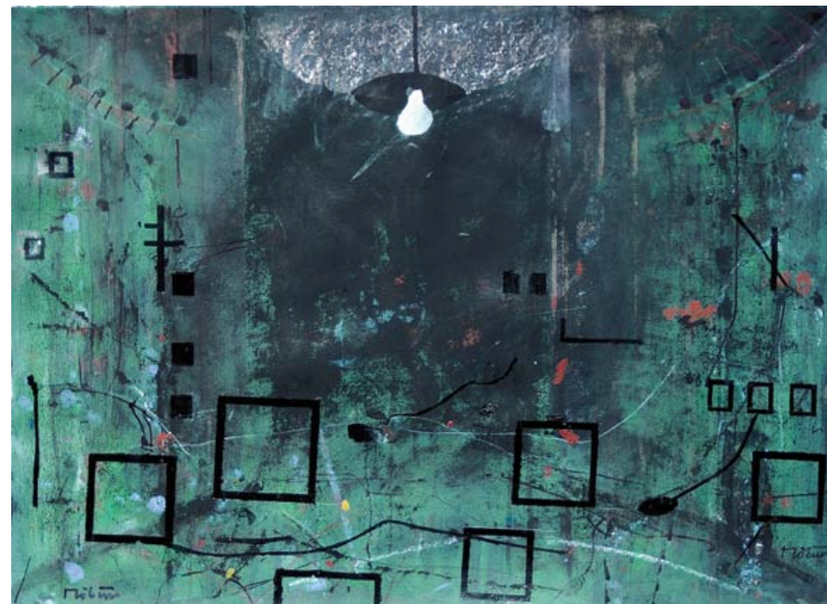
20. Revolt of the Modules mixed media on paper 42 x 58 cm