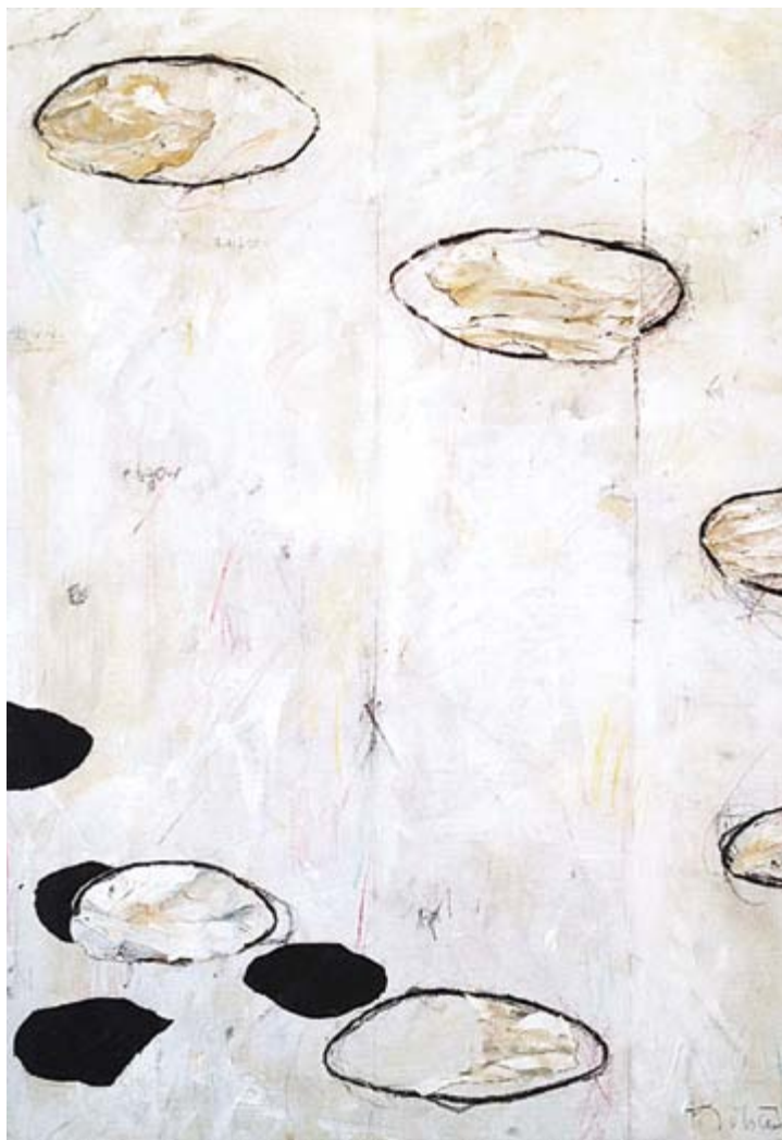
3. Black and White oil on canvas 66 x 46 cm