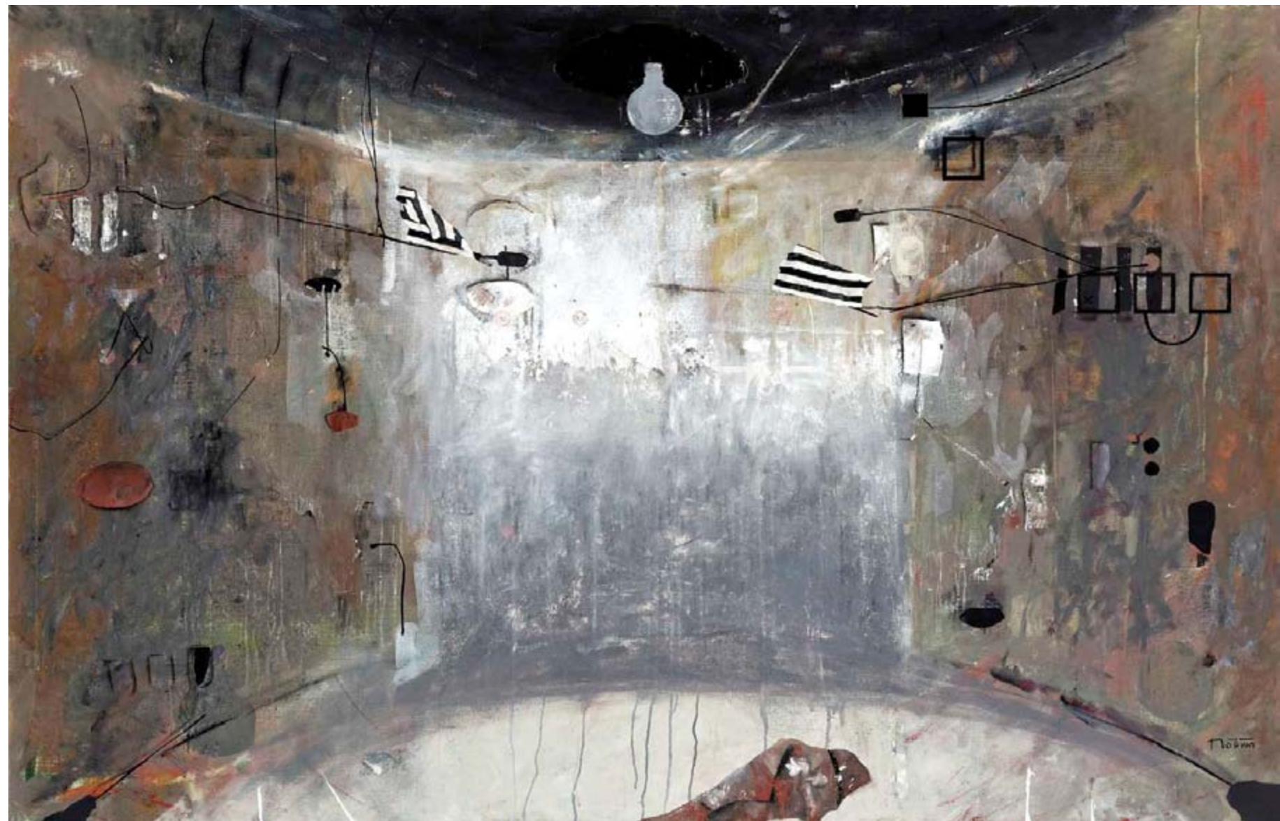
10. In the Laboratory oil on canvas 116 x 186 cm