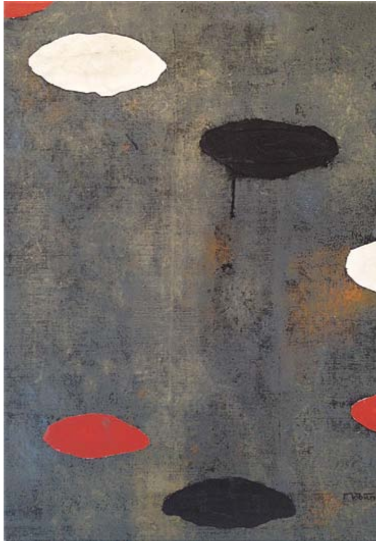
17. Water Lilies IV oil on canvas 66 x 46 cm