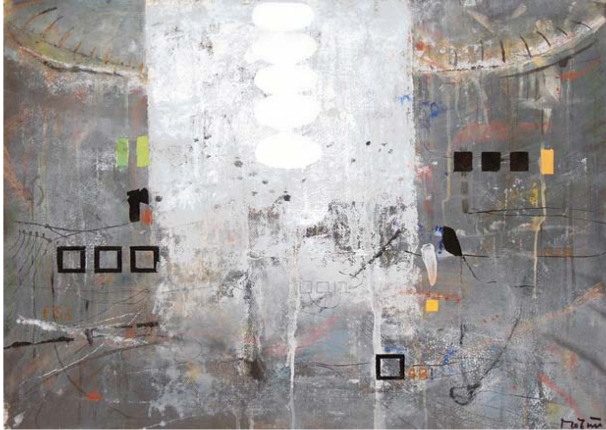
23. Core Light oil on paper 42 x 58 cm