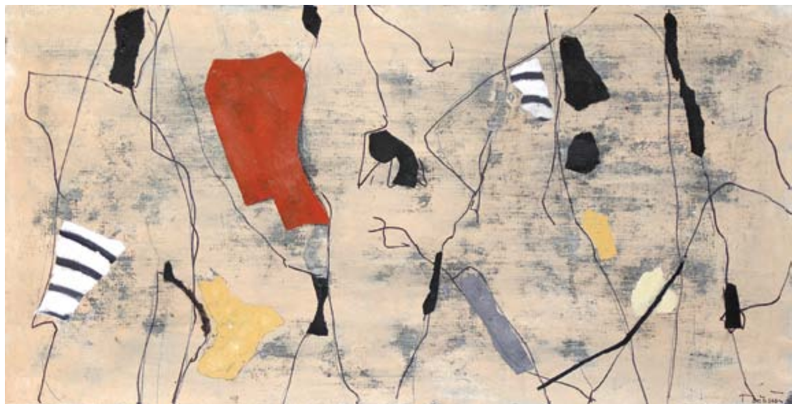
9. Untitled I mixed media on paper 33 x 65 cm