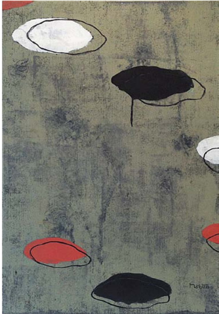
13. Water Lilies II oil on canvas 66 x 46 cm