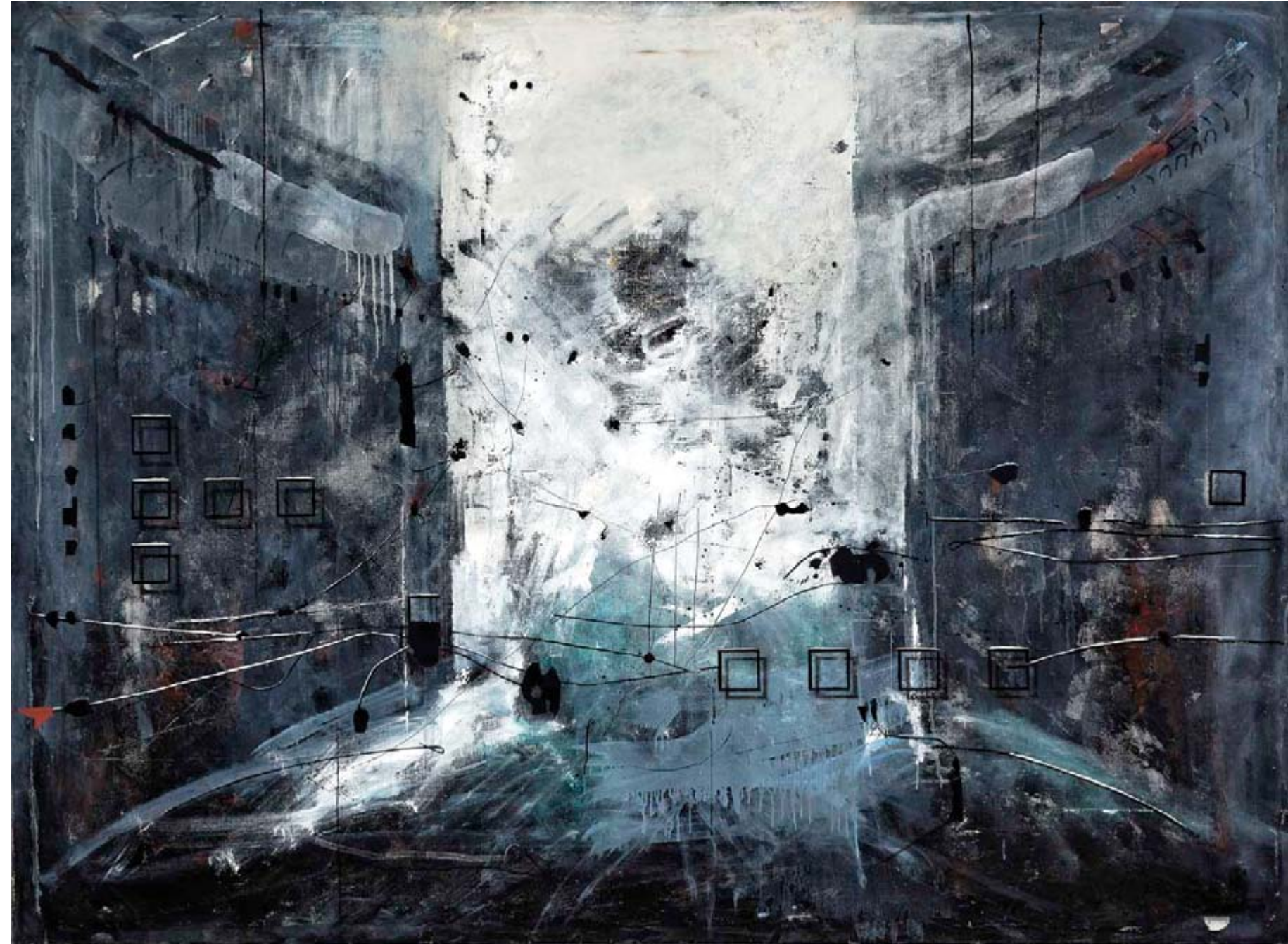
12. In the Laboratory oil on canvas 137 x 187 cm