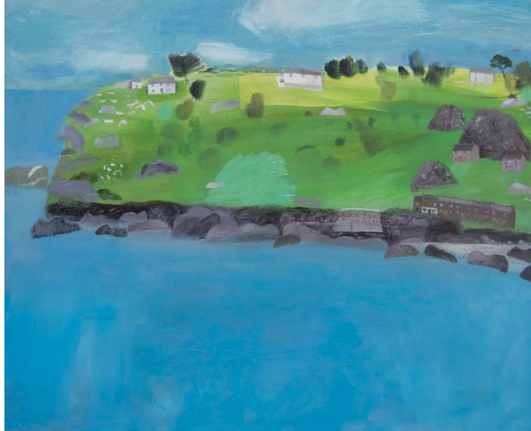
the hill lamorna mixed media on canvas 100 x 120 cm