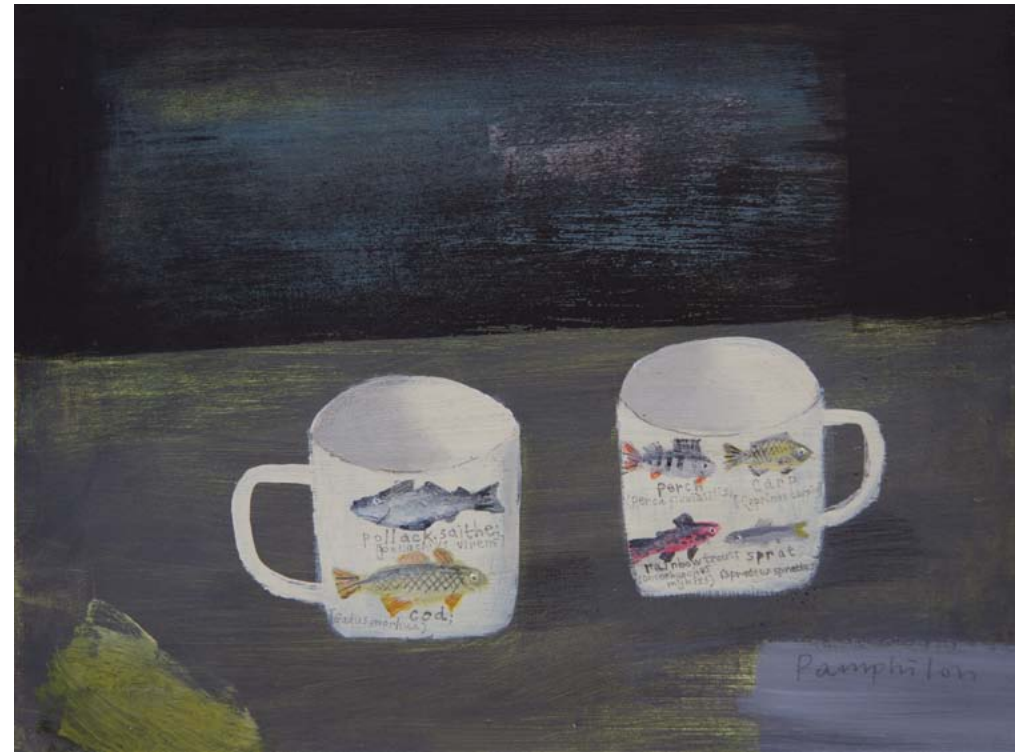
inside the black shed, walberswick mixed media on wooden panel 30 x 40 cm