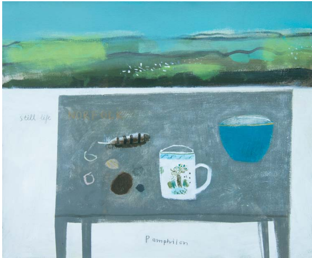
still life, norfolk mixed media on deep canvas 50 x 60 x 8 cm