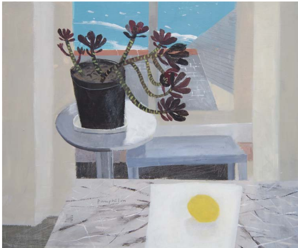
mr long's art class porthmeor studios st ives mixed media on wooden panel 50 x 60 cm