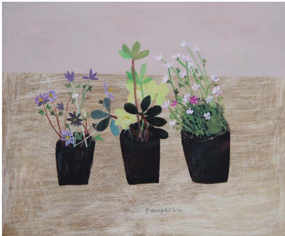
spring flowers from the farmers' market st ives mixed media on wooden panel 50 x 60 cm