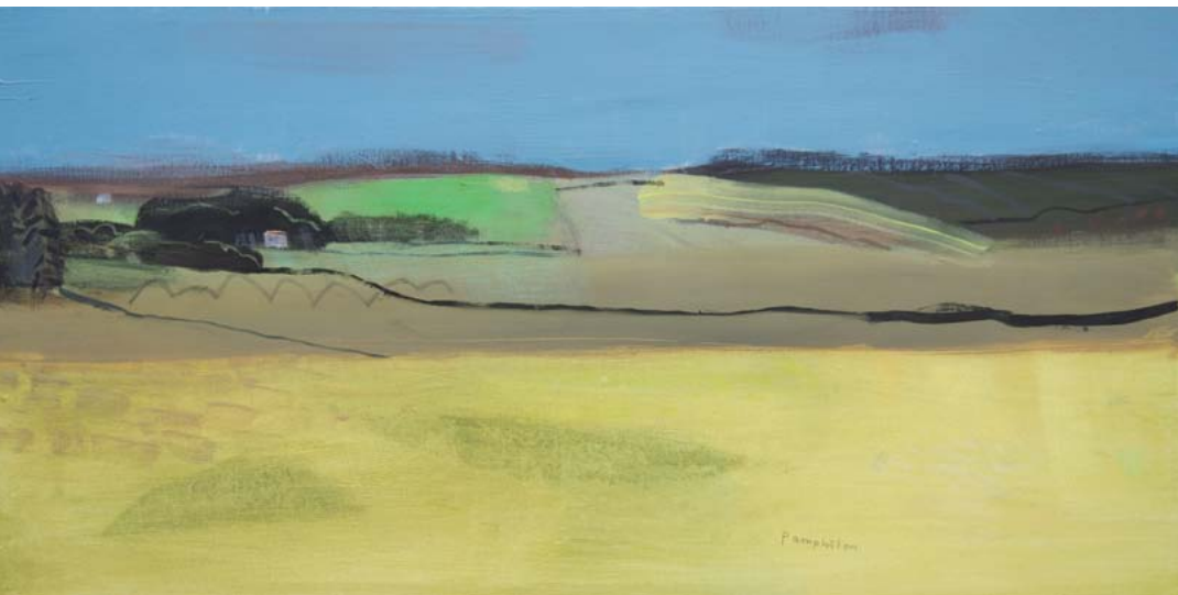
bodmin mixed media on canvas 50 x 100 cm