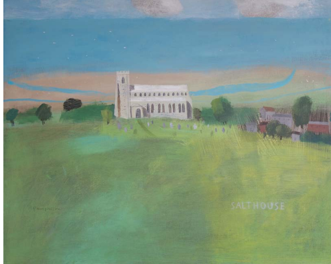
salthouse, norfolk mixed media on canvas 80 x 100 cm