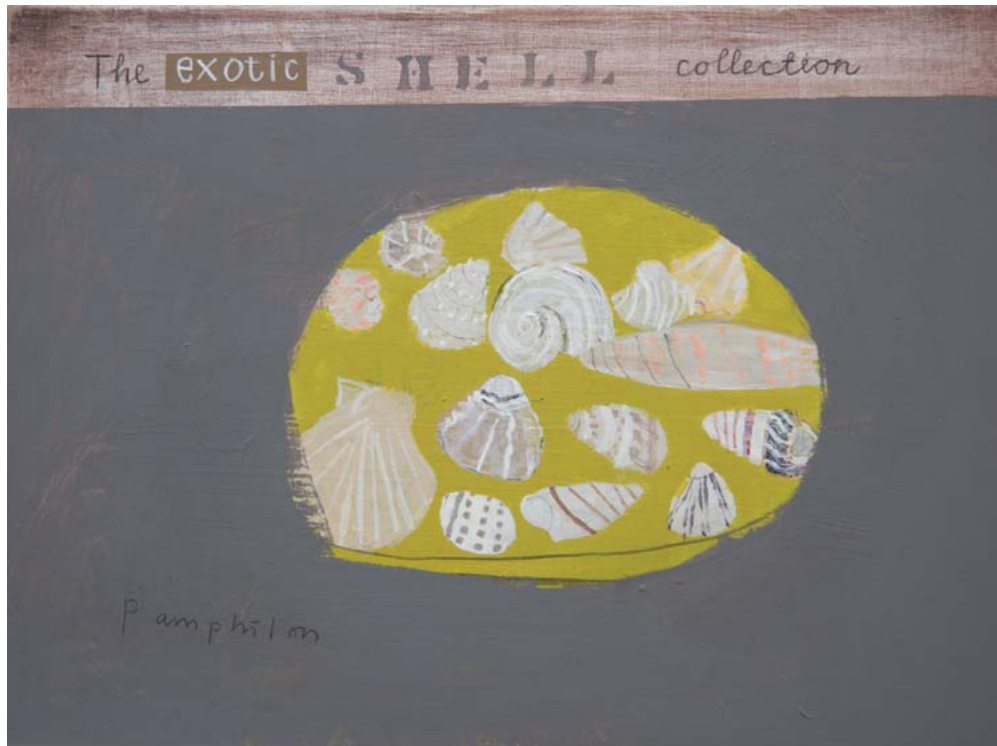
the exotic shell collection mixed media on wooden panel 30 x 40 cm