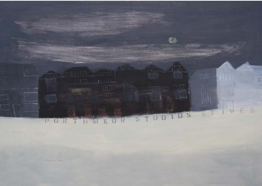
porthmeor studios mixed media on wooden panel 70 x 100 cm