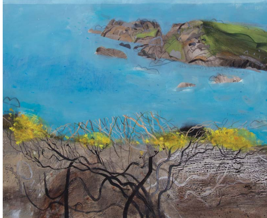
scorched earth at the gurnard's head, cornwall mixed media on canvas 100 x 120 cm