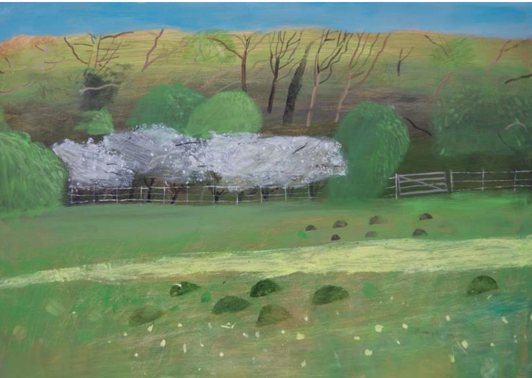
the may hedge, cowslips and molehills in the nature reserve mixed media on wooden panel 70 x 100 cm