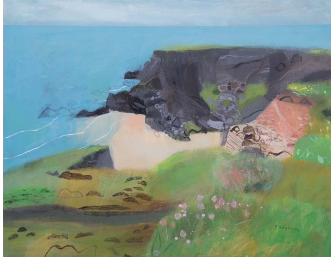
red earth tumble, south west coastal path mixed media on canvas 80 x 100 cm