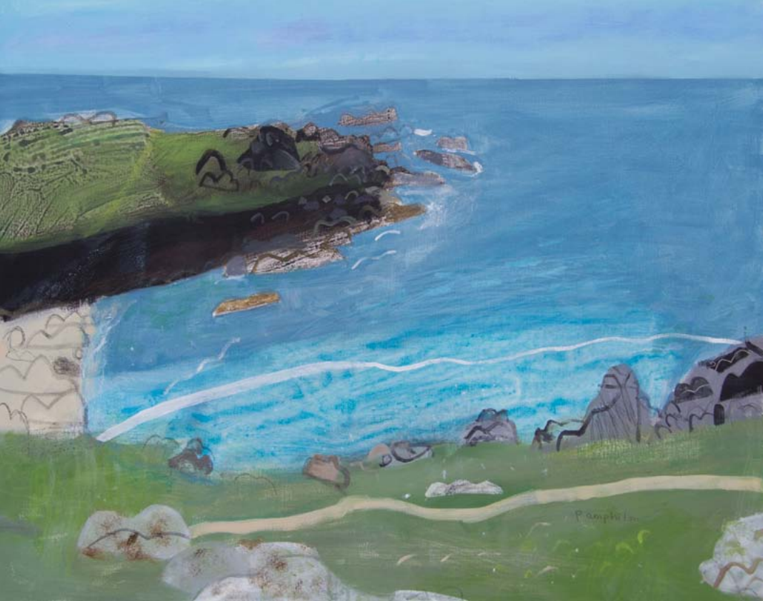
wave and footpath towards the gurnard's head mixed media on canvas 80 x 100 cm