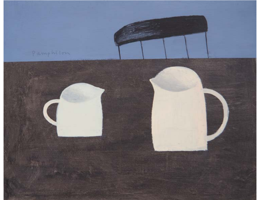
cream jug and milk jug on the table mixed media on wooden panel 40 x 50 cm