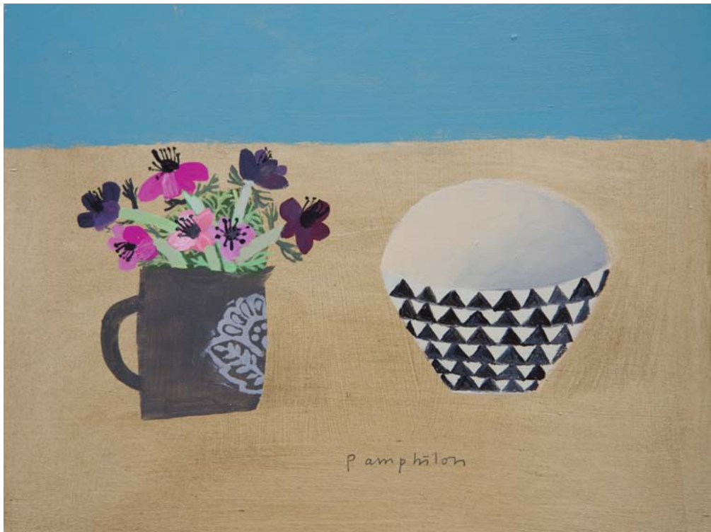
anemones and bowl mixed media on wooden panel 30 x 40 cm