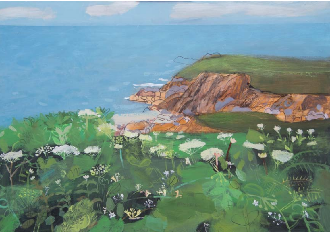
sea hedge mixed media on wooden panel 70 x 100 cm