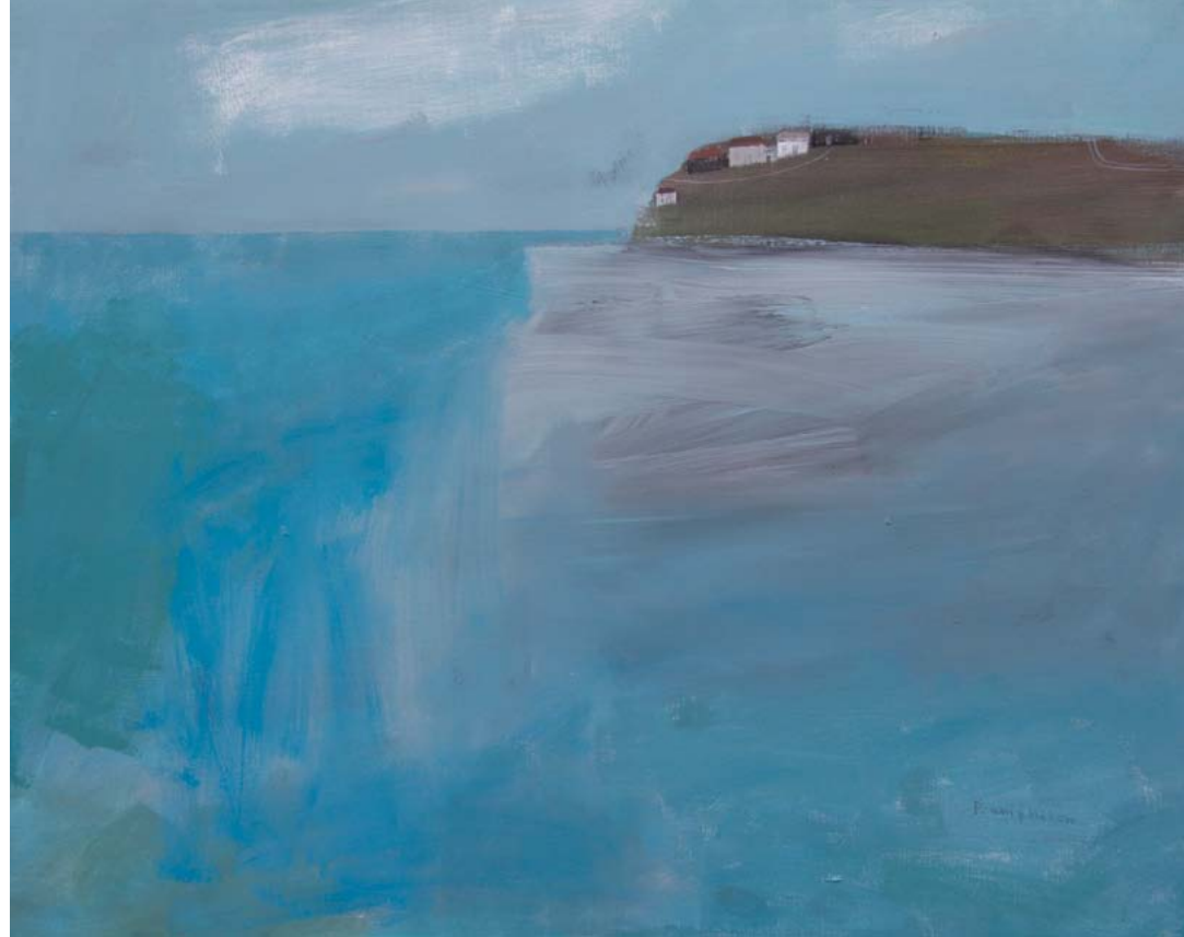
sand bank hayle estuary mixed media on canvas 80 x 100 cm