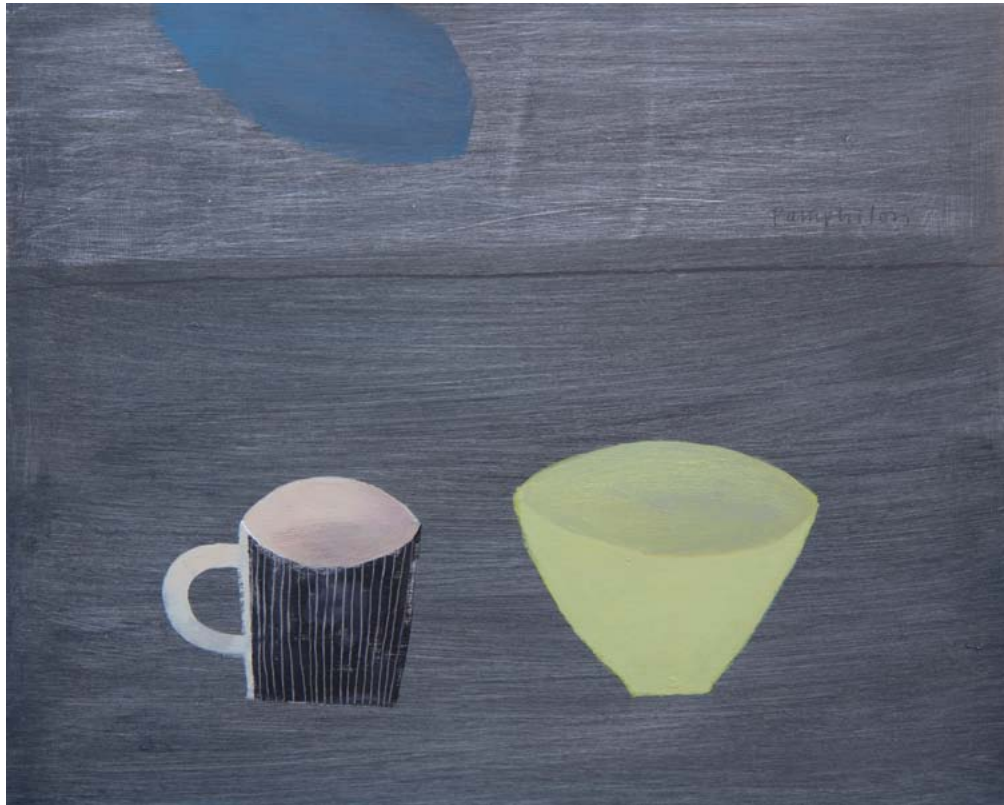
grey light mixed media on wooden panel 40 x 50 cm