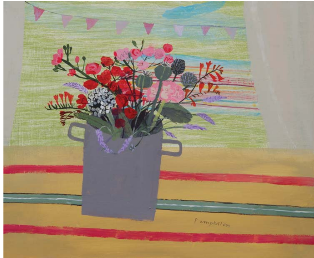
flowers inside the tent mixed media on wooden panel 50 x 60 cm