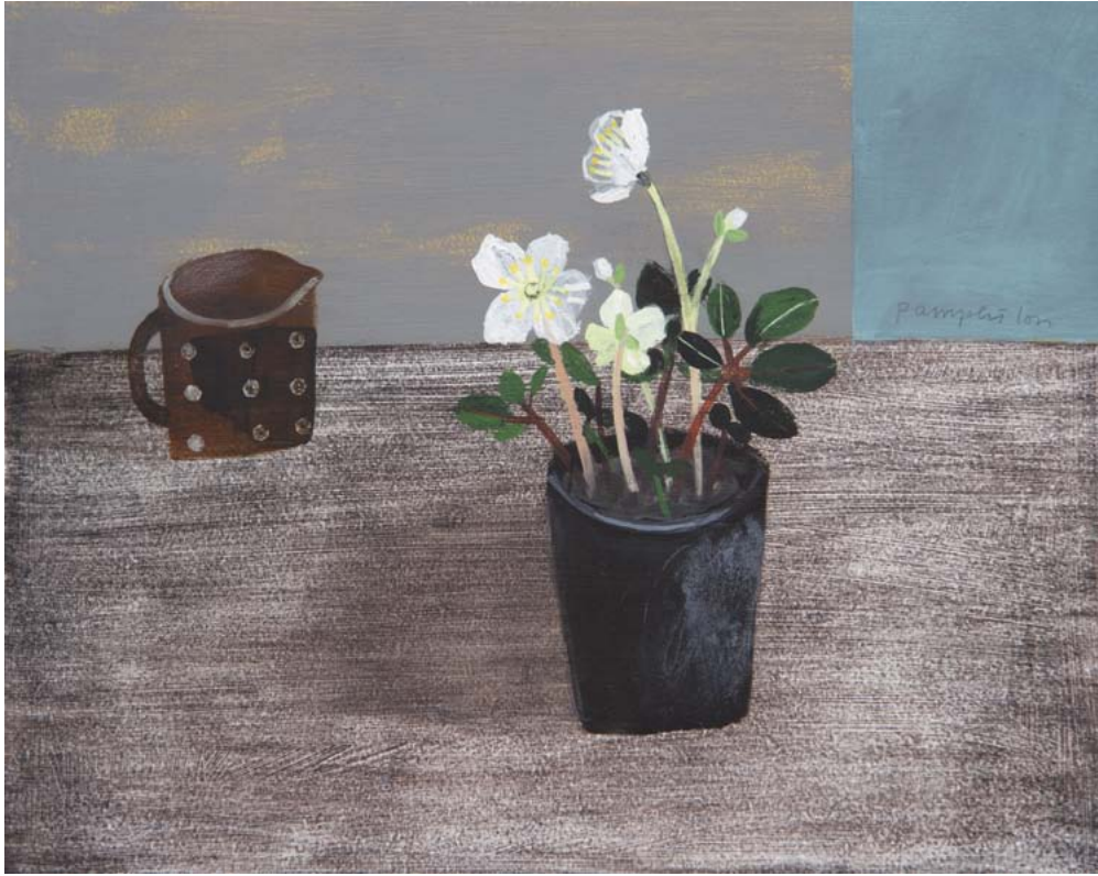
motoko's jug and white hellebore mixed media on wooden panel 40 x 50 cm