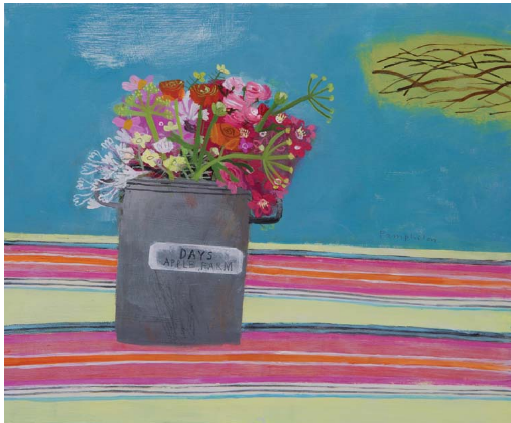
flowers at days apple farm mixed media on wooden panel 50 x 60 cm