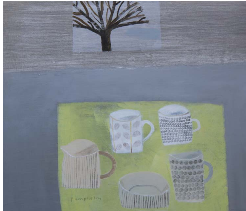
china on yellow cloth mixed media on wooden panel 50 x 60 cm