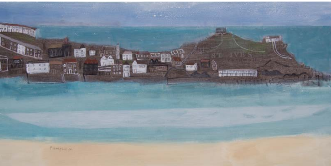
st ives cornwall mixed media on canvas 50 x 100 cm