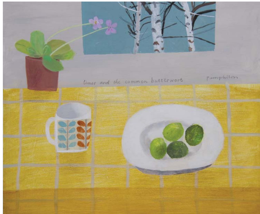
silver birch window mixed media in wooden panel 50 x 60 cm