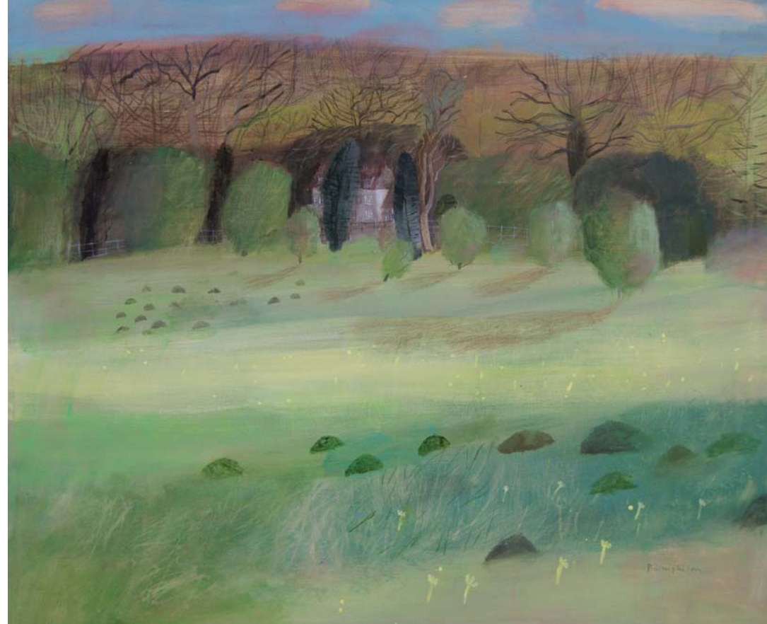
long shadows at the mill house meadow, molehills and cowslips mixed media on canvas 100 x 120 cm