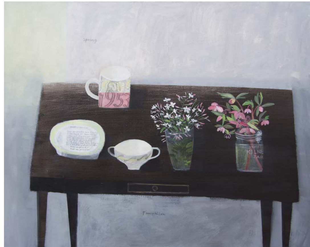
spring mixed media on canvas 80 x 100 cm