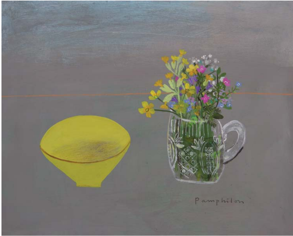
yellow bowl and meadow flowers mixed media on wooden panel 40 x 50 cm

(back cover) tea, watching birds and buying seeds at the wildflower cafe, norfolk mixed media on wooden panel 30 x 40 cm