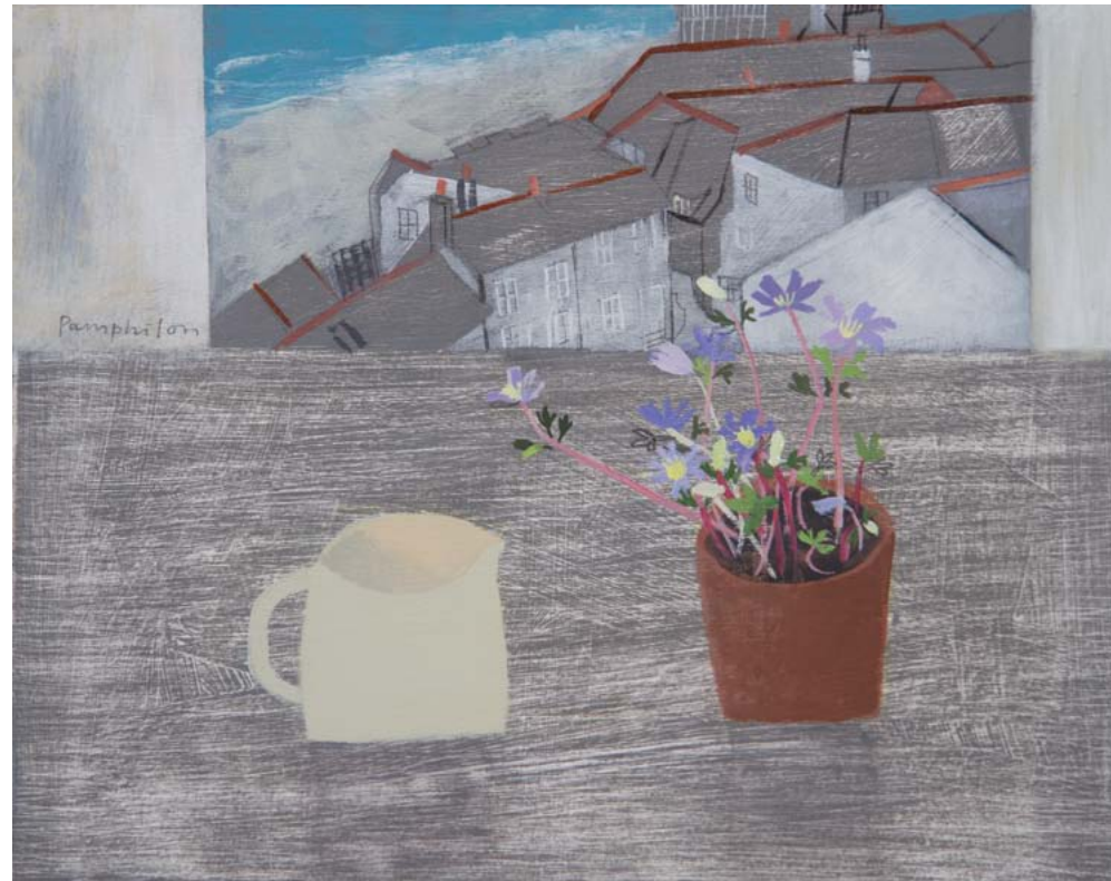
wood anemone from the farmers' market st ives mixed media on wooden panel 40 x 50 cm