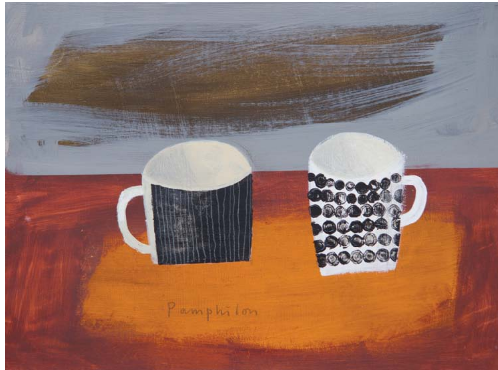
black and white still life, with orange and red mixed media on wooden panel 30 x 40 cm