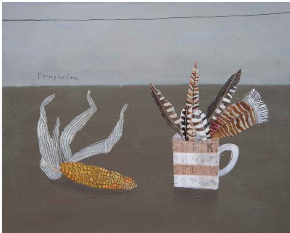
feathers collected on the shore mixed media on wooden panel 40 x 50 cm