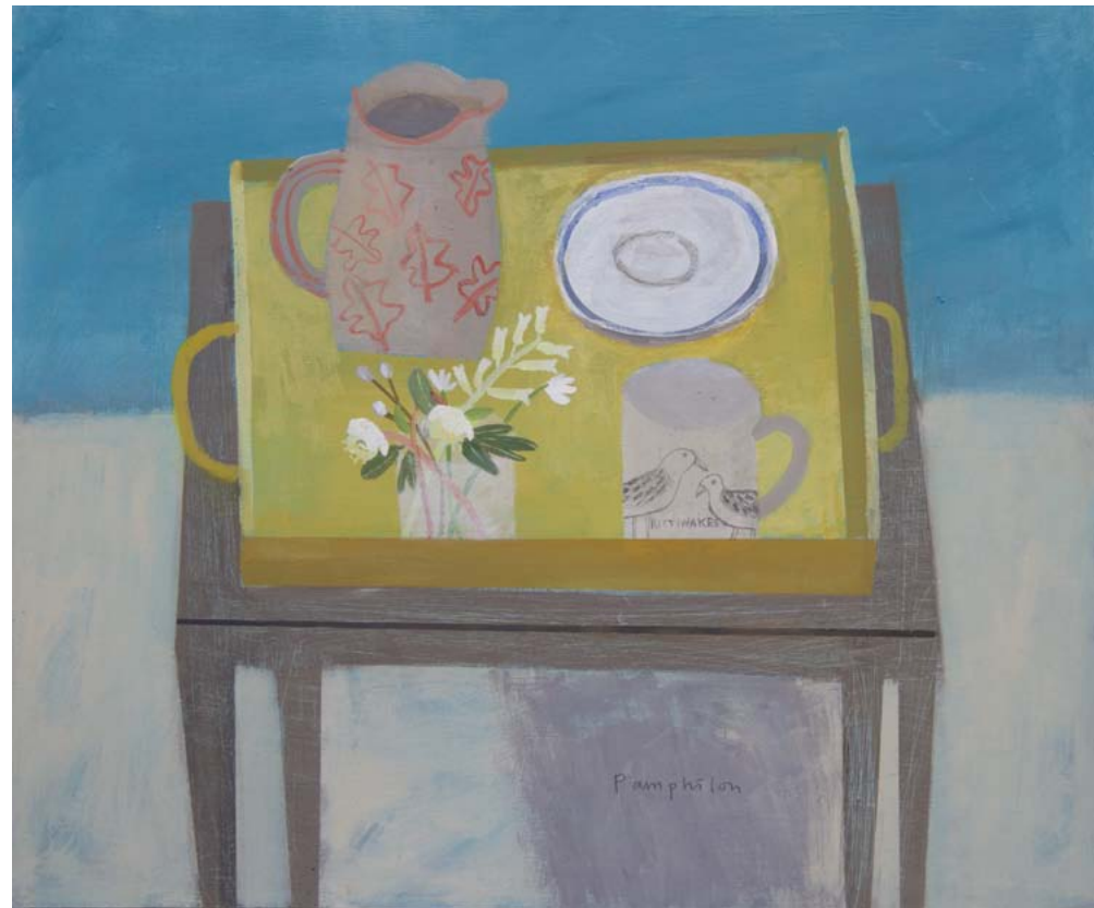
yellow tray with flowers mixed media on wooden panel 50 x 60 cm