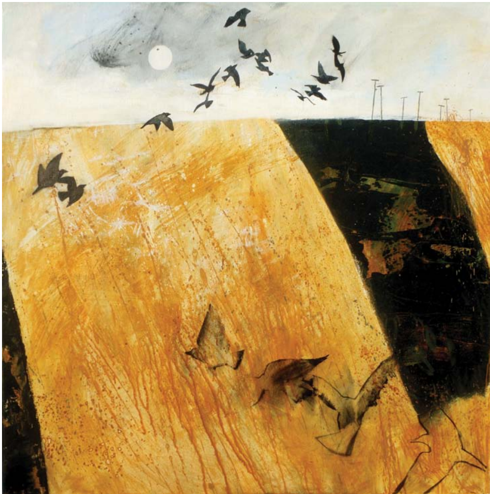
10. Rocks in Flight mixed media on canvas | 80 x 80 cm