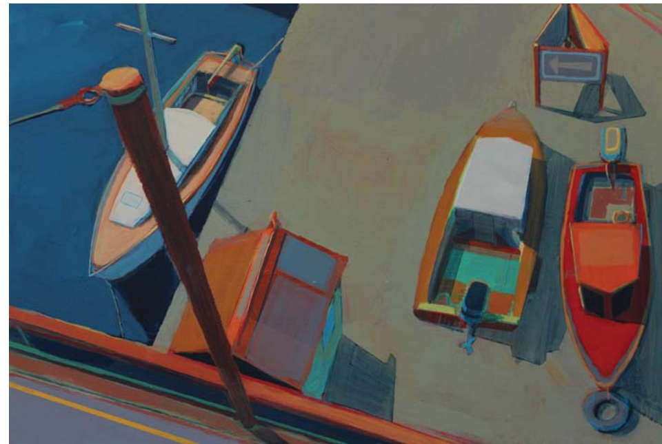
20. Looking Down, Portreath Harbour | acrylic on board | 30 x 45 cm