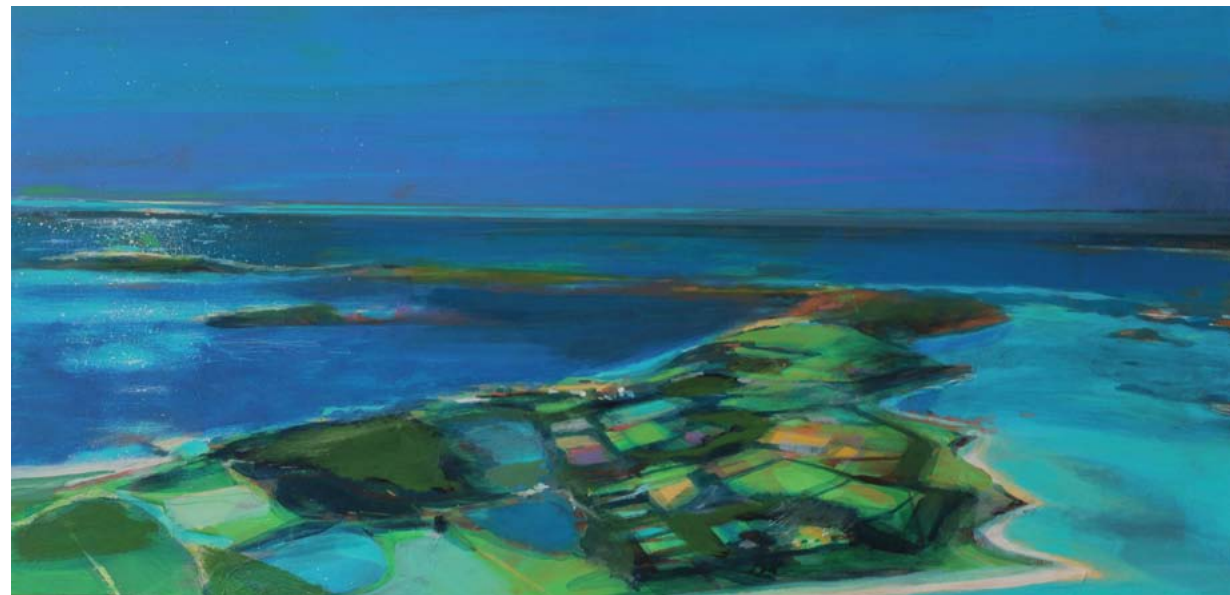
18. Over Tresco, Isles of Scilly | acrylic on board | 28 x 60 cm