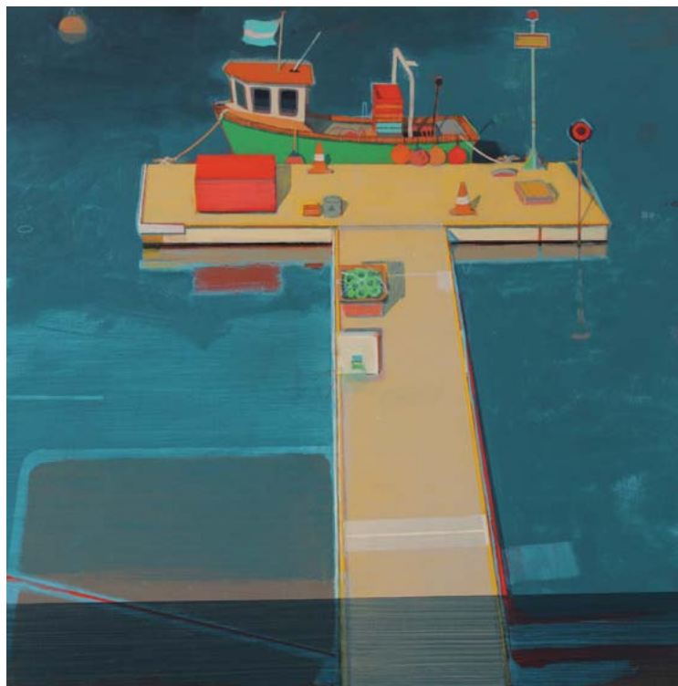
17. Green Fishing Boat, Mylor | acrylic on board | 45 x 45 cm