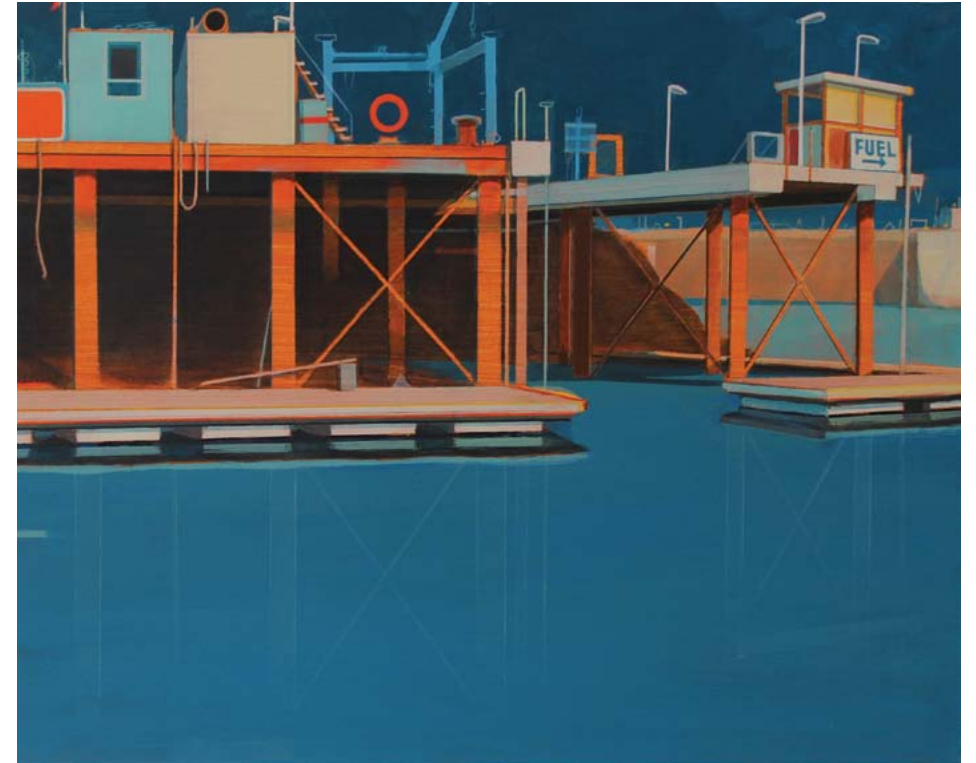
14. Dockyard, Plymouth | acrylic on board | 36 x 45 cm