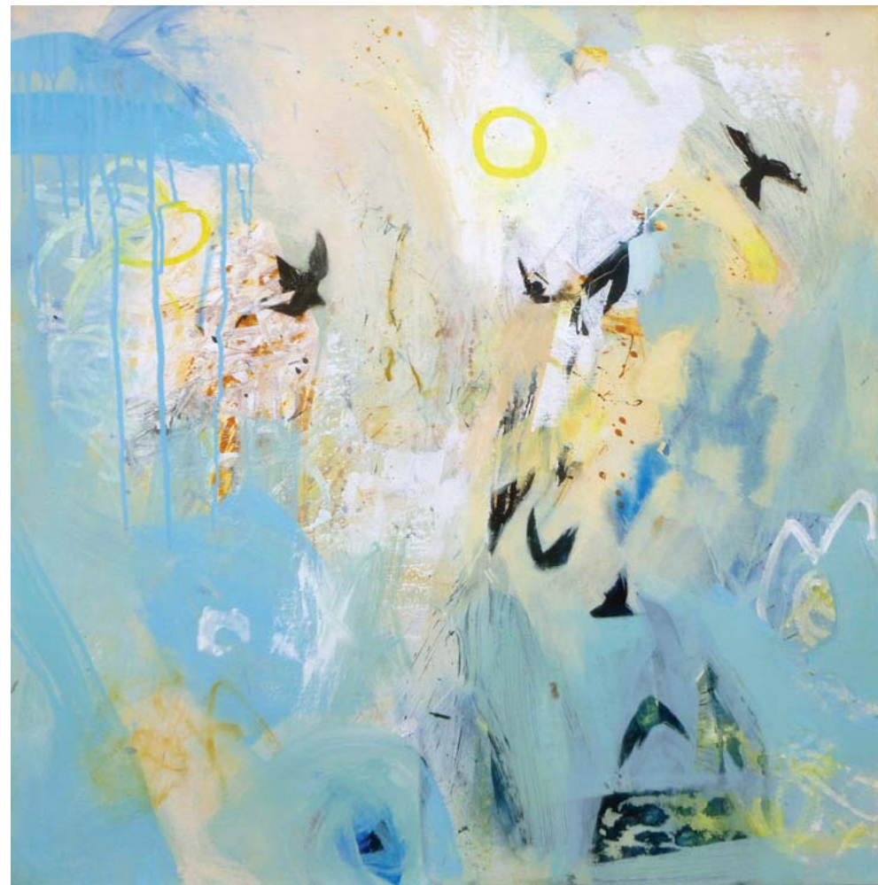
7. Soaring mixed media on canvas | 80 x 80 cm