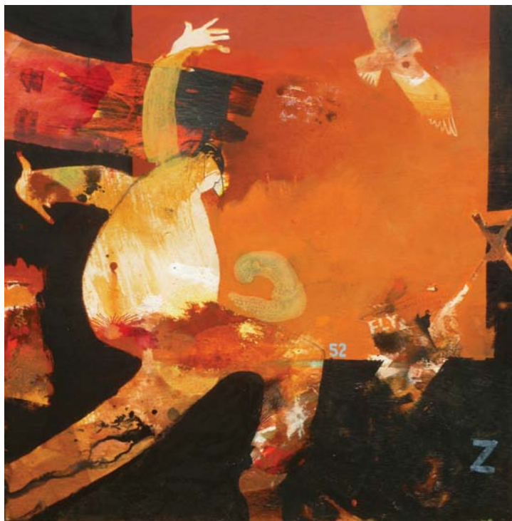
2. Fly | mixed media on wooden panel | 50 x 50 cm