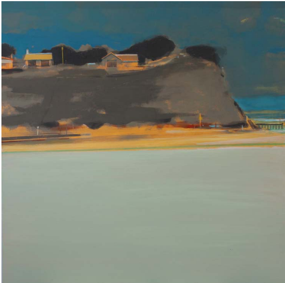
19. Beach Houses, Hayle acrylic on canvas | 100 x 100 cm