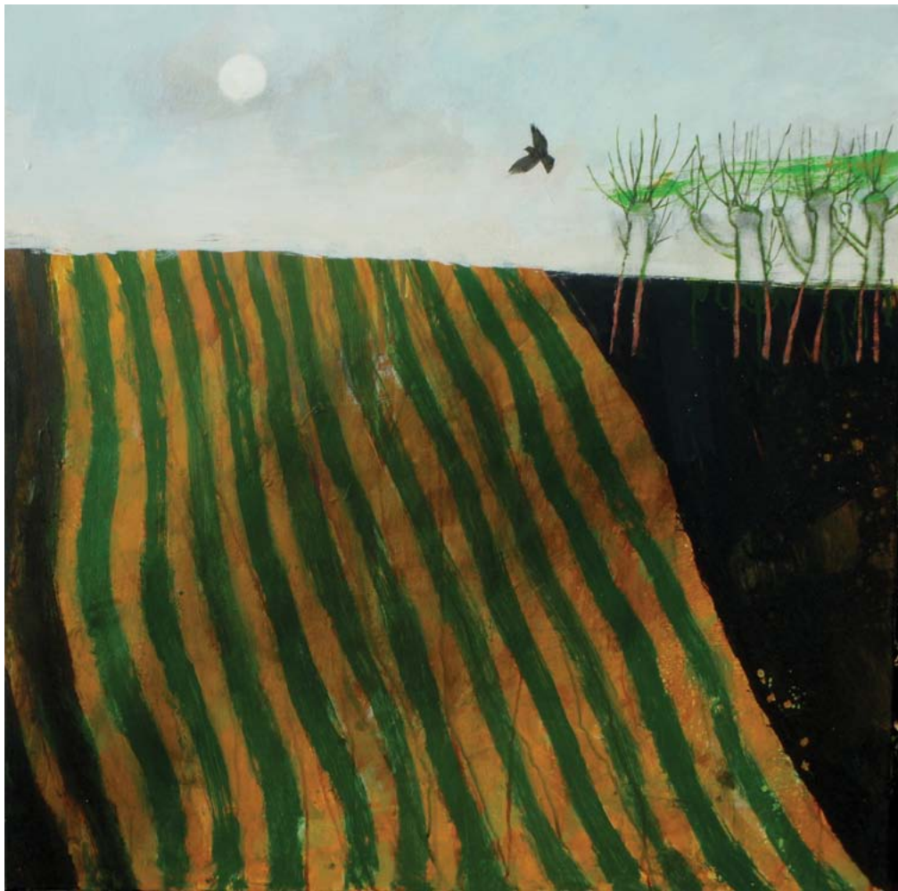
6. Over Crispers Field mixed media on canvas | 80 x 80 cm