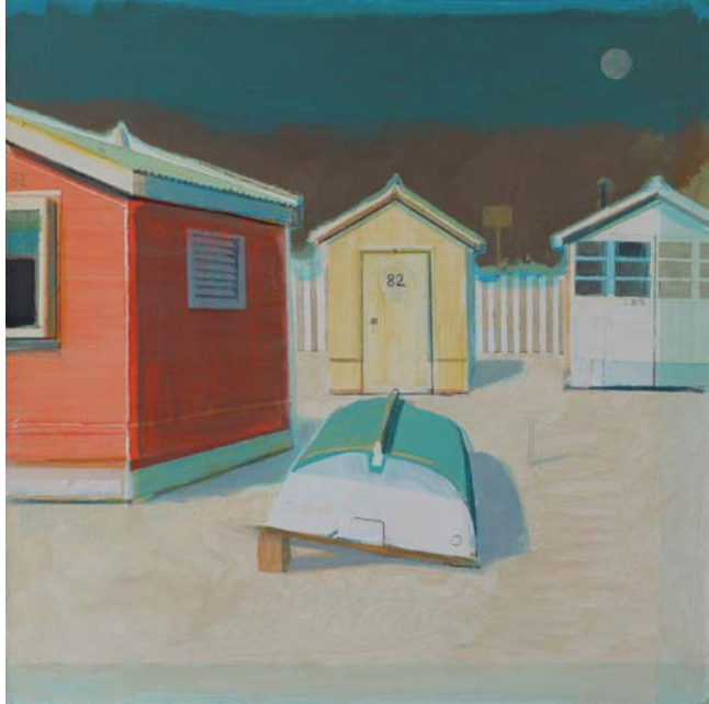
15. Beach Huts in Sunshine | acrylic on board | 30 x 30 cm