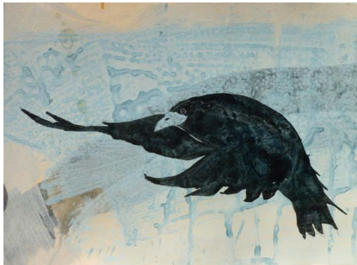
8. Being Rookish | mixed media on paper | 21 x 27 cm