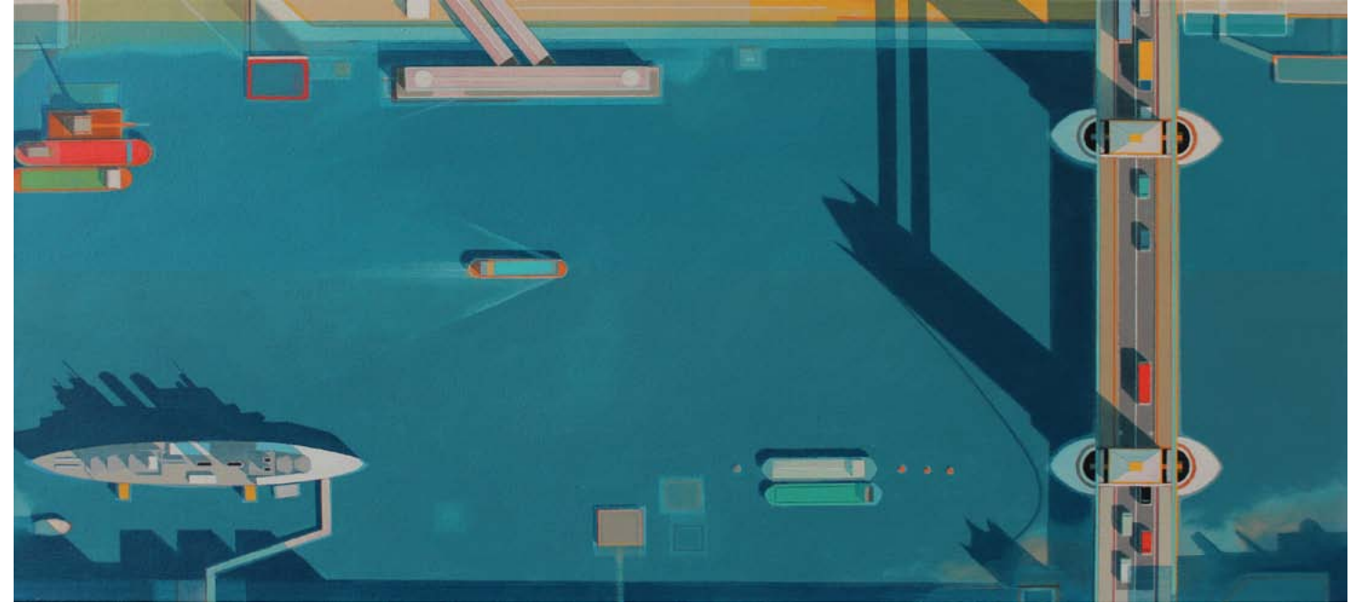
16. HMS Belfast and Tower Bridge, Morning Sun | acrylic on canvas | 45 x 100 cm