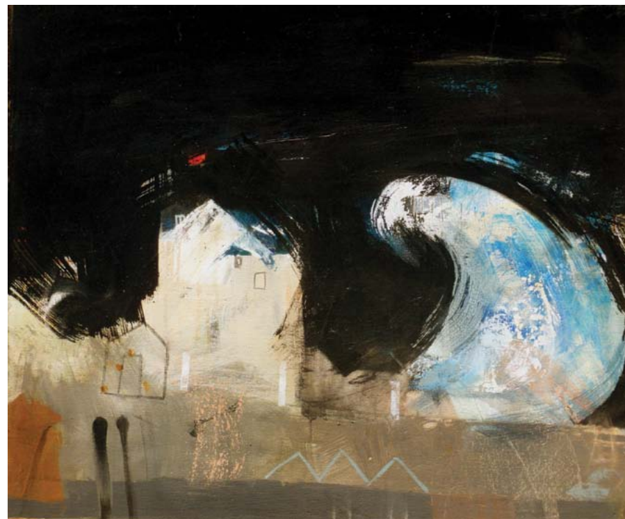
3. St. Ives, Night | mixed media on canvas | 50 x 60 cm