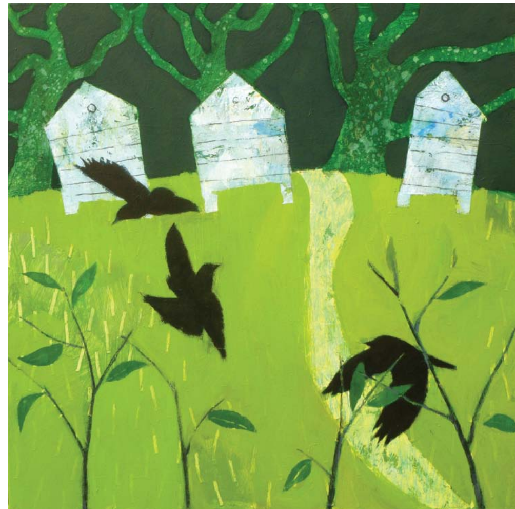
9. Garden Jackdaws mixed media on canvas | 80 x 80 cm