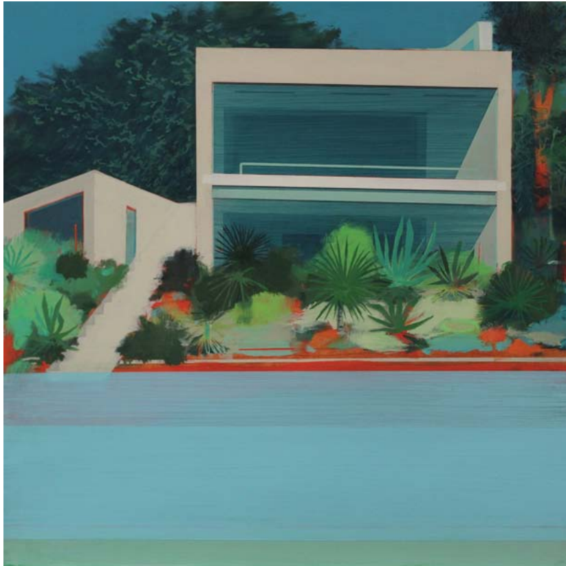
13. Creek Vean, Cornwall | acrylic on board | 50 x 50 cm