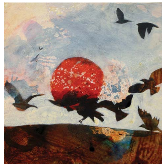
5. Sunset Rooks | mixed media on wooden panel | 30 x 30 cm