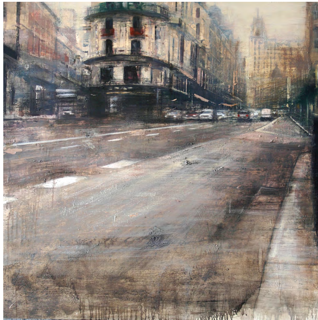
18. Madrid | oil on panel | 100 x 100 cm