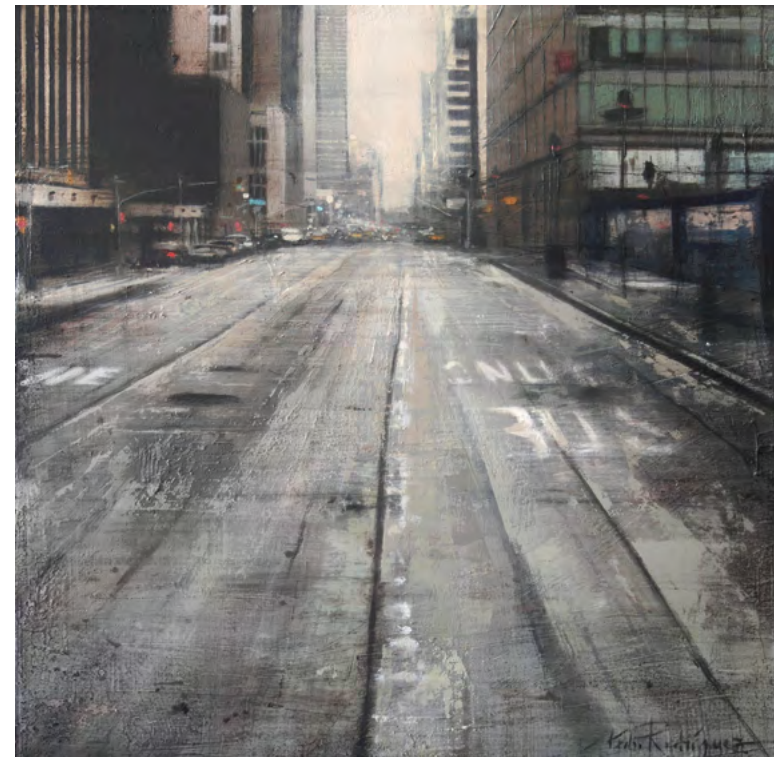
20. Grey Street, New York | oil on panel | 60 x 60 cm