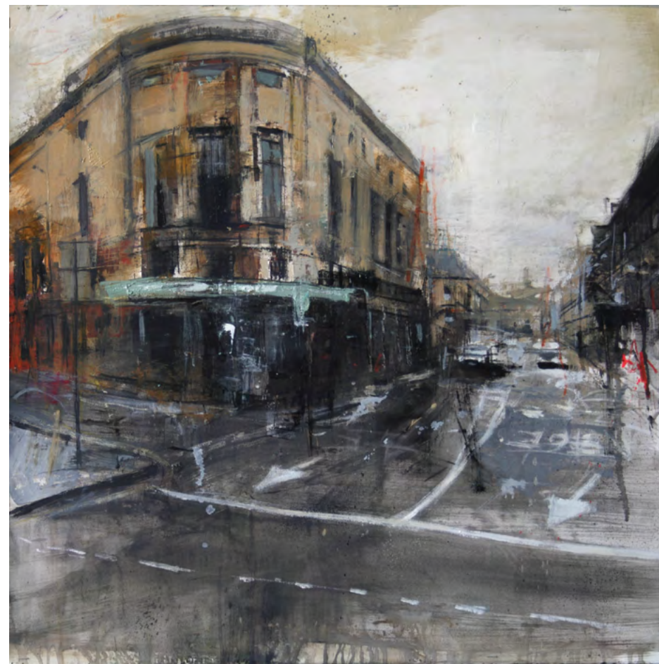
14. The Forum, Bath | mixed media on paper | 66 x 66 cm