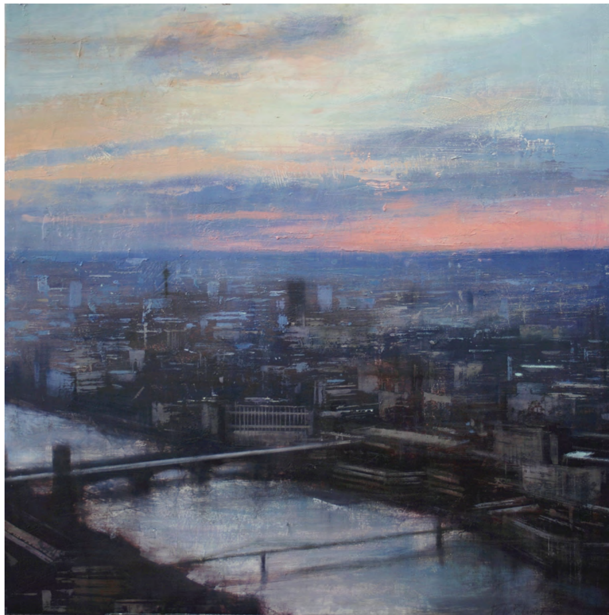
11. Sunset in London | oil on panel | 120 x 120 cm