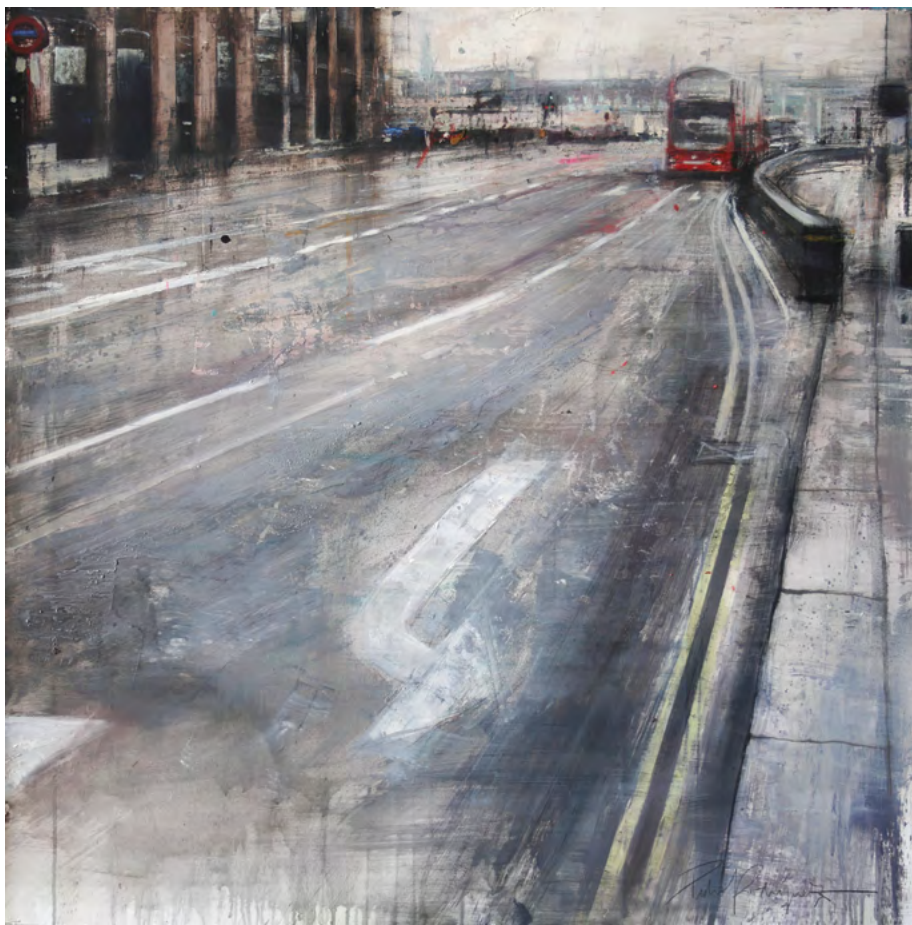
23. Westminster Bridge, London | mixed media on paper | 93 x 93 cm