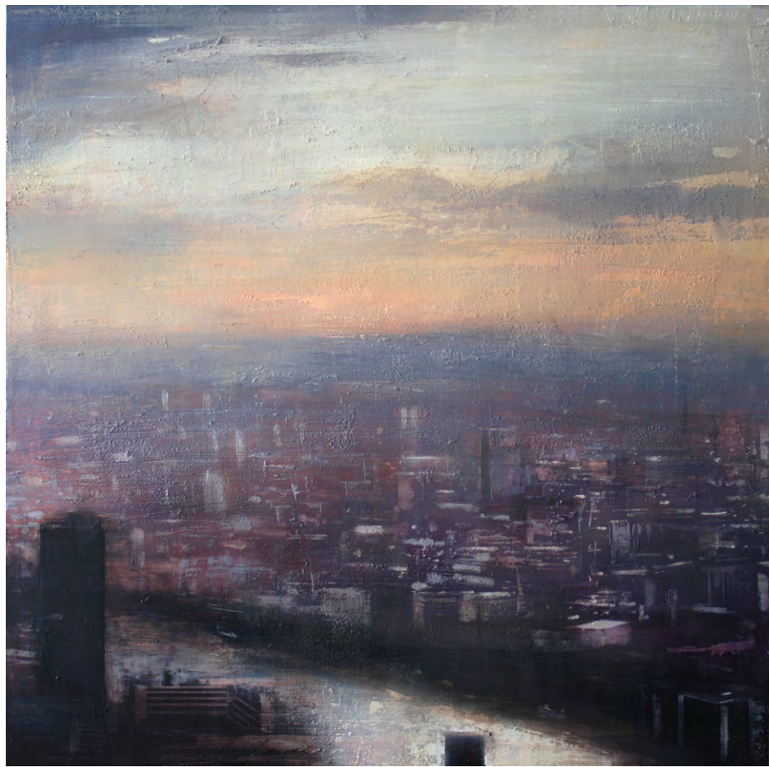
13. Last Light, London | oil on panel | 100 x 100 cm