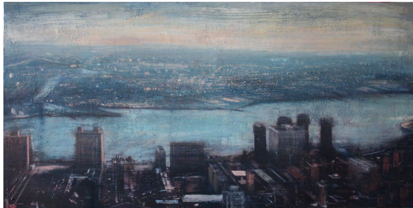
9. Sunny Day, New York | oil on panel | 50 x 100 cm