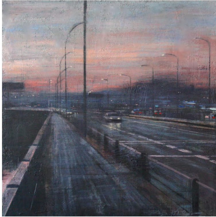
2. Pink Sunset Seville | oil on panel | 60 x 60 cm