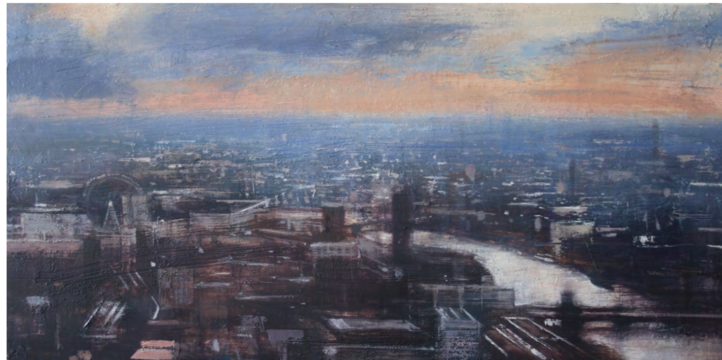
5. Panoramic View, London | oil on panel | 50 x 100 cm