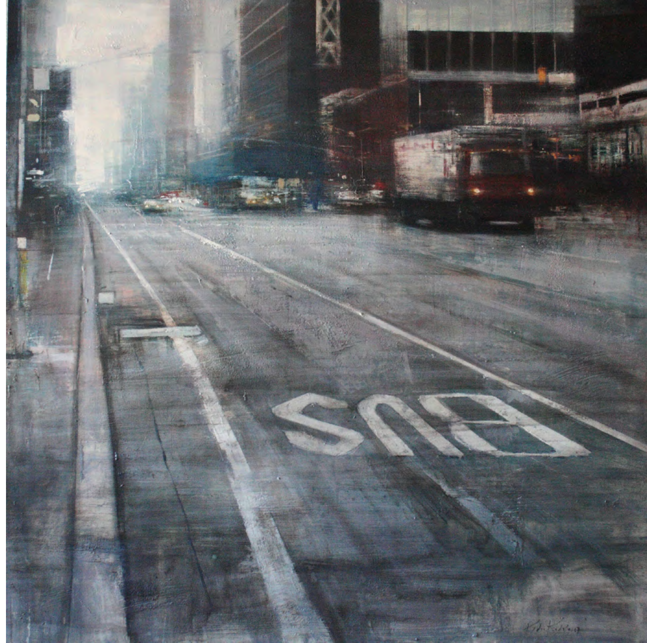
12. Coudy Morning, Manhattan | oil on panel | 150 x 150 cm