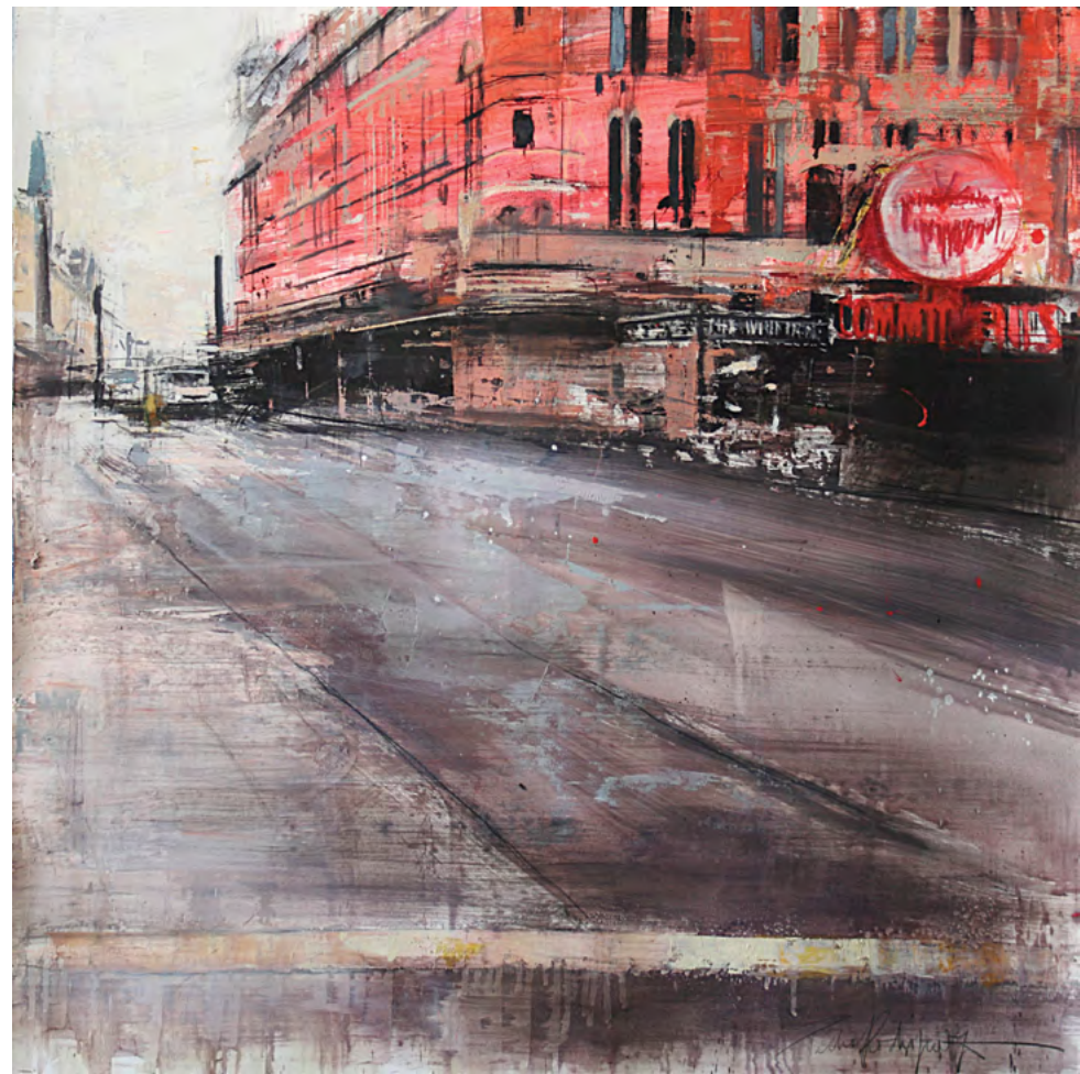
16. Shaftsbury Avenue, London | mixed media on paper | 93 x 93 cm