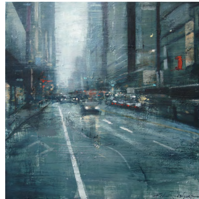
22. Monday, New York | oil on panel | 50 x 50 cm