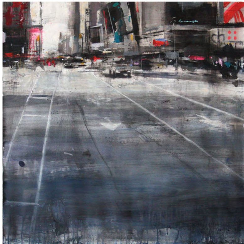
8. Times Square, New York | mixed media on paper | 66 x 66 cm