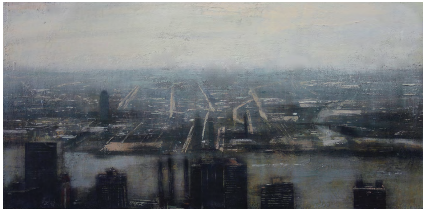
19. View from Empire State, New York | | oil on panel | 61 x 122 cm