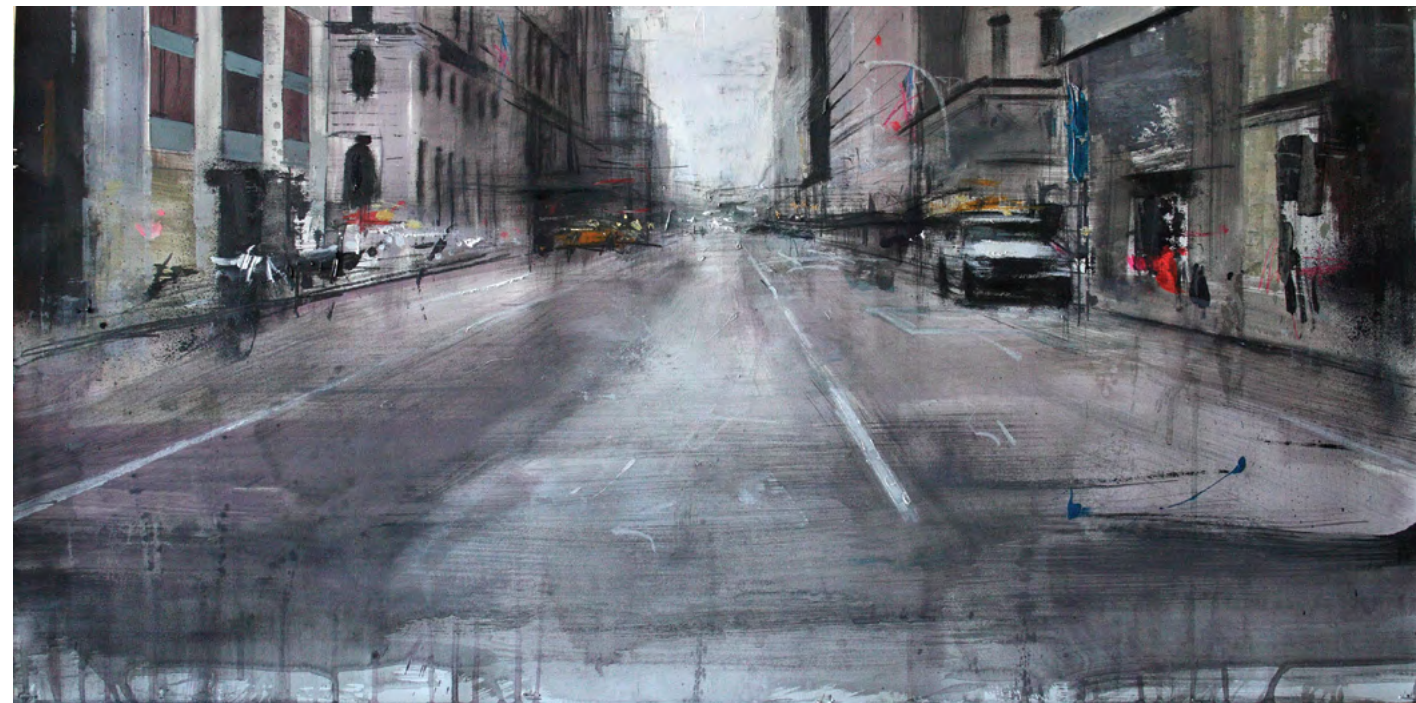
7. Fifth Avenue, New York | mixed media on paper | 47 x 94 cm