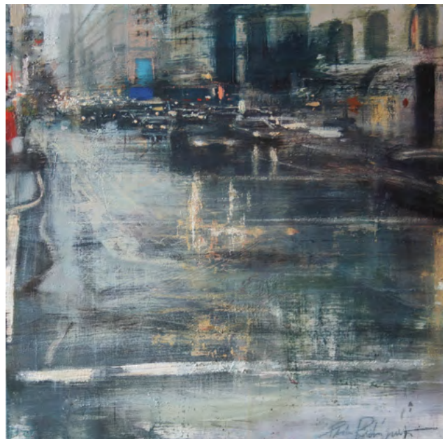
4. Rainy Day in Manhattan | oil on panel | 50 x 50 cm