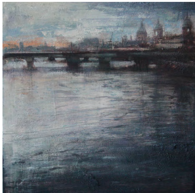
17. River Thames | oil on panel | 35 x 35 cm