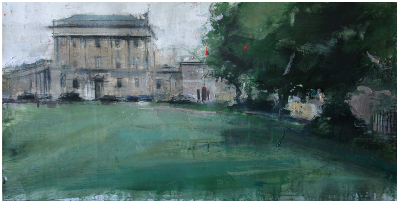
15. Royal Crescent, Bath II | mixed media on paper | 47 x 94 cm