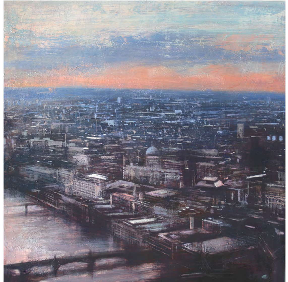
1. St. Paul's, London | oil on panel | 100 x 100 cm