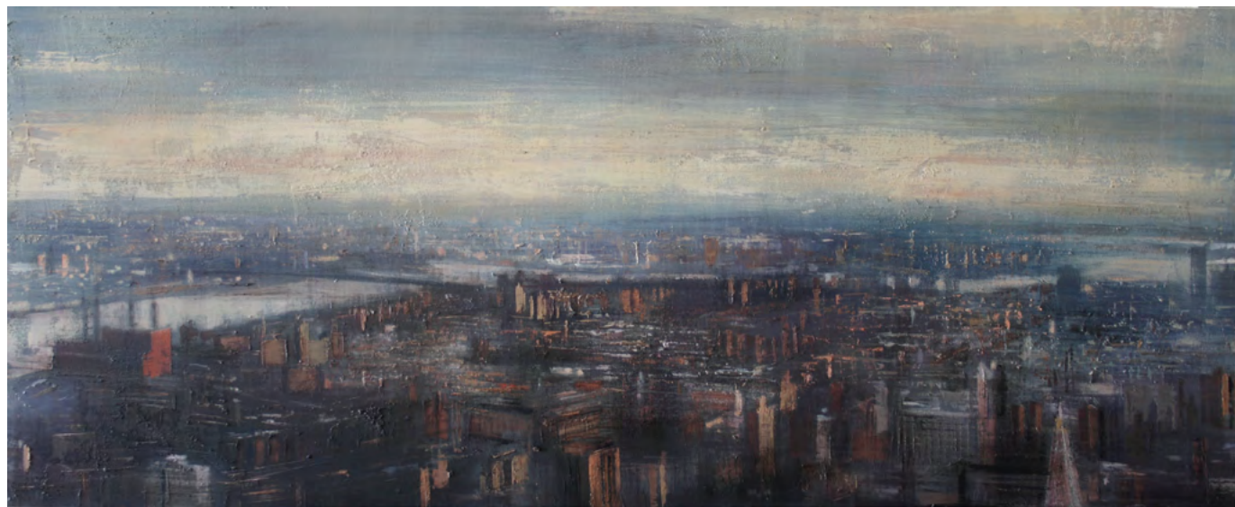
21. View from Empire State, New York II | oil on panel | 50 x 122 cm