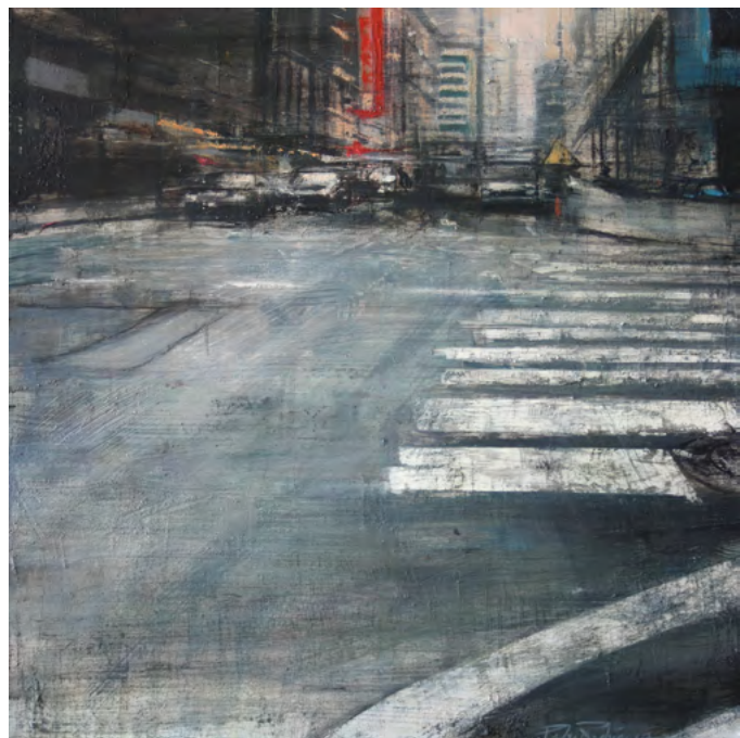
6. 42nd Street, New York | oil on panel | 60 x 60 cm