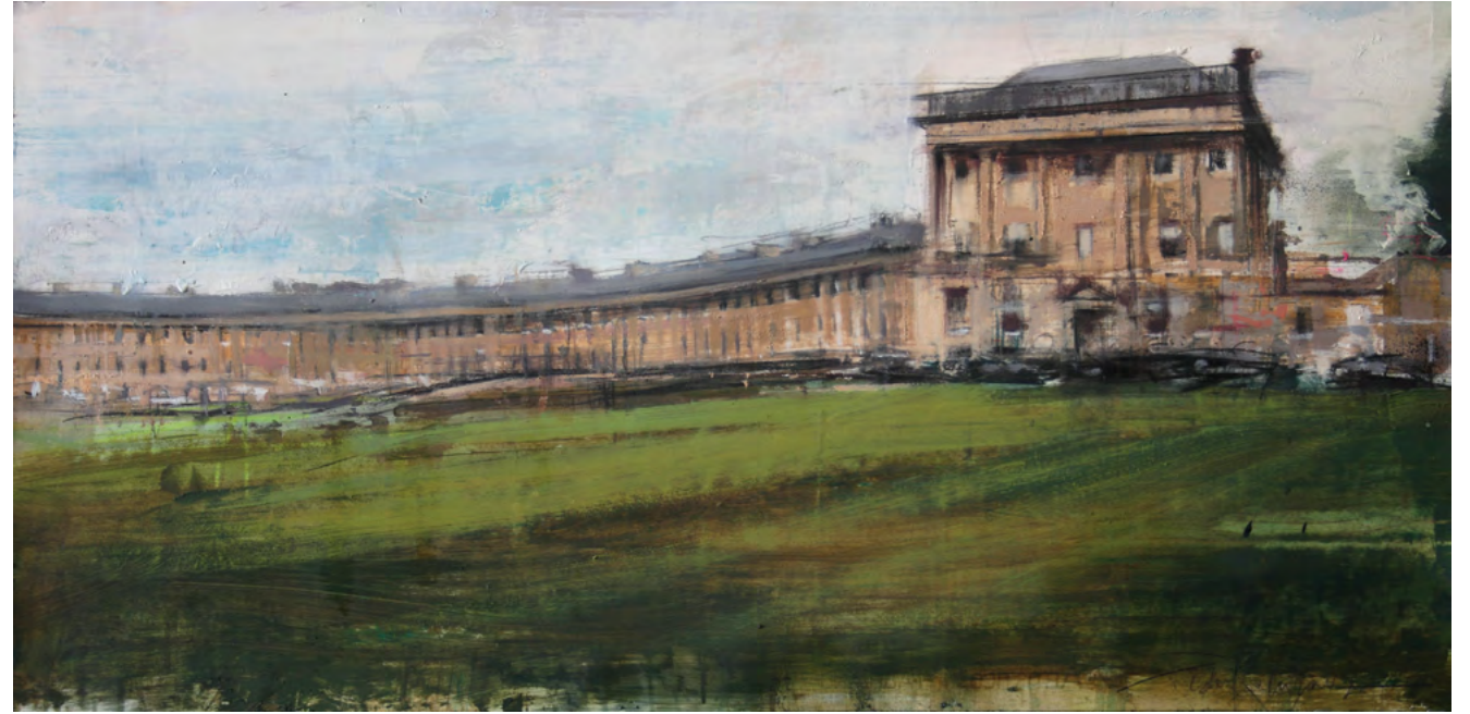
3. Royal Crescent, Bath I | mixed media on paper | 47 x 94 cm