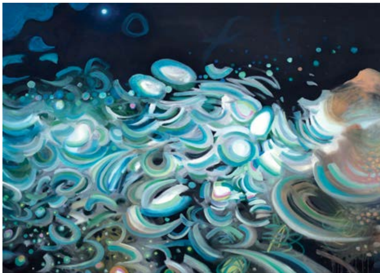
19. The Sound of the Waves oil on canvas 140 x 190 cm