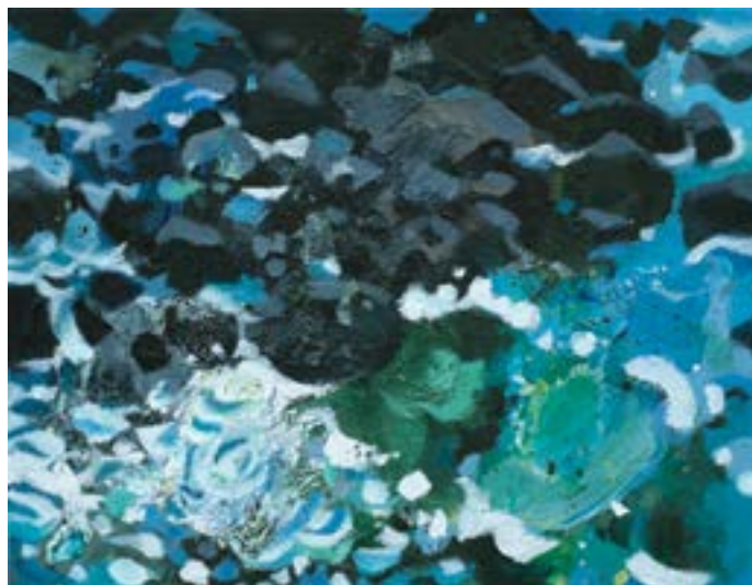
15. Pallet 82 oil on canvas 30 x 40 cm