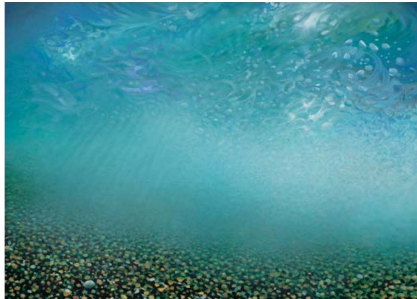
13. The Turmoil of the Shadows oil on canvas 100 x 140 cm