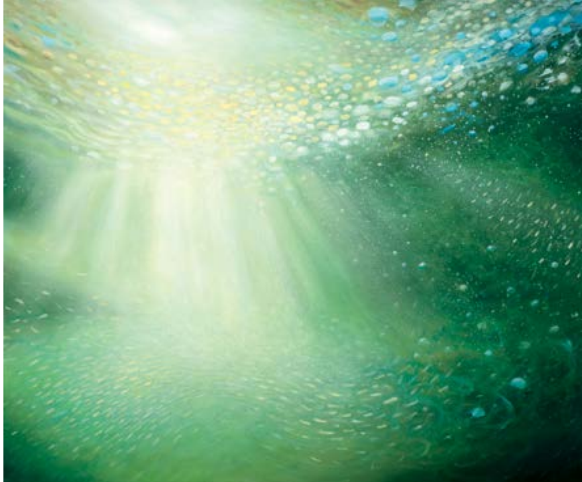
8. Drift oil on canvas 100 x 120 cm