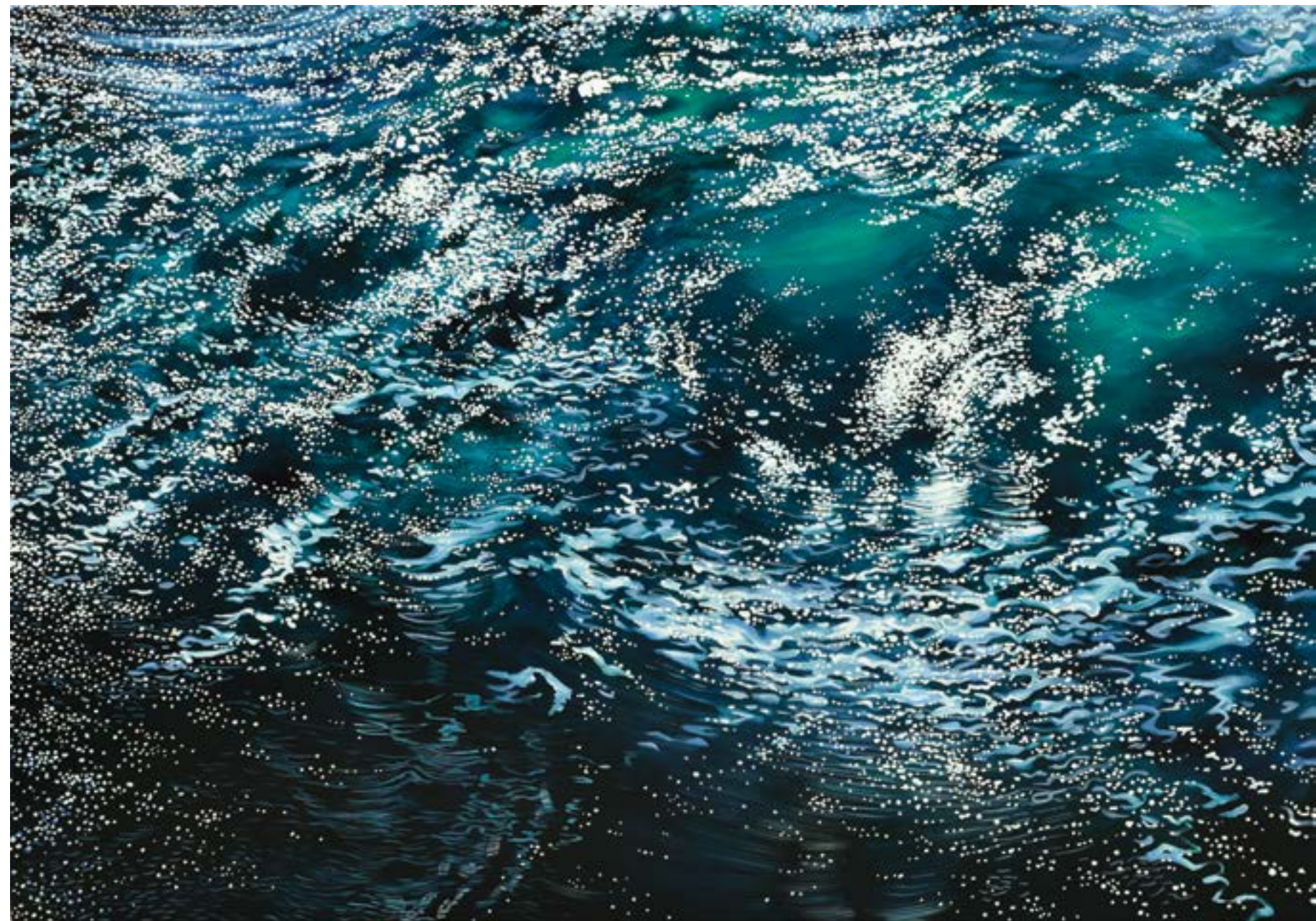
3. The Sea oil on canvas 160 x 225 cm