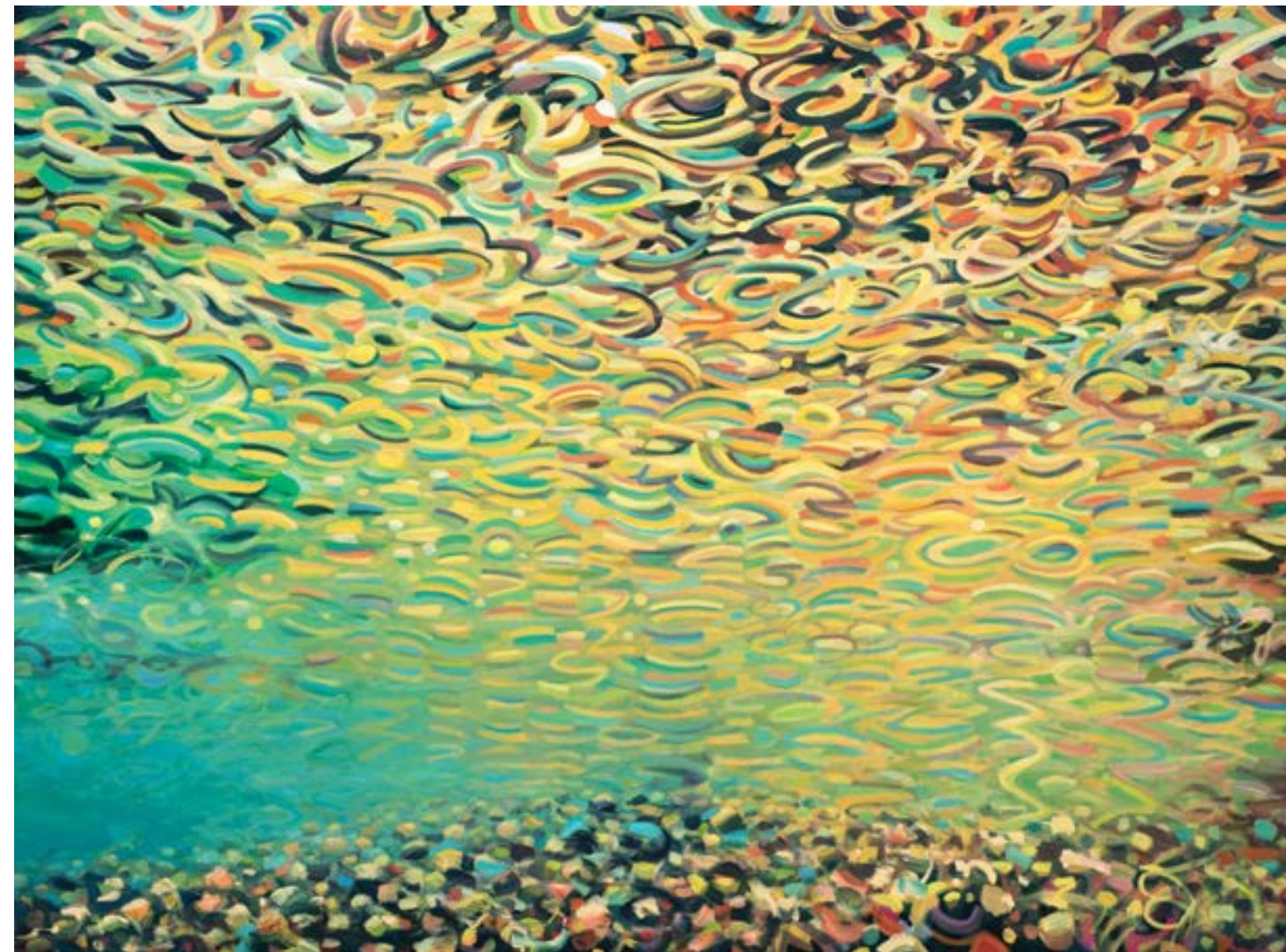
18. Exuberance oil on canvas 140 x 190 cm