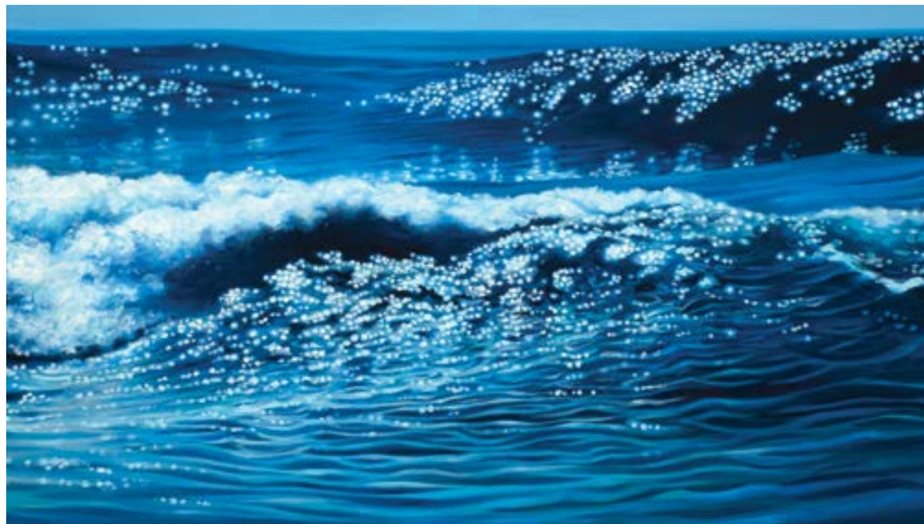
2. Rolling in oil on canvas 80 x 140 cm