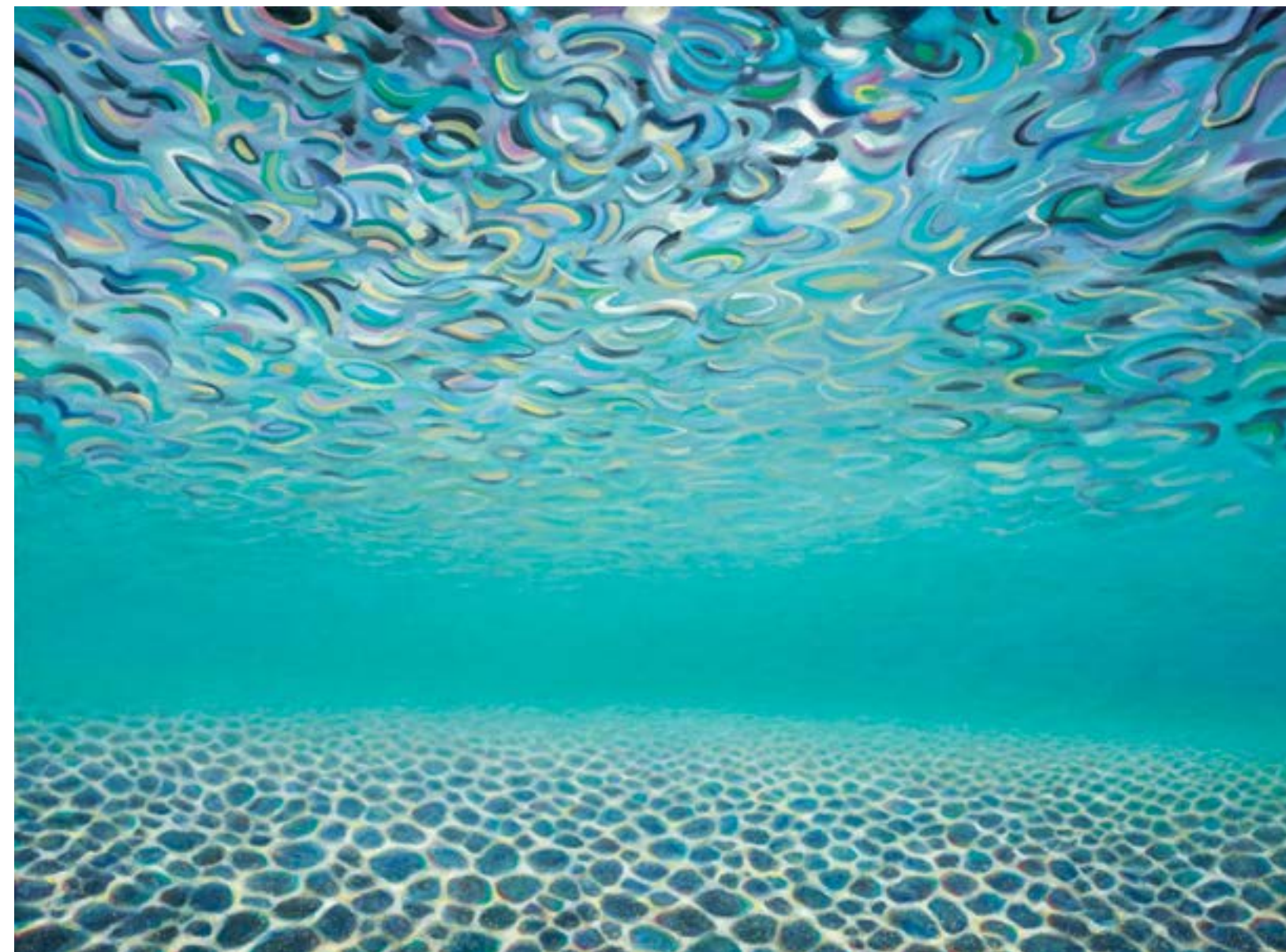
16. Shwimmer oil on canvas 140 x 190 cm