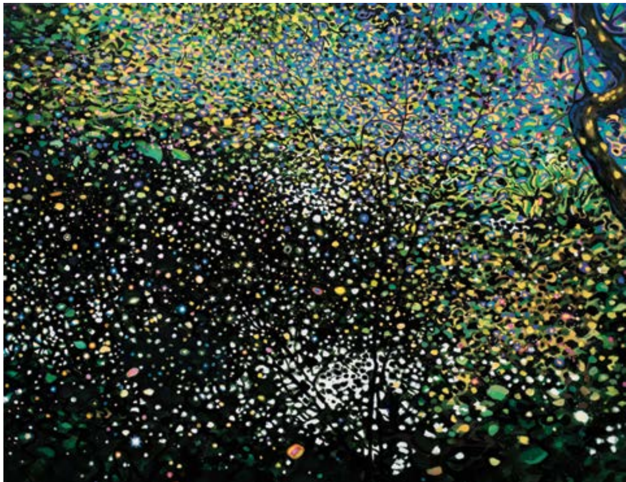
4. Cosmic Backwater oil on canvas 100 x 140 cm