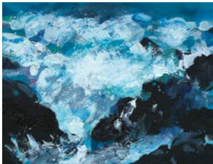
14. Pallet 83 oil on canvas 30 x 40 cm