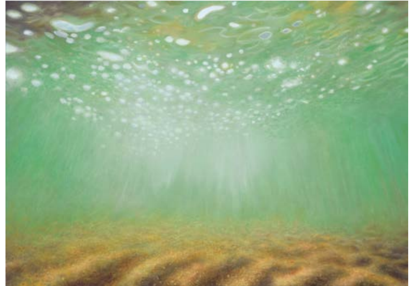
9. Warm Shallows oil on canvas 100 x 140 cm