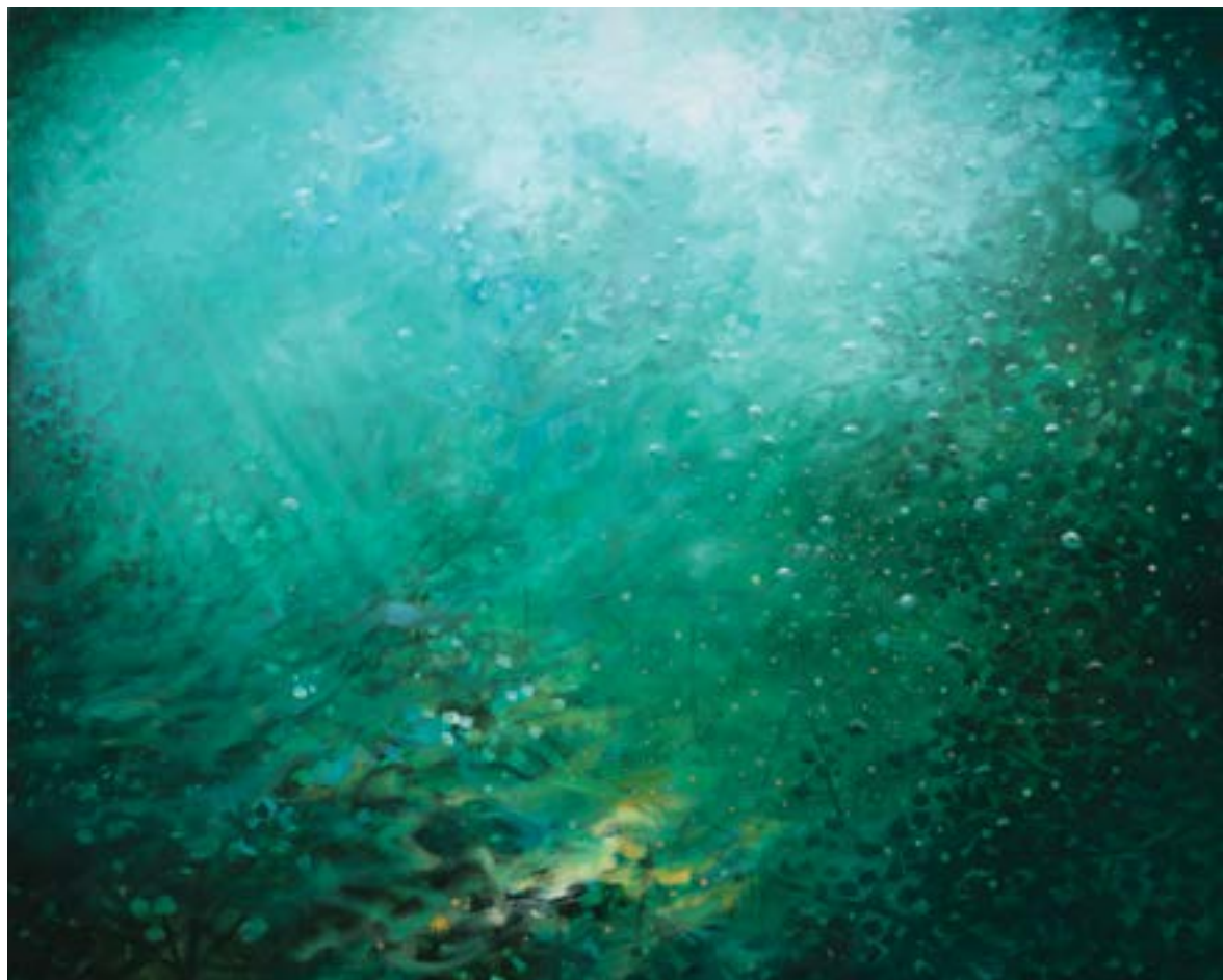
17. Aquamist oil on canvas 80 x 100 cm