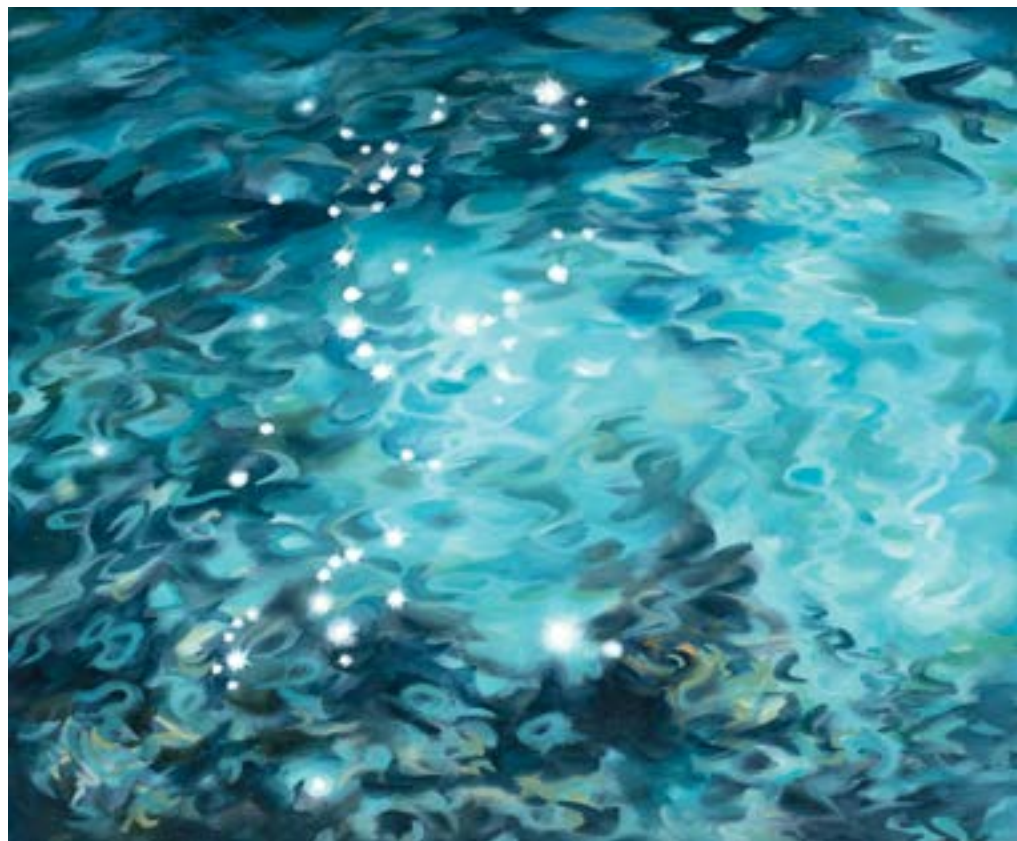
12. Dive In oil on canvas 75 x 90 cm