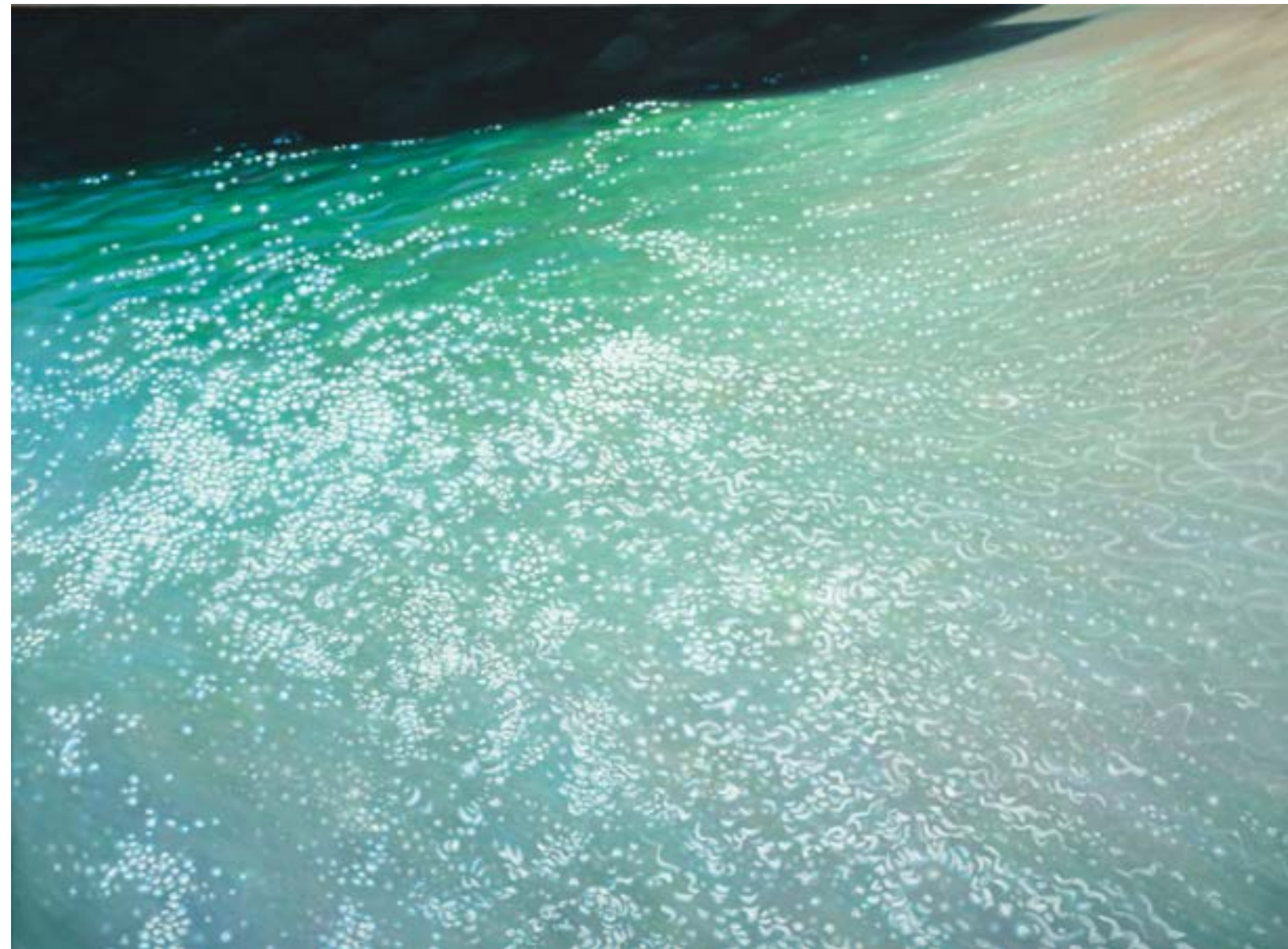
7. Breathe oil on canvas 140 x 190 cm