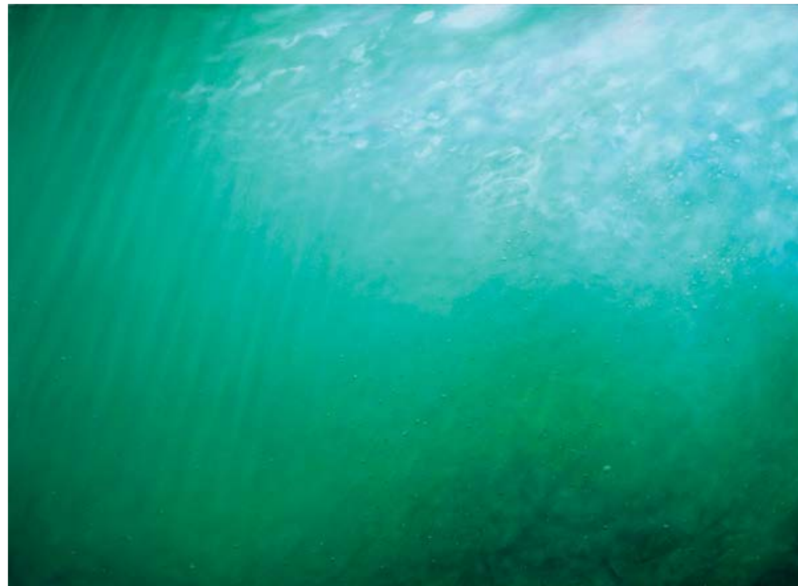
11. Float oil on canvas 140 x 190 cm