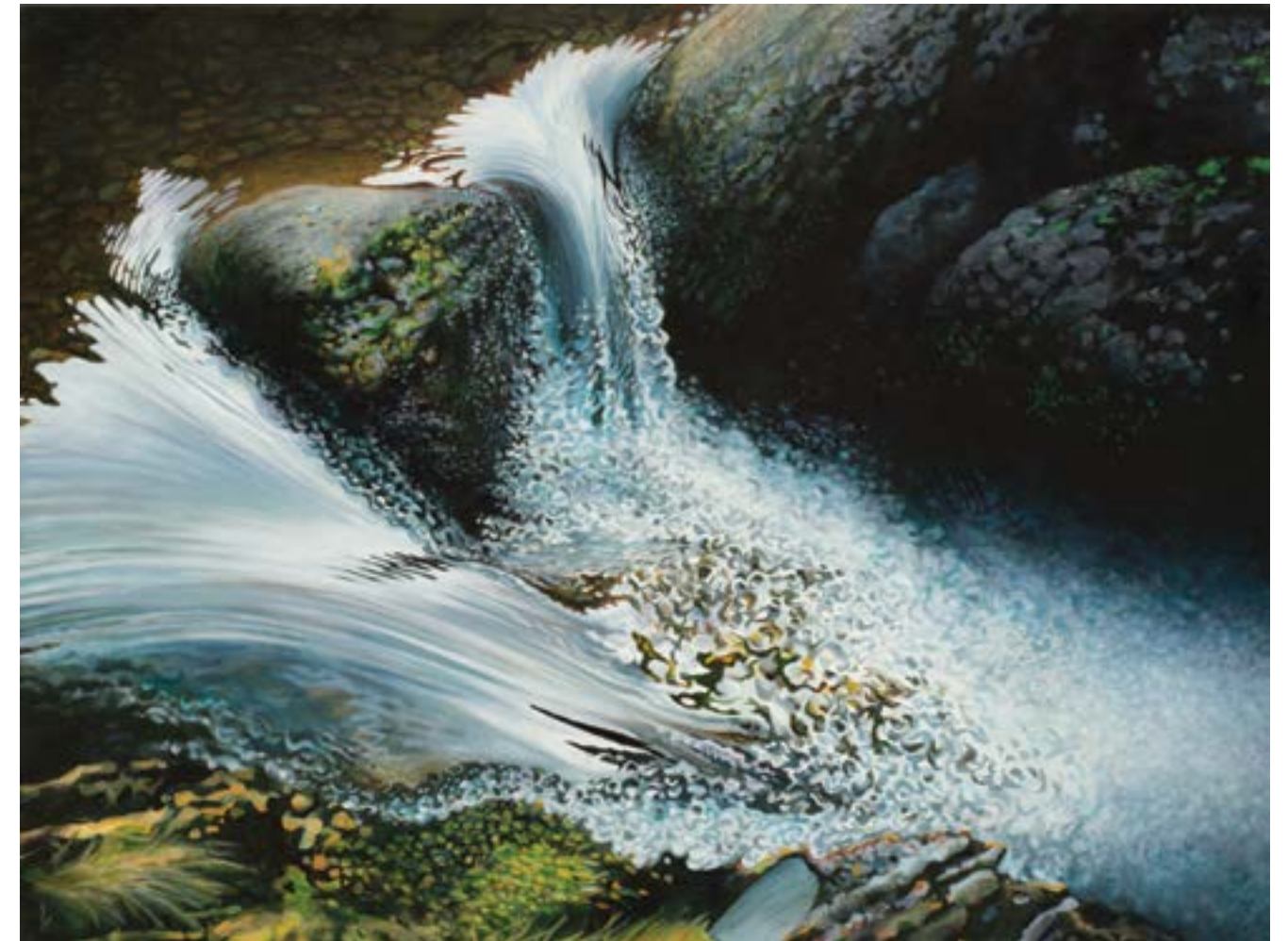
1. Mountain Stream oil on canvas 83 x 120 cm