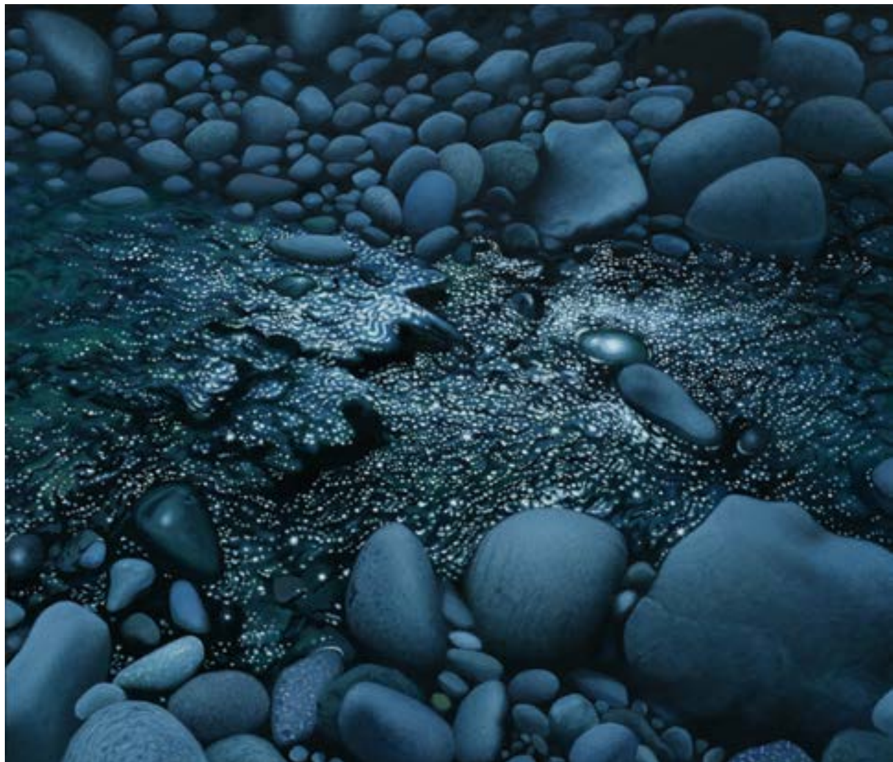
6. Passage of Time oil on canvas 120 x 140 cm