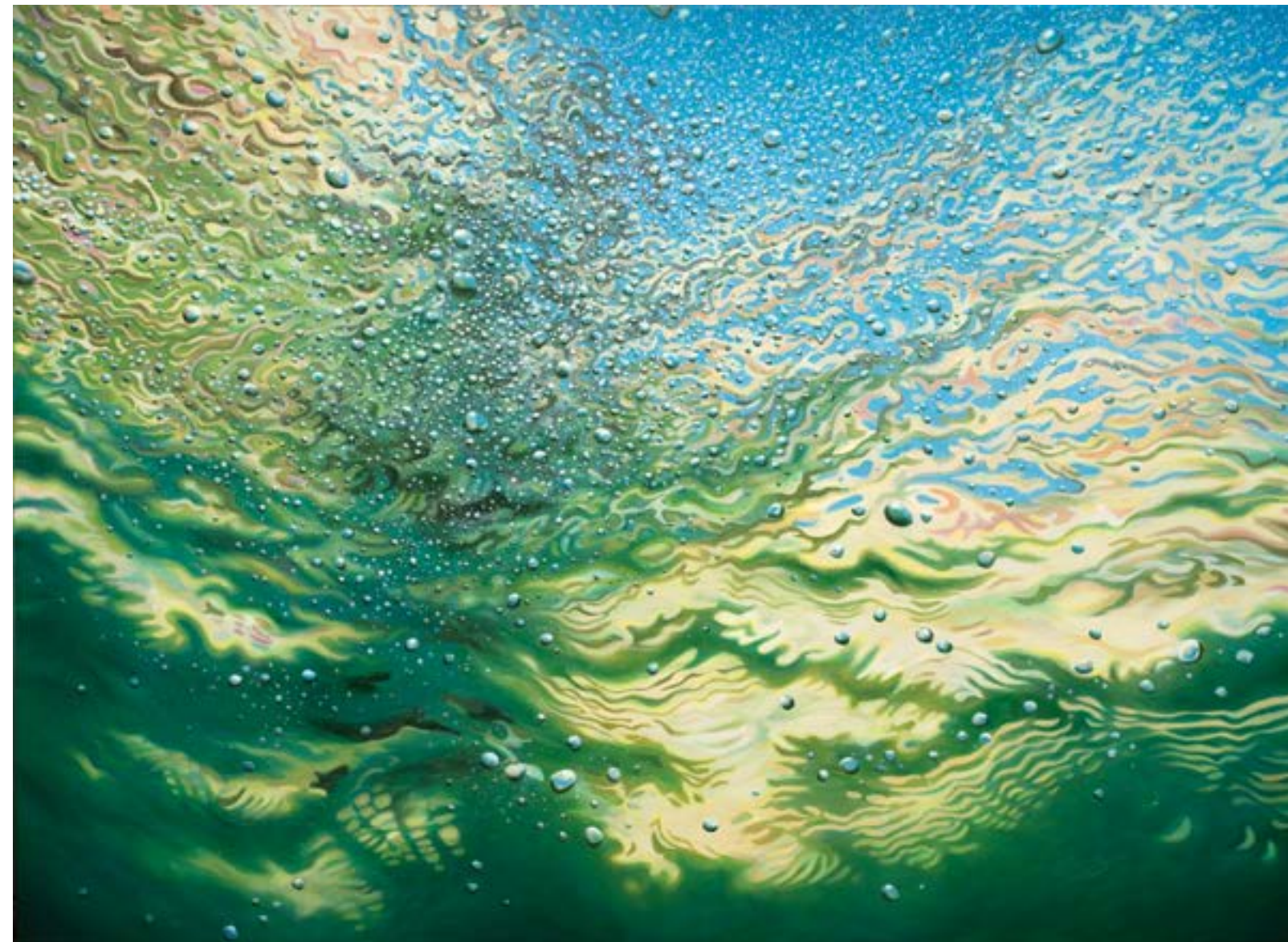
5. Water Window oil on canvas 140 x 190 cm