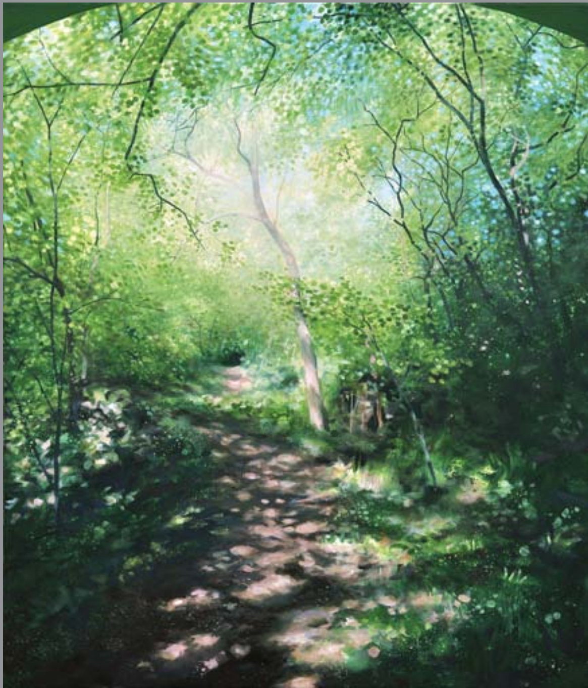
7. Birdsong oil on canvas 140 x 120 cm