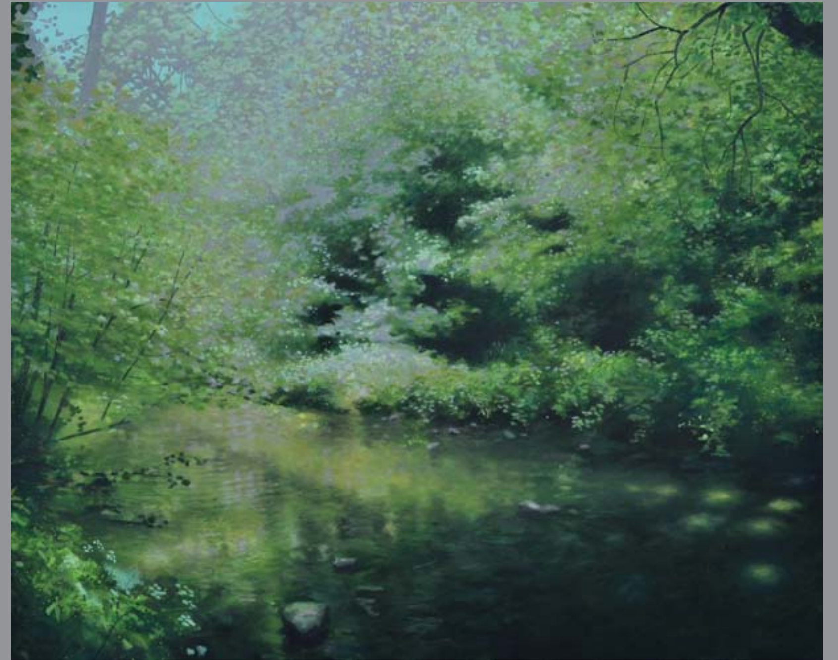
3. The Stillness of a Summers Day oil on canvas 130 x 160 cm