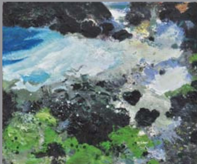
14. Pallet 49 - Cove oil on canvas 25 x 30 cm