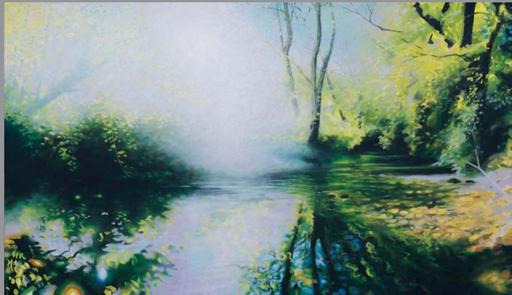
20. The Promise of the Day oil on canvas 110 x 190 cm