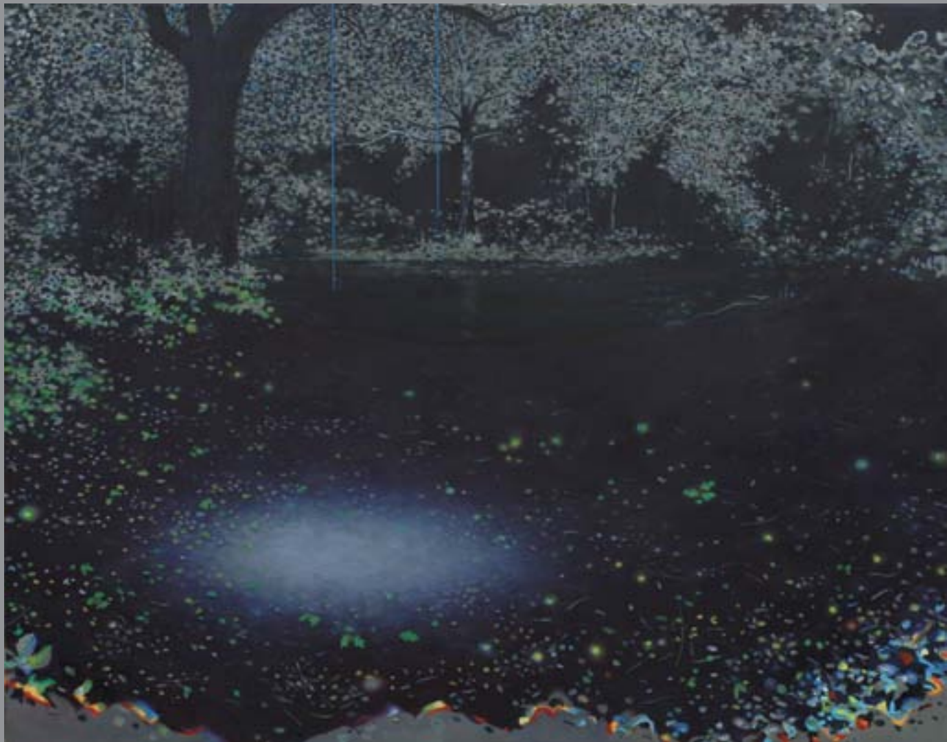
11. Dark Matter oil on canvas 90 x 120 cm