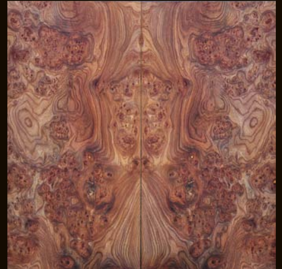
The Green Man - (Exterior) 90 x 90 cm

Permanent Collection of the Paisley Art Institute 1993 Royal Society of Arts Student Show, Edinburgh 1994 Animation Festival, Bremen & Hamburg, Germany 1996 Video Installation, Costa Caparica, Portugal. 1996 Will's Art, Fulham, London. 1997- 03 Cadogan Contemporary. Group shows. 1997- 08. Watermans Art Centre 1997 106 Gallery, Sclater st. London.E1, 1998 The Rack Gallery, Tyers Gate, London.SE1. 1998 The Barbican VSO Show London 1998 The City Gallery, London. EC2. 1999 An Tuireann Arts Centre, Isle of Skye. 1999 International Art Consultants, London E1 2000,01,02 Mural Commission for HMS President, London 2000 Curated & exhibited 'Lambda', Rhythm Factory. E1 2001 Cadogan Contemporary. London. 2002, 04, 05, 07, 08 Wylve Valley Art Trail 09 The Adam Gallery Bath 09 Farrington Contemporary Gibraltar solo show 09