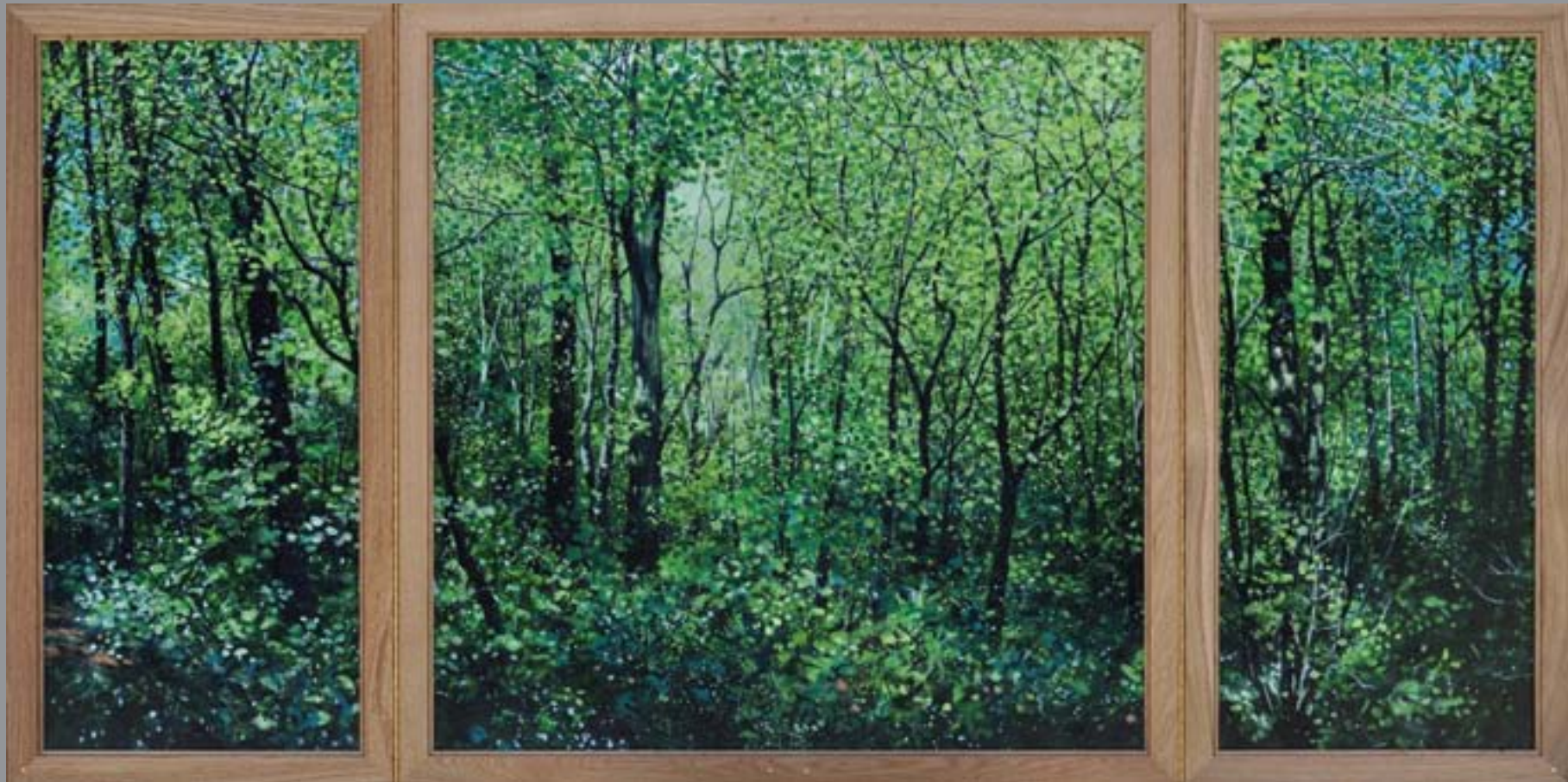
22. The Green Man oil on canvas 90 x 45 cm 90 x 90 cm 90 x 45 cm