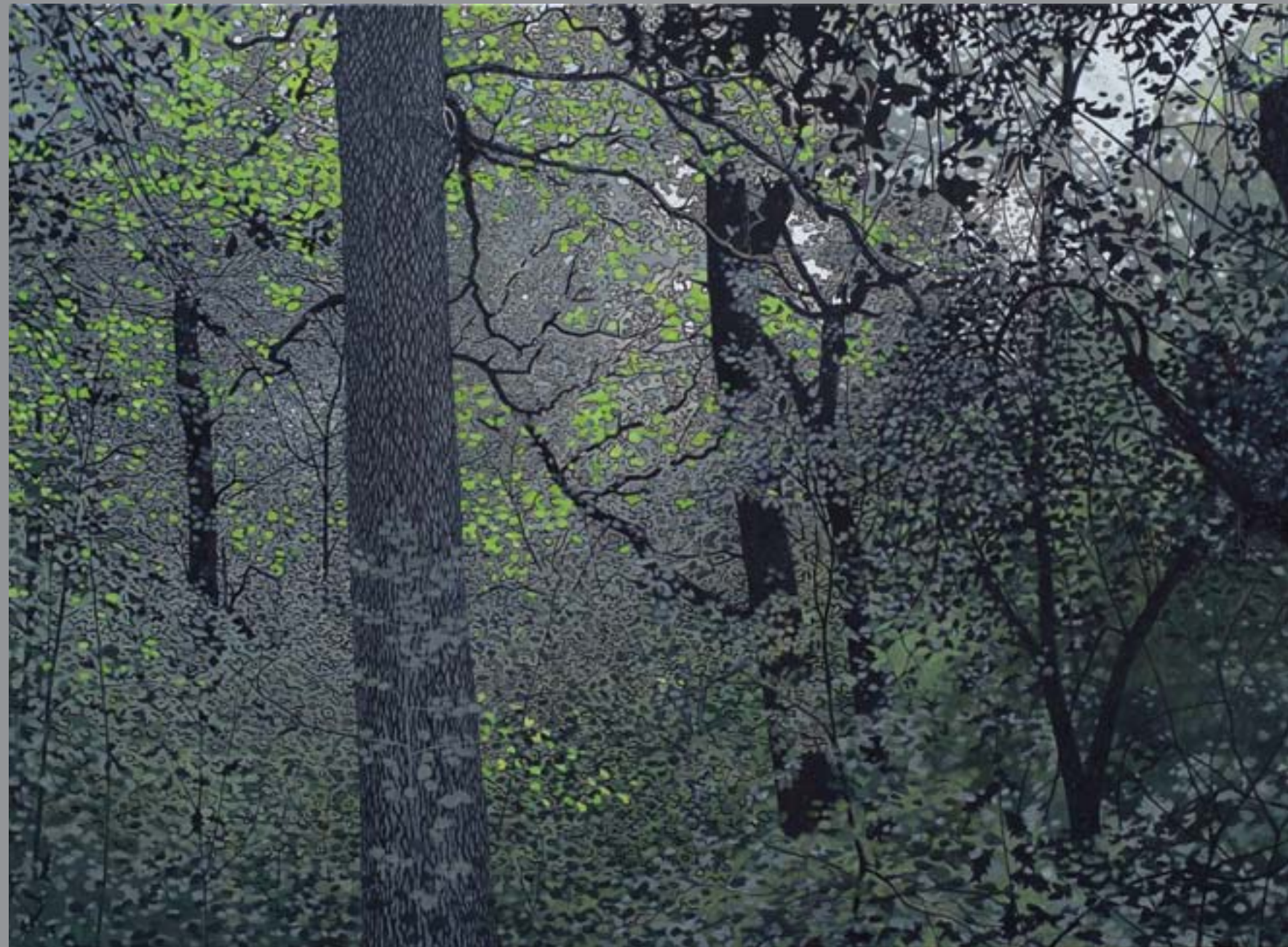
10. The Woods for the Trees oil on canvas 140 x 190 cm