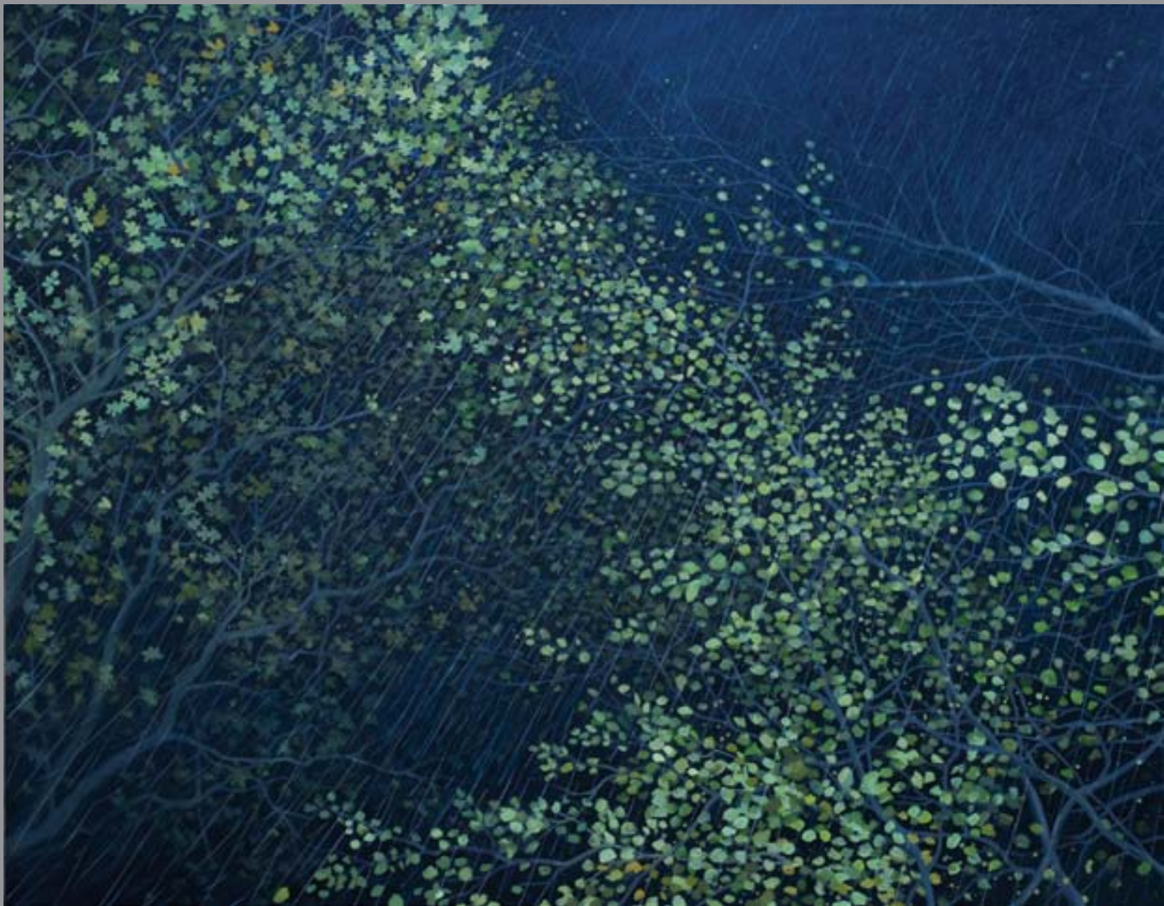
9. The First Wild Night oil on canvas 140 x 190 cm