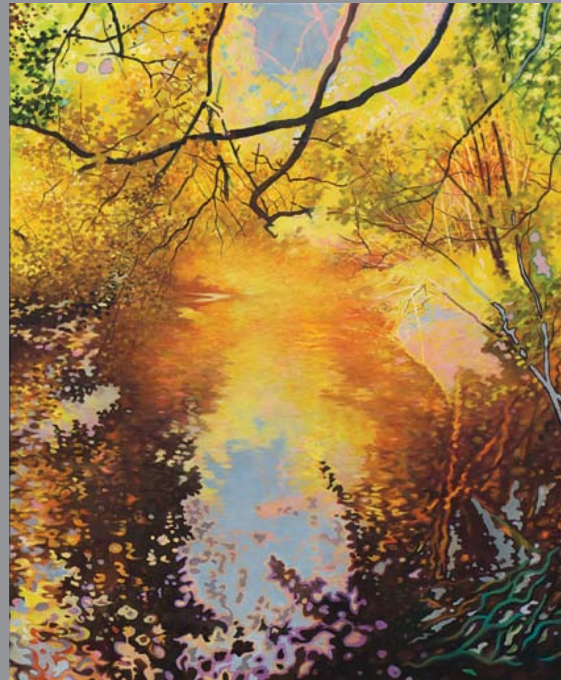
21. The Bend in the River oil on canvas 140 x 190 140 x 100 cm