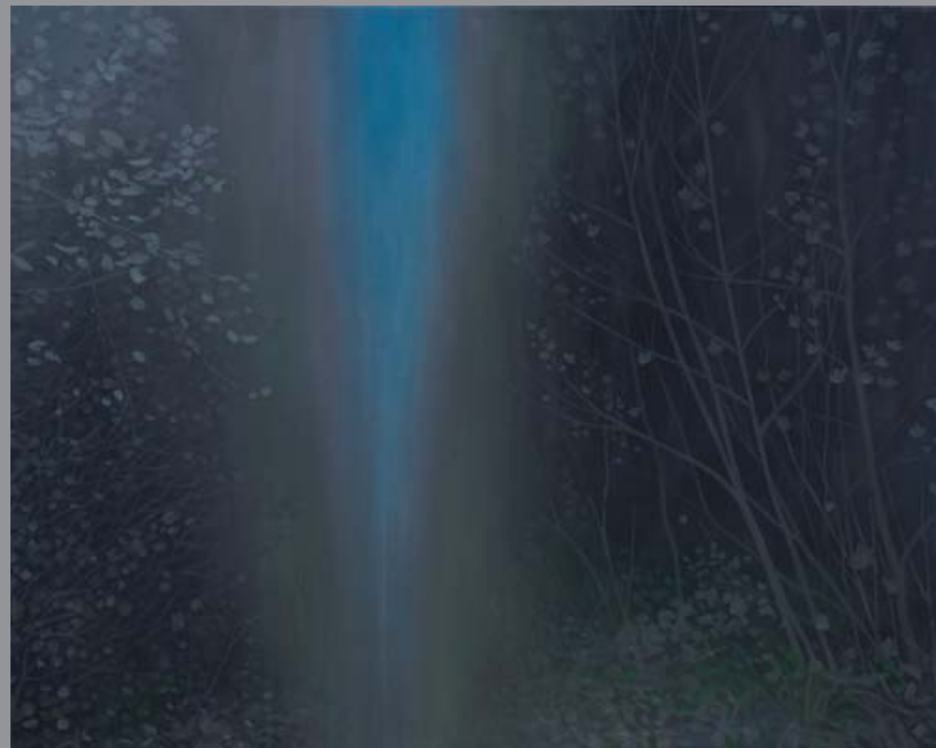
6. The Light Seeps in oil on canvas 80 x 100 cm