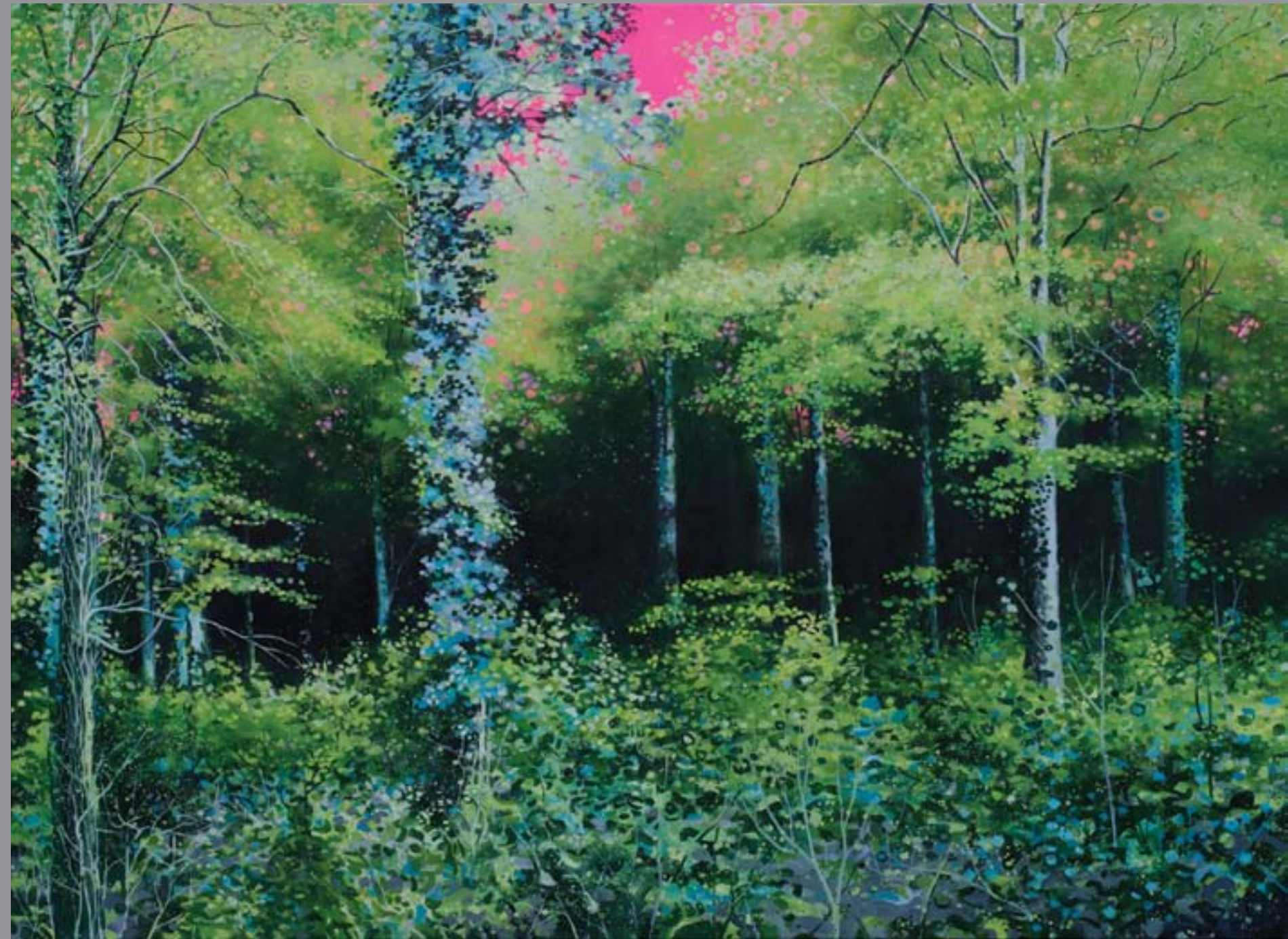
2. Cern's Return oil on canvas 140 x 290 cm