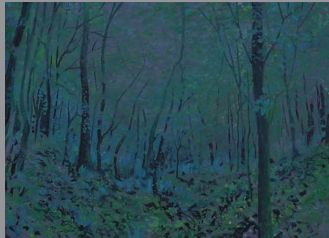
18. Subterranean Wood oil on canvas 80 x 110 cm