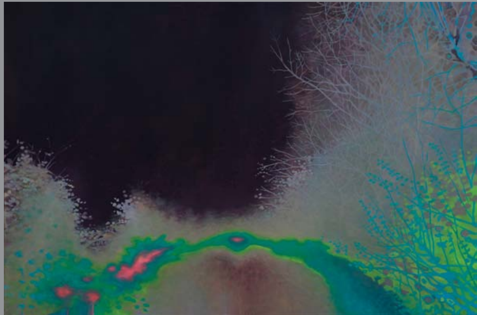
12. Lane End oil on canvas 80 x 120 cm