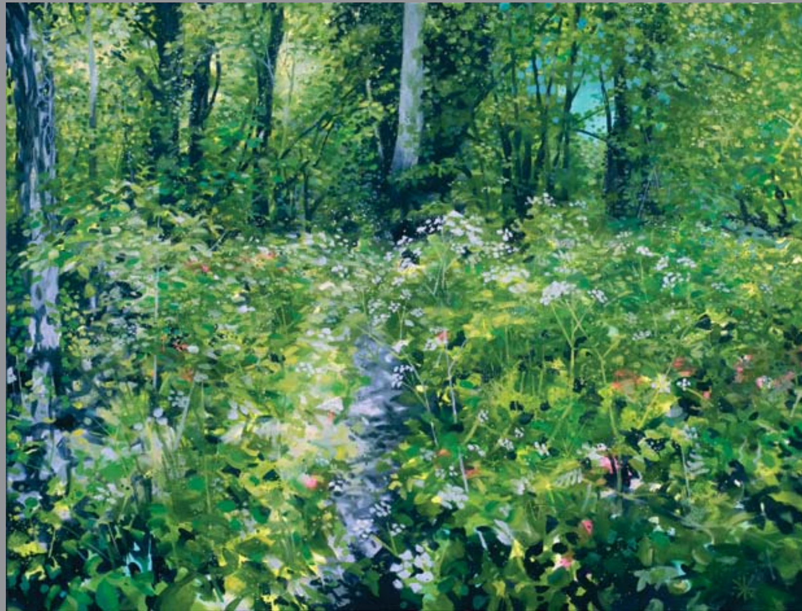
15. Secret Path oil on canvas 130 x 170 cm