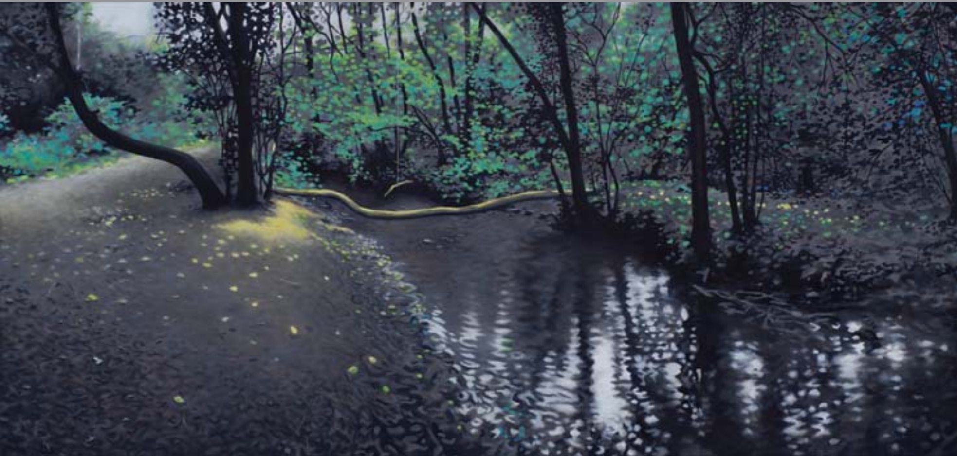
1. Bridge oil on canvas 90 x 140 cm