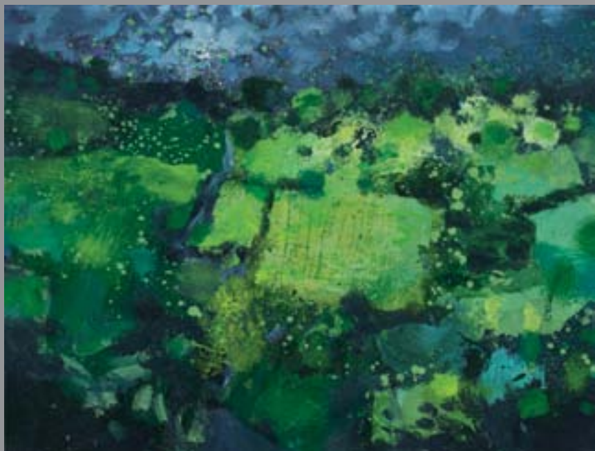
13. Pallet 50 - Vale oil on canvas 31 x 40 cm