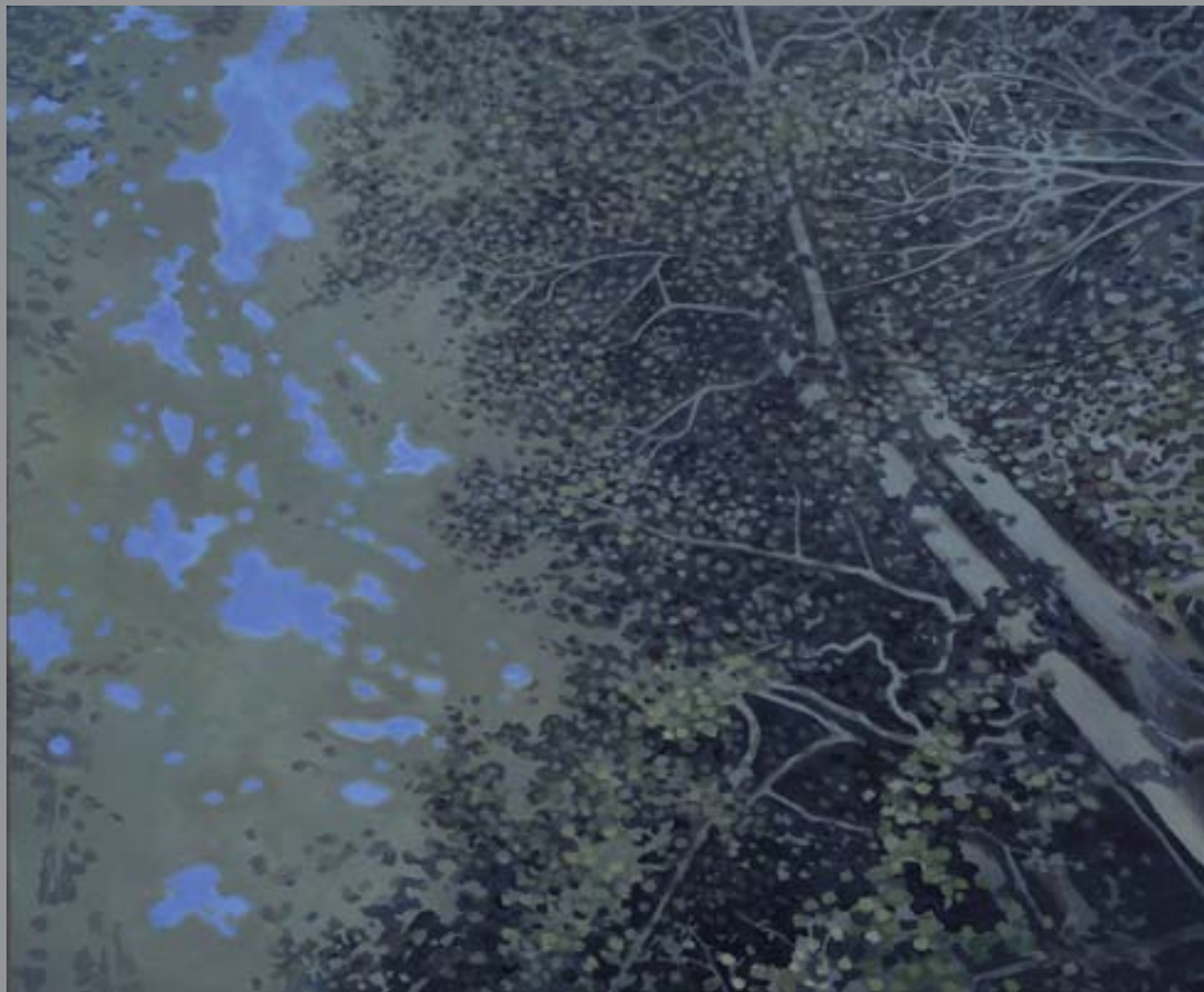
5. Falling oil on canvas 80 x 90 cm