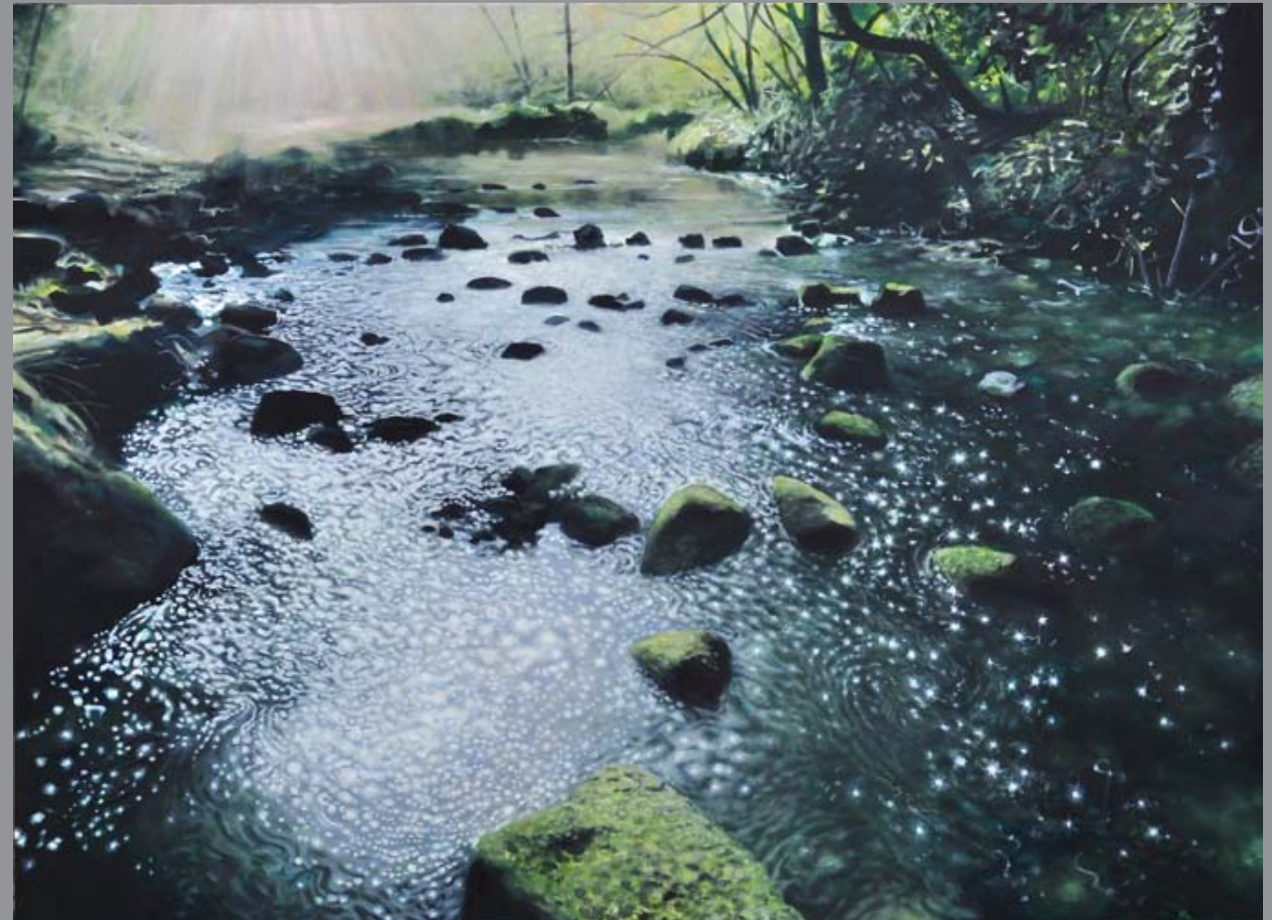
4. Brook oil on canvas 140 x 190 cm