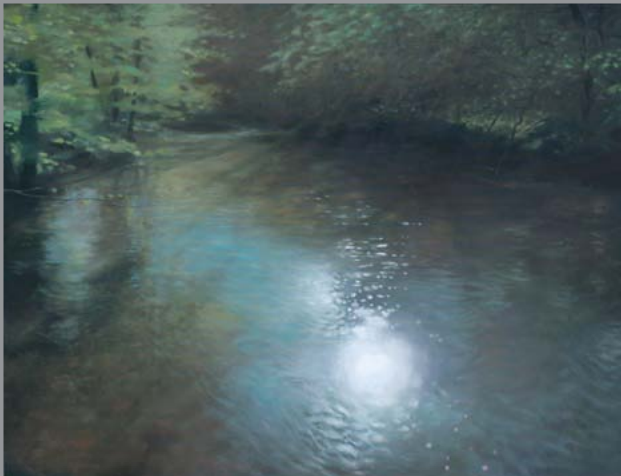
17. Turbid Waters oil on canvas 85 x 110 cm