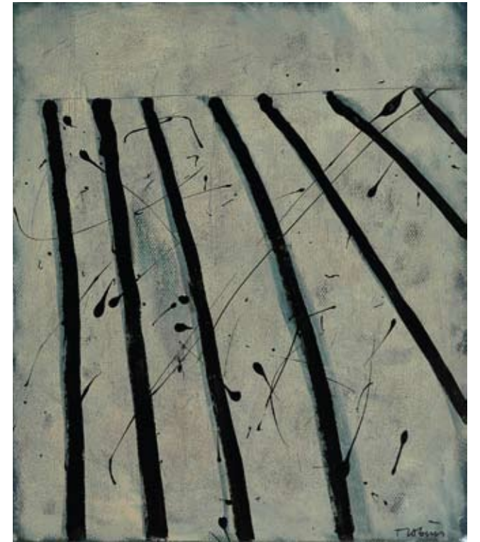
23. Untitled II mixed media on paper 33 x 28 cm