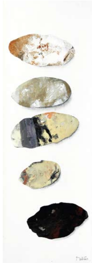
30. Strange Flowers oil on paper 60 x 24 cm