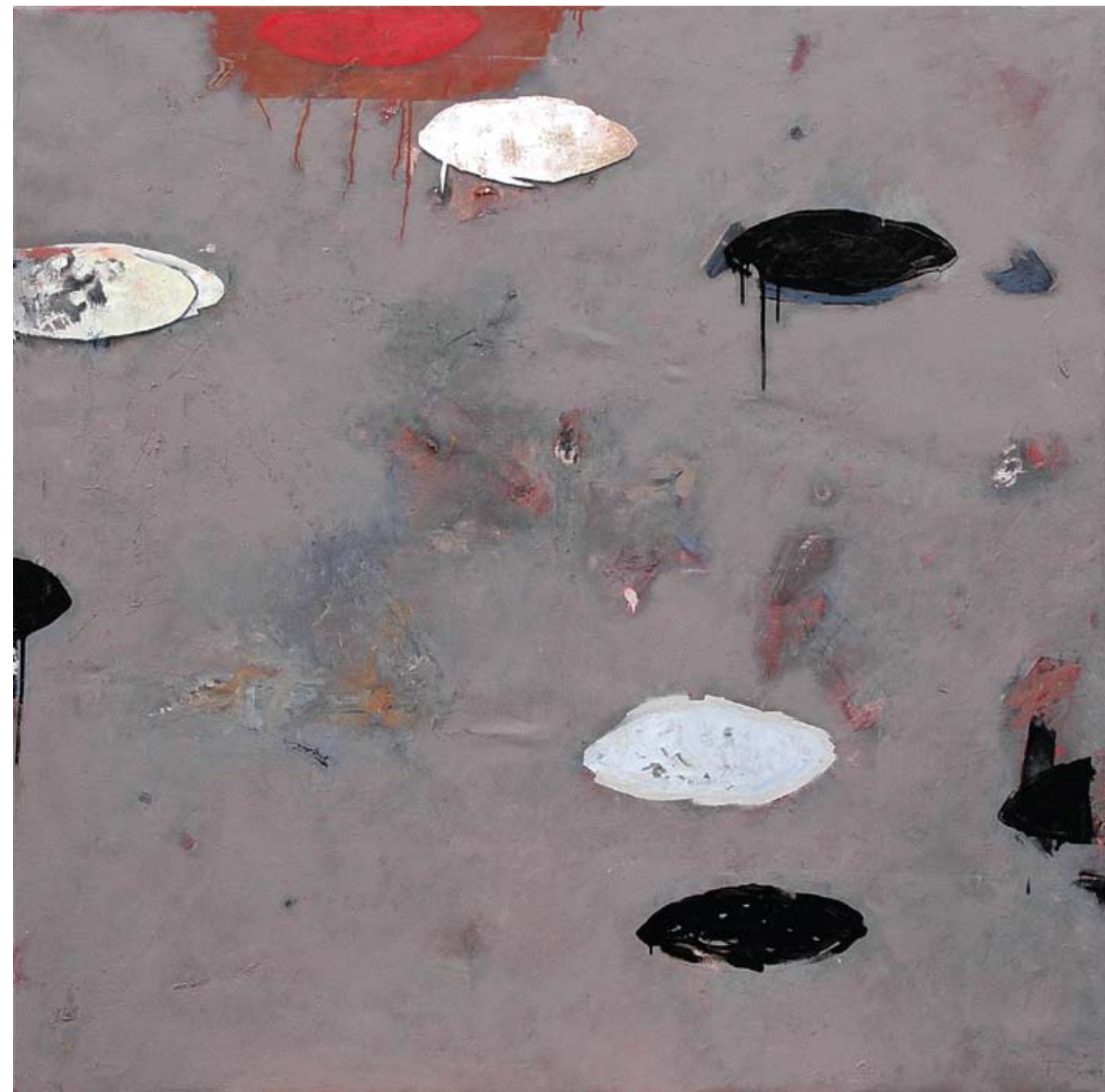
6. Water Lilies III oil on canvas 141 x 141 cm