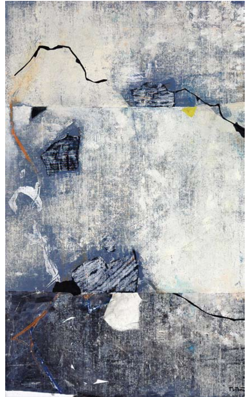
8. Chinese Landscape oil on canvas 112 x 74 cm