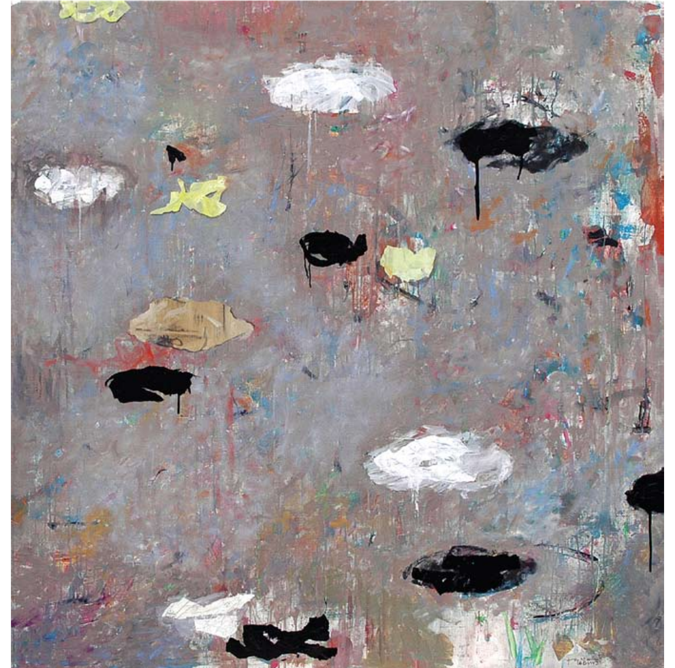
1. Water Lilies I oil, acrylic on canvas 136 x 141 cm

In the 'landscape' series Möbius takes a motif such as a mountain range or a horizon, and transports it to another place that is full of mystery and enigmas. The drama evoked by these works reminds us of nineteenth century Romanticism and the awe-inspiring landscapes of the sublime. One of the most enigmatic pieces in this show is called 'Laboratory Room'. Overtly grey and icy, a few black marks puncture the canvas like 'black holes'. A flux of lines attempts to connect somewhere but fails and falls into an abstract evanescent mass. As the artist said 'I hunt myself in the laboratory painting'. In constant circulation of thoughts and ideas, Möbius' work is imbued with secrets, ephemeral possibilities and combinations.