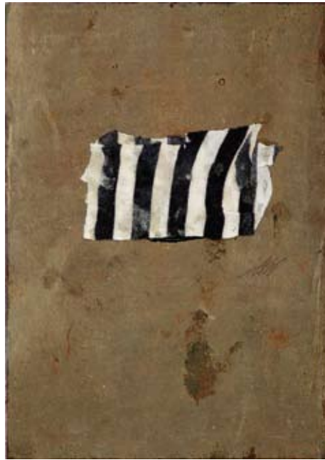
22. Striped Object mixed media on paper 29 x 20 cm