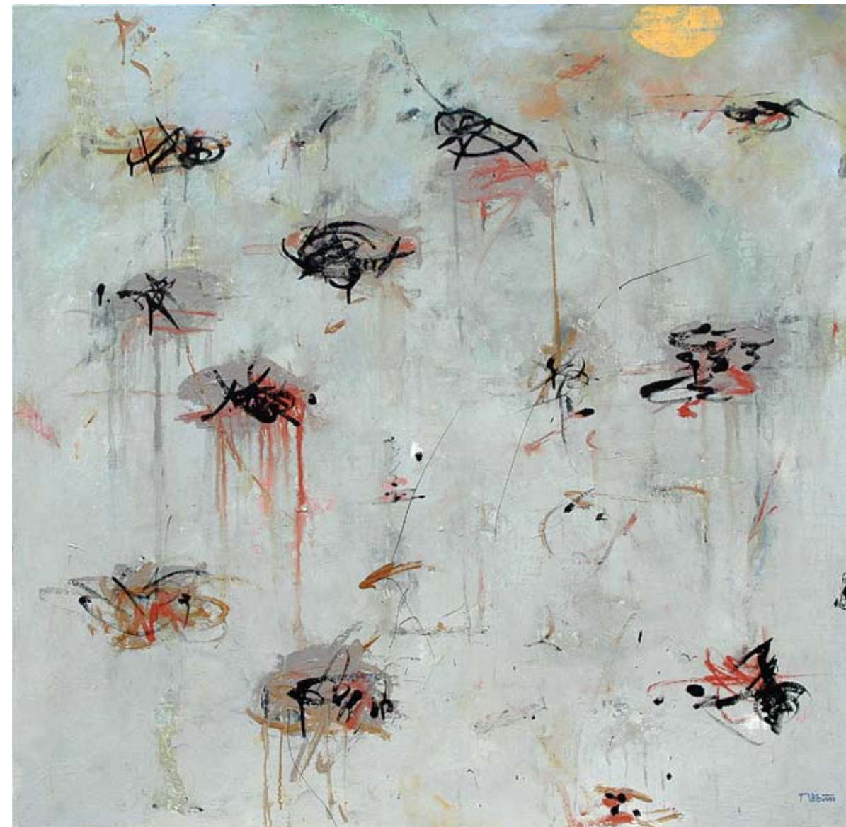
15. Water Lilies VI oil on canvas 116 x 119 cm