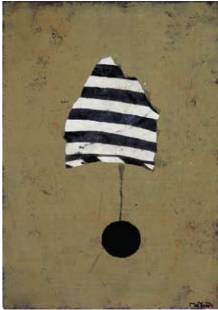
24. Difficult Take-off oil on paper 29 x 20 cm