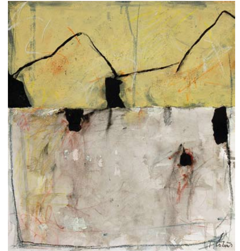
19. Sierra mixed media on paper 42 x 40 cm