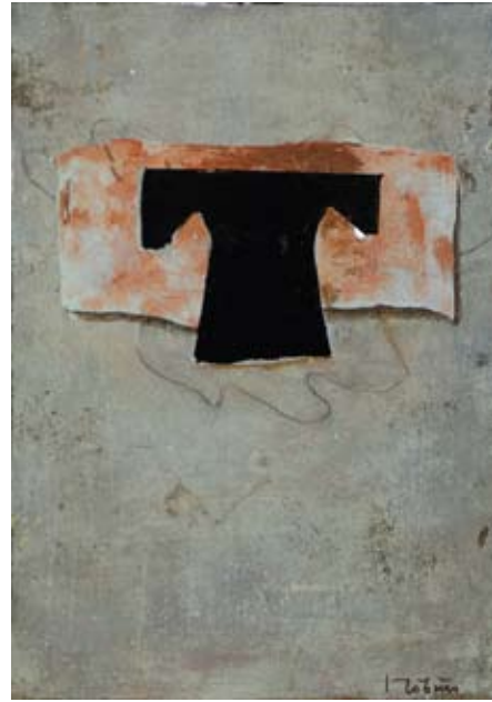
25. TAG mixed media on paper 29 x 20 cm