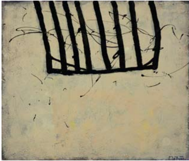
9. Bewitched Forest I mixed media on paper 29 x 34 cm