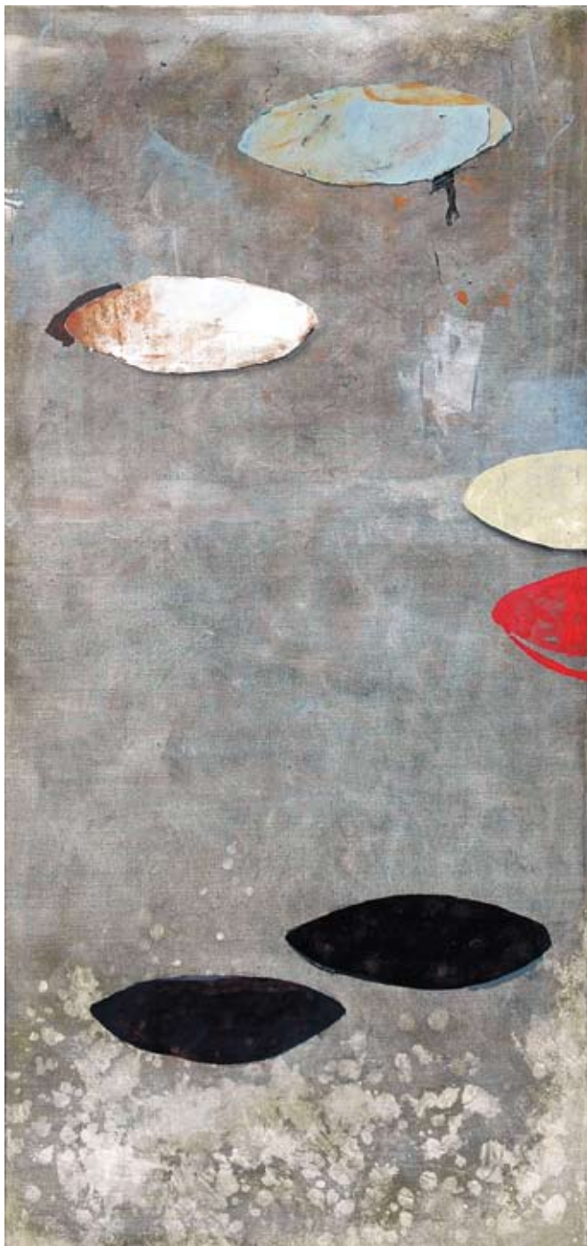
5. Water Lilies II oil on canvas 143 x 67 cm