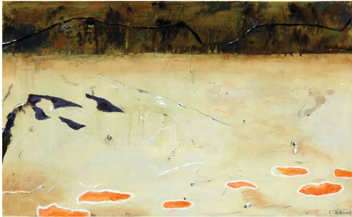
3. Footsteps in the Sand oil on paper 29 x 47 cm