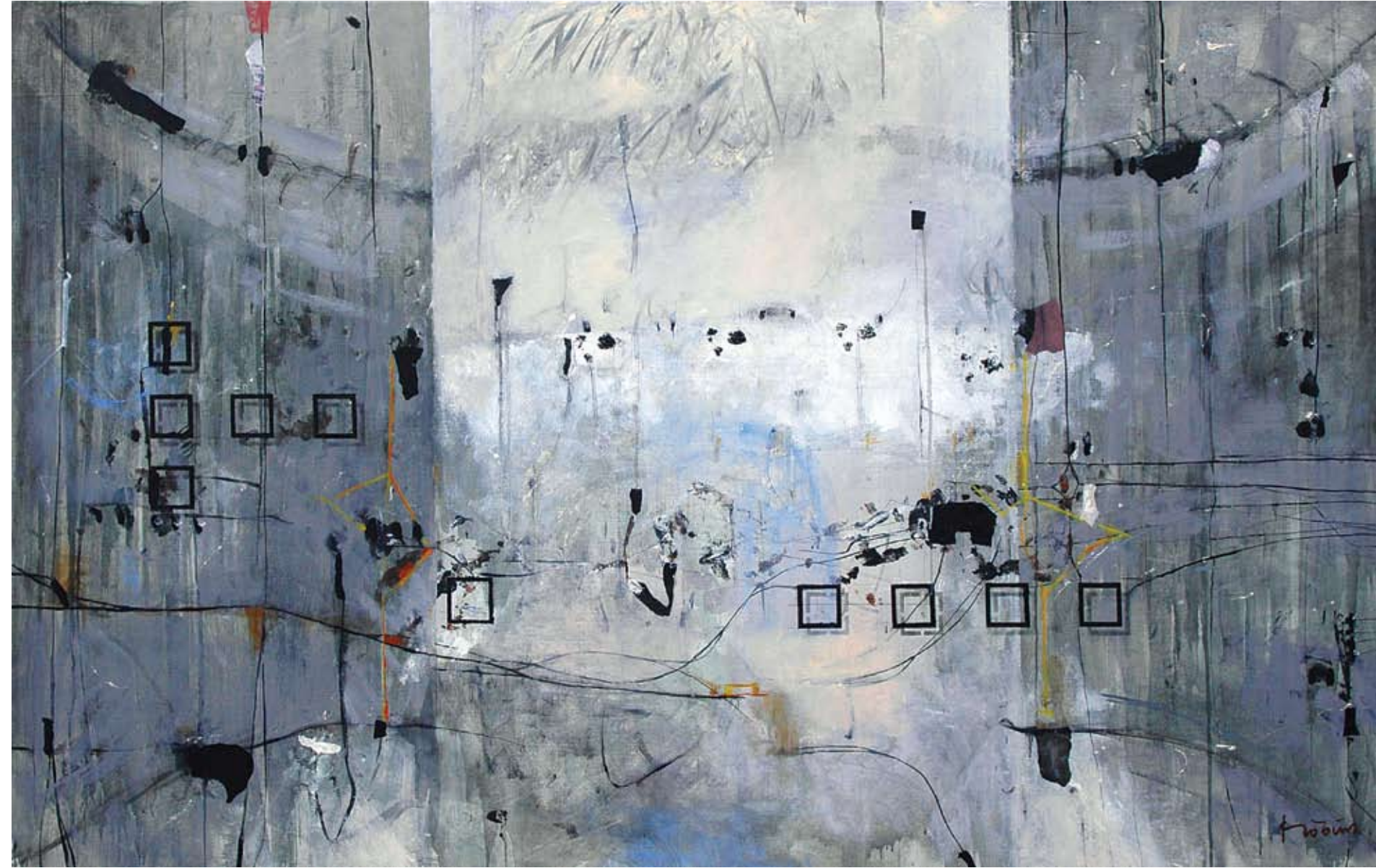
2. Laboratory Rooms oil on canvas 127 x 204 cm