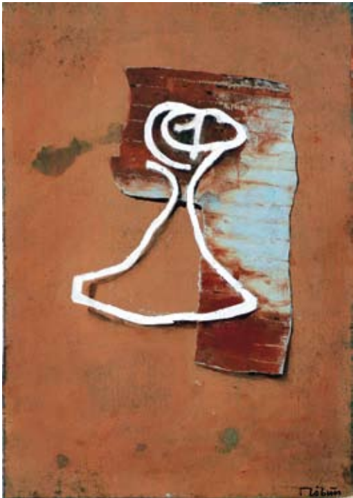
32. Street Girl oil on paper 29 x 20 cm