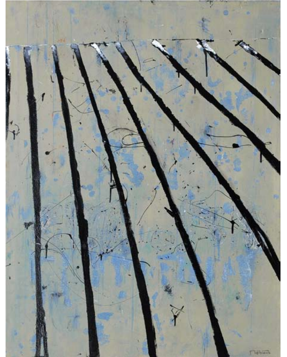
11. Untitled I mixed media on canvas 105 x 80 cm