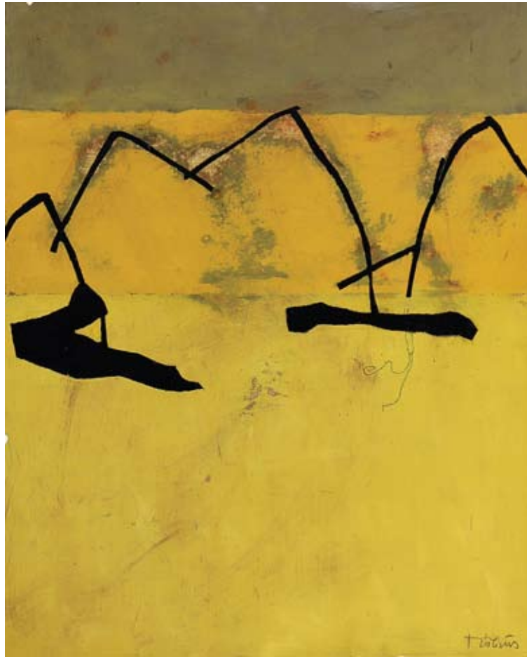
7. Sierra mixed media on paper 50 x 40 cm