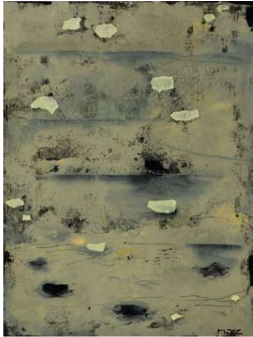
29. Water Lilies IX mixed media on paper 40 x 30 cm