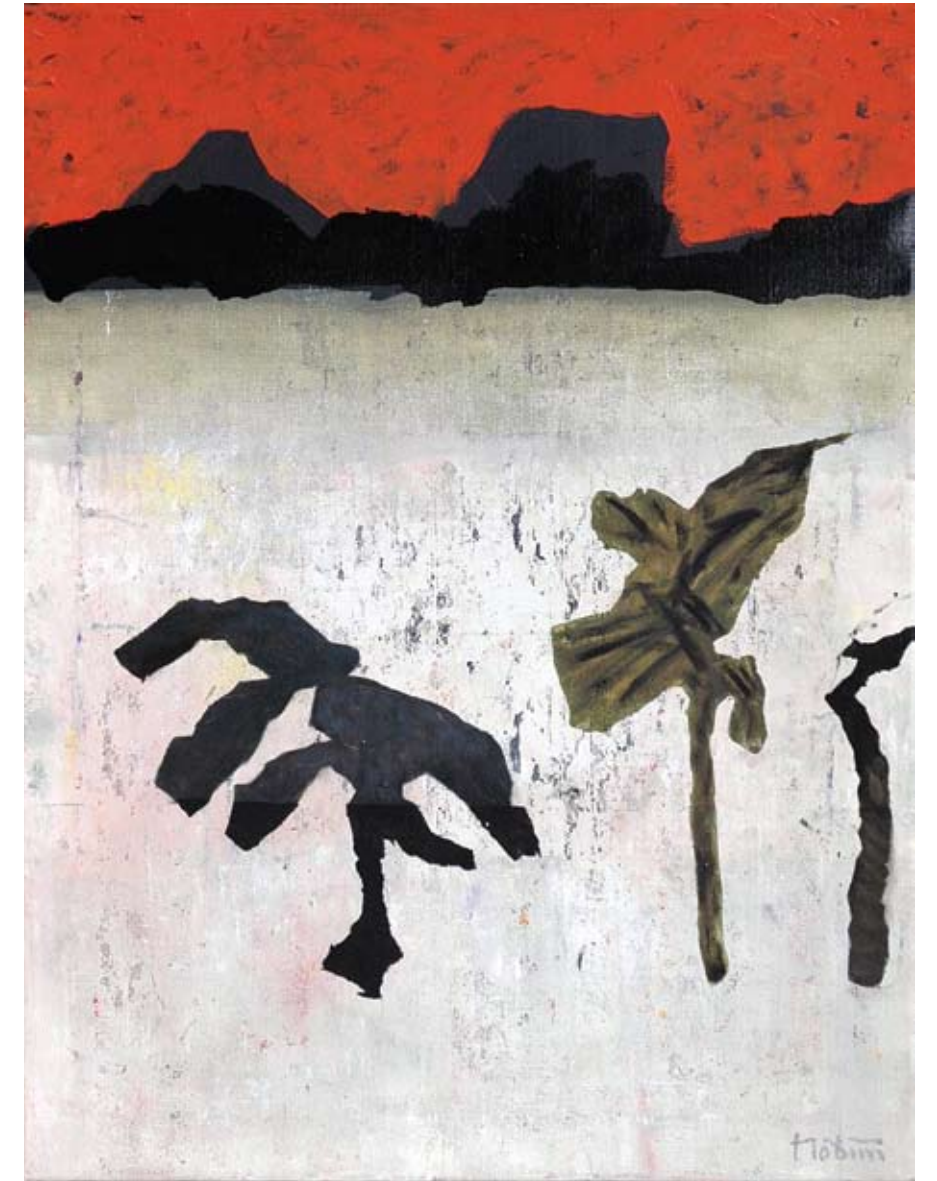
17. Palms and Table Mountain oil on canvas 77 x 60 cm