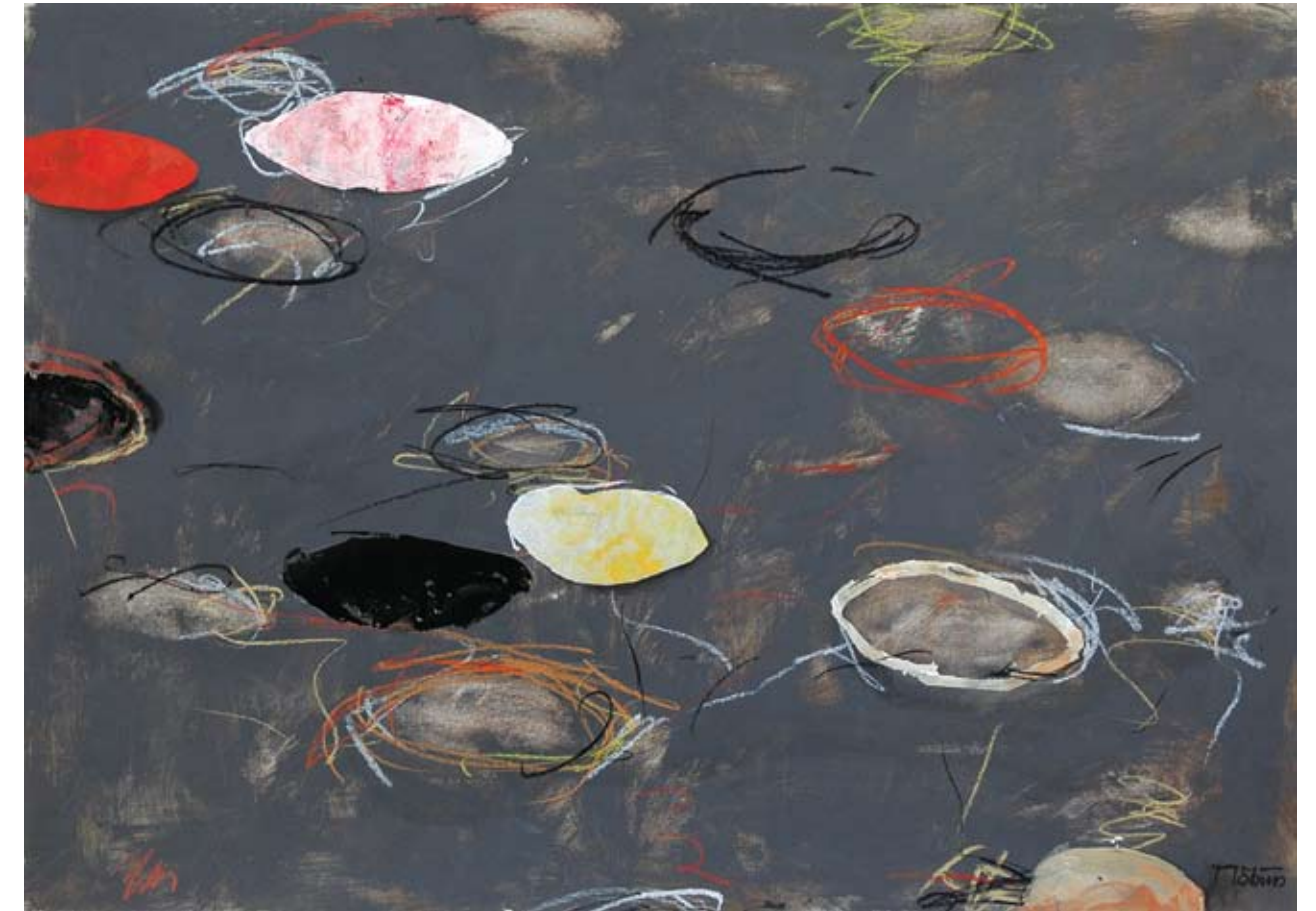
27. Water Lilies VII mixed media on paper 49 x 64 cm