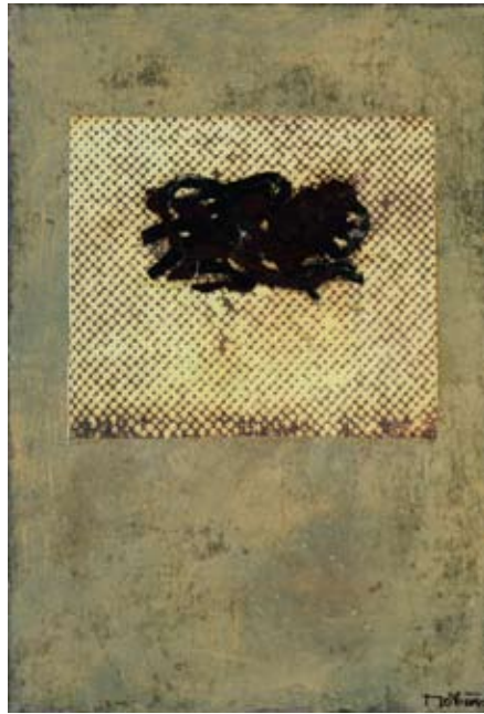
21. Black Cluster mixed media on paper 29 x 20 cm