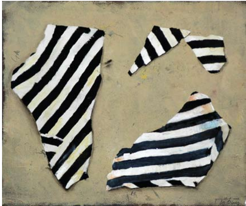
18. Three Striped Objects oil on paper 29 x 34 cm