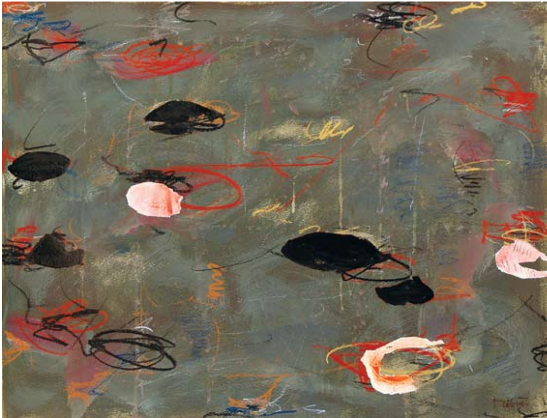
12. Water Lilies IV mixed media on paper 49 x 64 cm