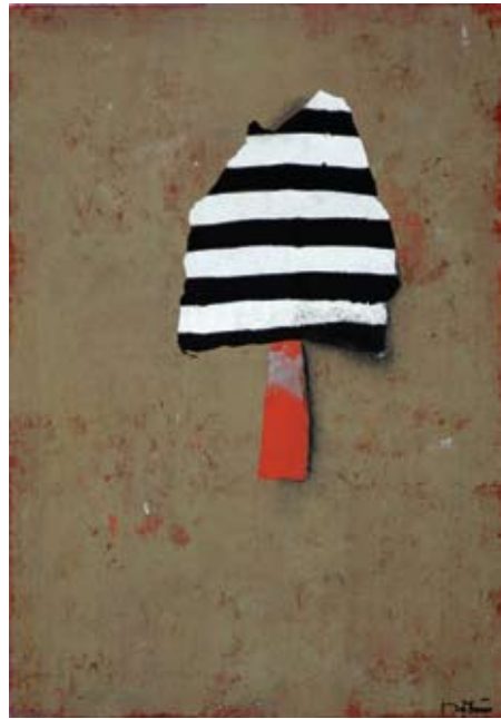
20. Happy Take-off mixed media on paper 29 x 20 cm