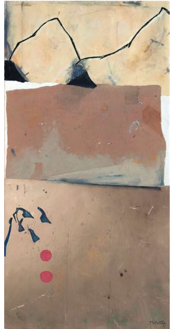
4. Two Red Marks in the Sierra oil on canvas 102 x 52 cm