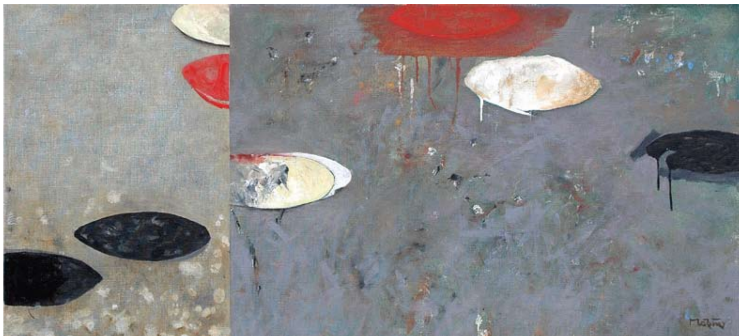
14. Water Lilies V oil on canvas 60 x 132 cm