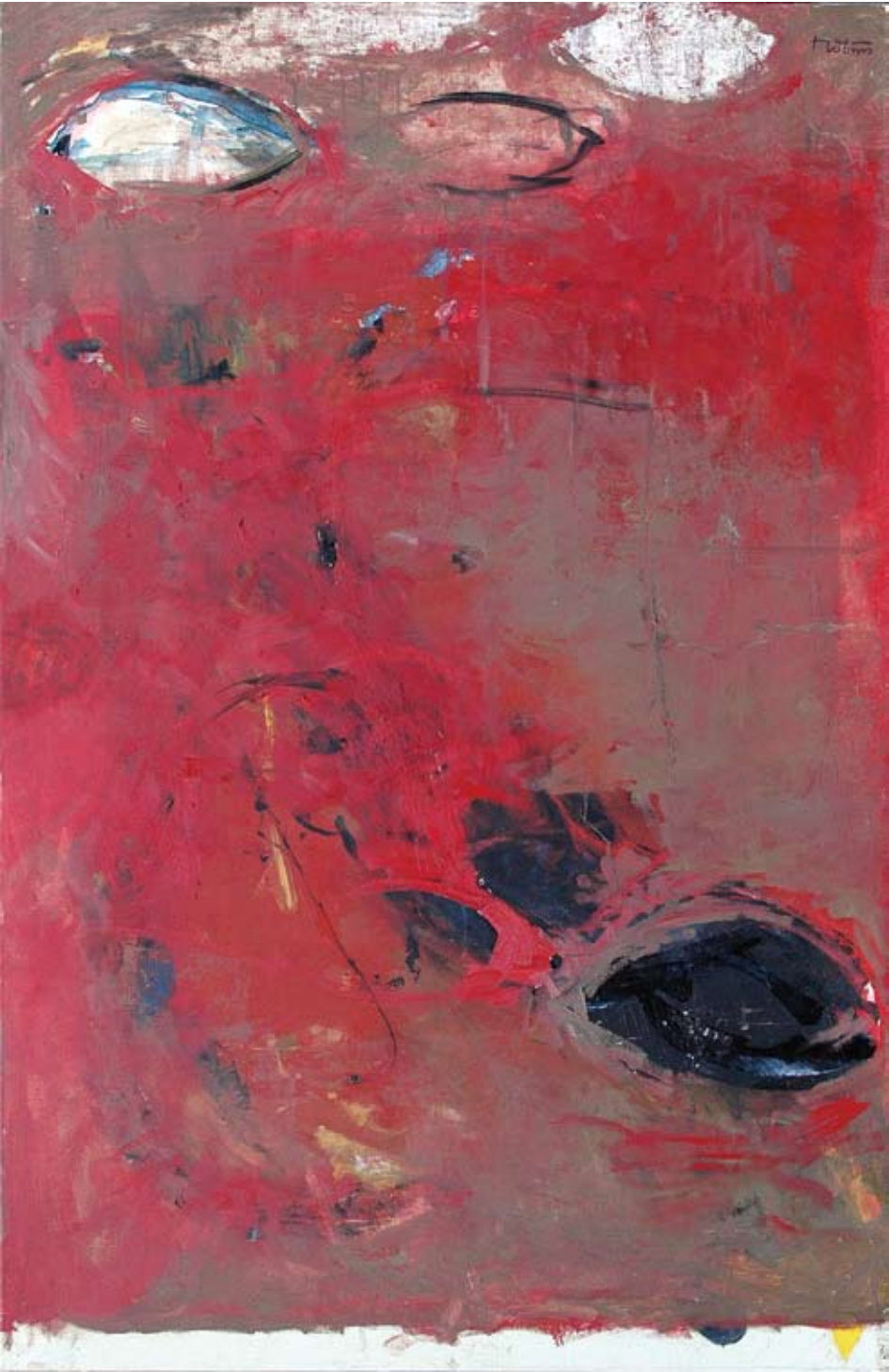
13. Sun-down Water Lilies oil on canvas 166 x 105 cm