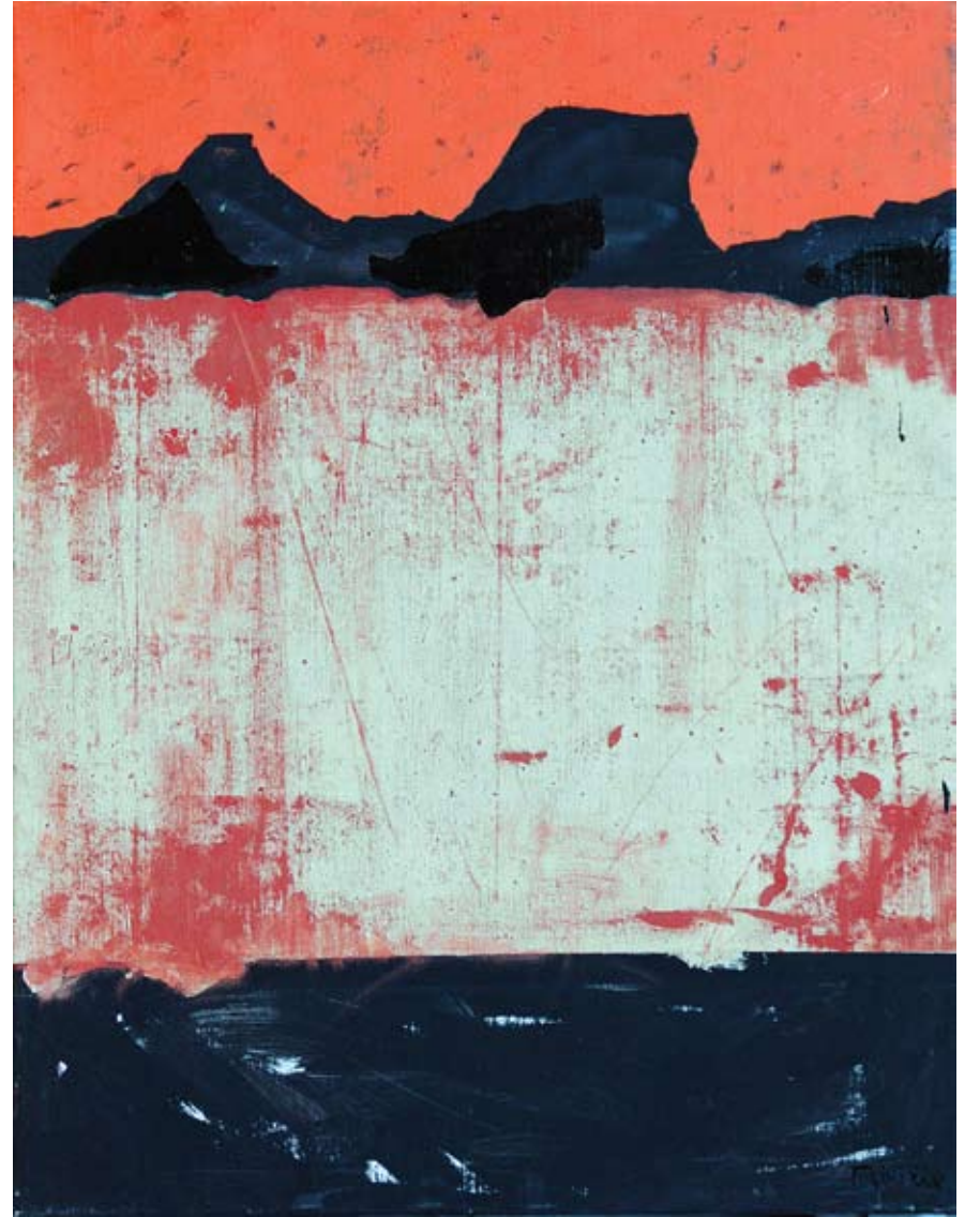
31. Landscape mixed media on paper 77 x 60 cm