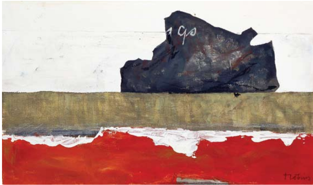
16. The Rock mixed media on paper 23 x 40 cm