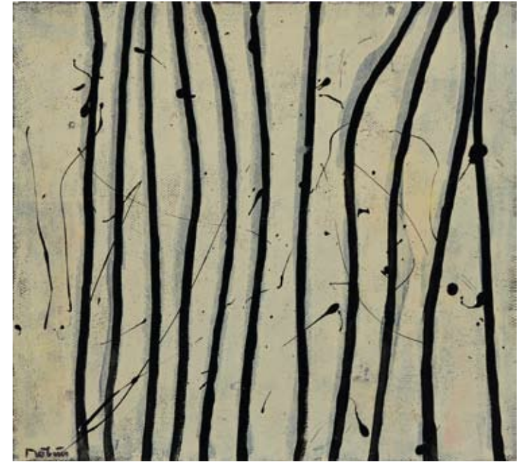
26. Bewitched Forest III mixed media on paper 29 x 34 cm