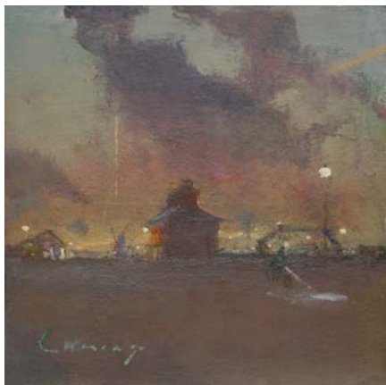
6. The Granary, Rye | oil on panel | 8 x 8 ins