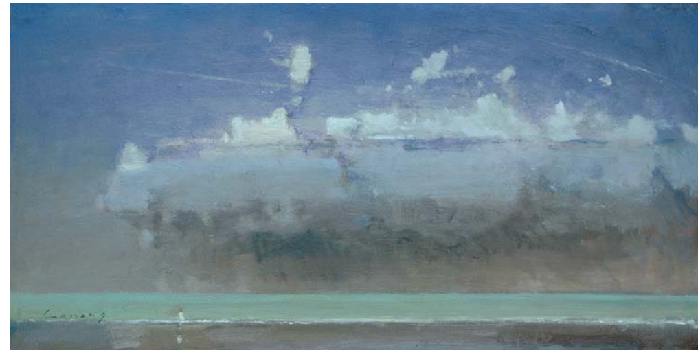
18. Squall | oil on panel | 12 x 24 ins