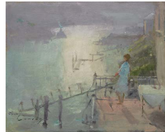
21. Fowey, Midday | oil on panel | 8 x 10 ins