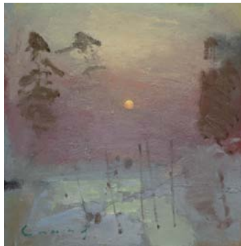
12. Winter Garden | oil on panel | 6 x 8 ins