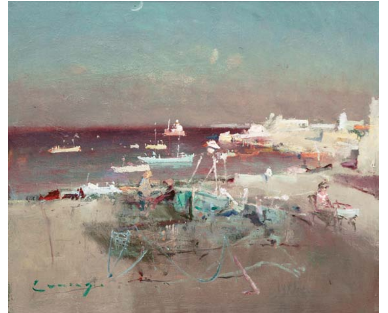
4. Shirley Valentine, Greek Island | oil on panel | 12 x14 ins