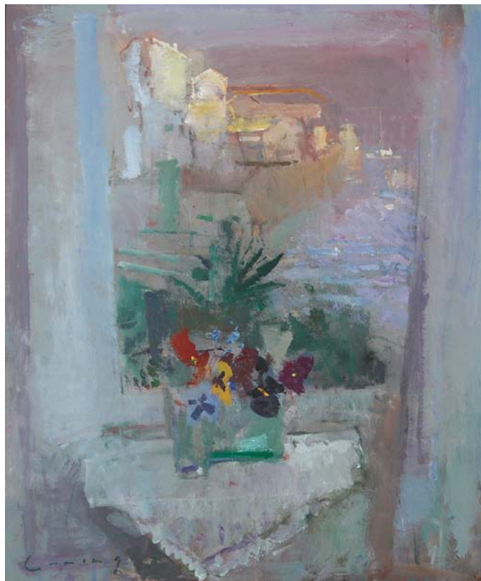
14. Flowerpiece and Window | oil on panel | 24 x 20 ins