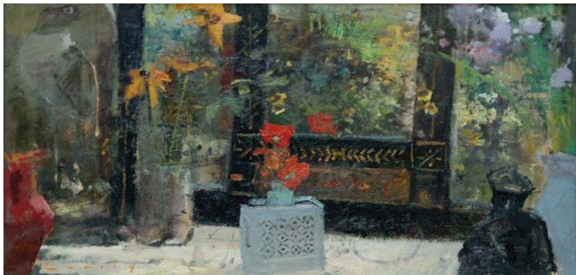
16. Autumn Still-life | oil on panel | 12 x 24 ins