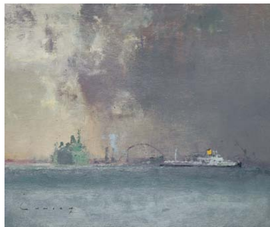
33. Liner and Car Ferry, Venice | oil on panel | 10 x 12 ins