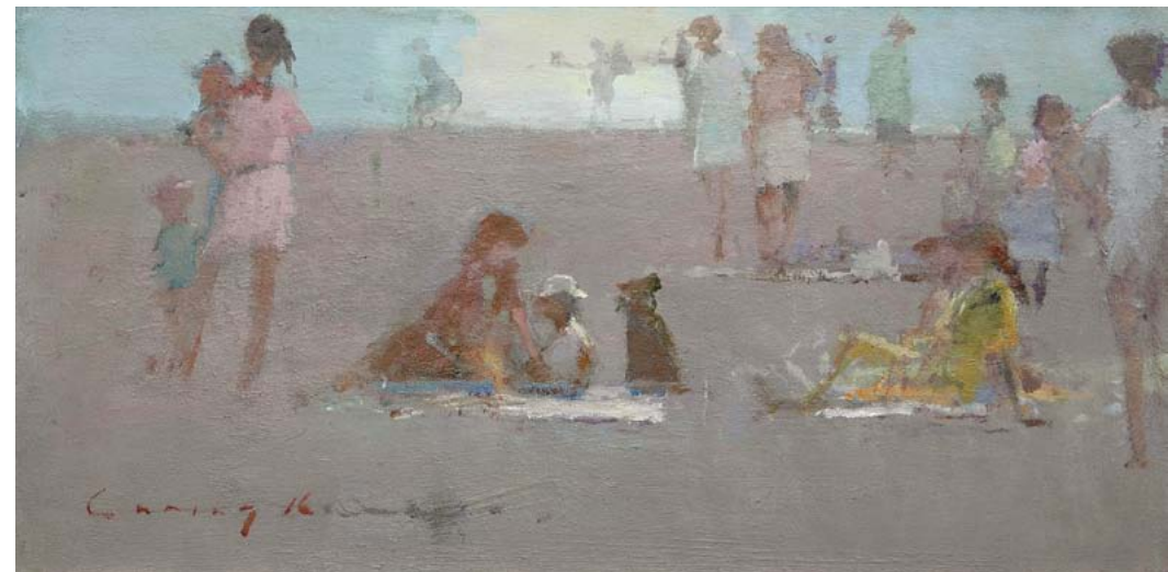
7. Figures on the Beach, Arcachon | oil on panel | 10 x 20 ins