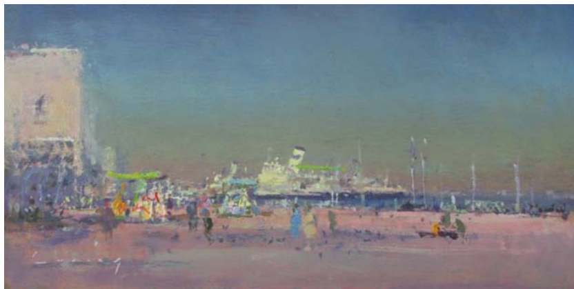
26. Piazza San Marco, Venice | oil on panel | 8 x 16 ins