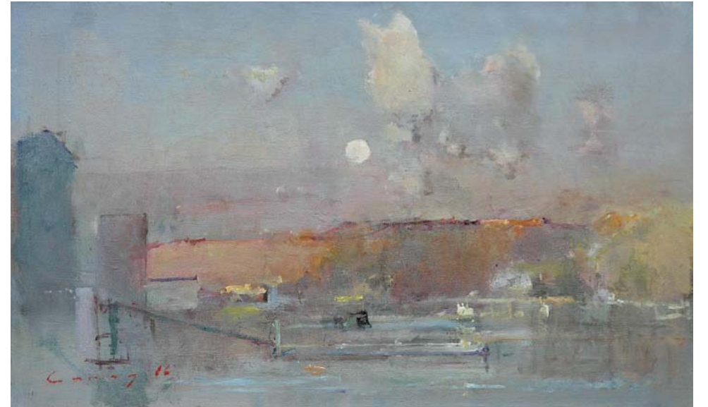
13. Bodinnick Ferry, Moonrise | oil on panel | 12 x 20 ins