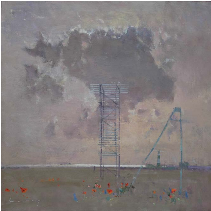
19. Poppies, the Angel of the South | oil on canvas | 30 x 30 ins