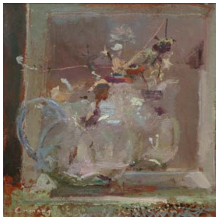
17. Dried Flowers in Mirror | oil on panel | 12 x 12 ins