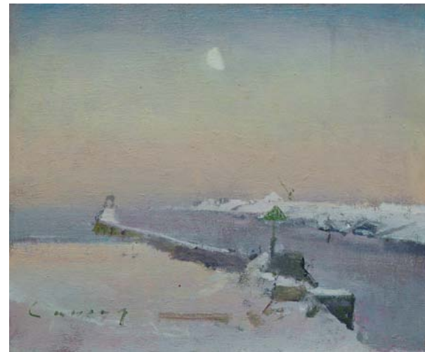
20. Rye Harbour under Snow | oil on panel | 10 x 12 ins