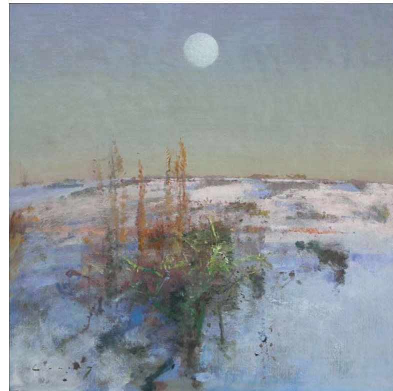
15. Winter Landscape | oil on panel | 24 x 24 ins