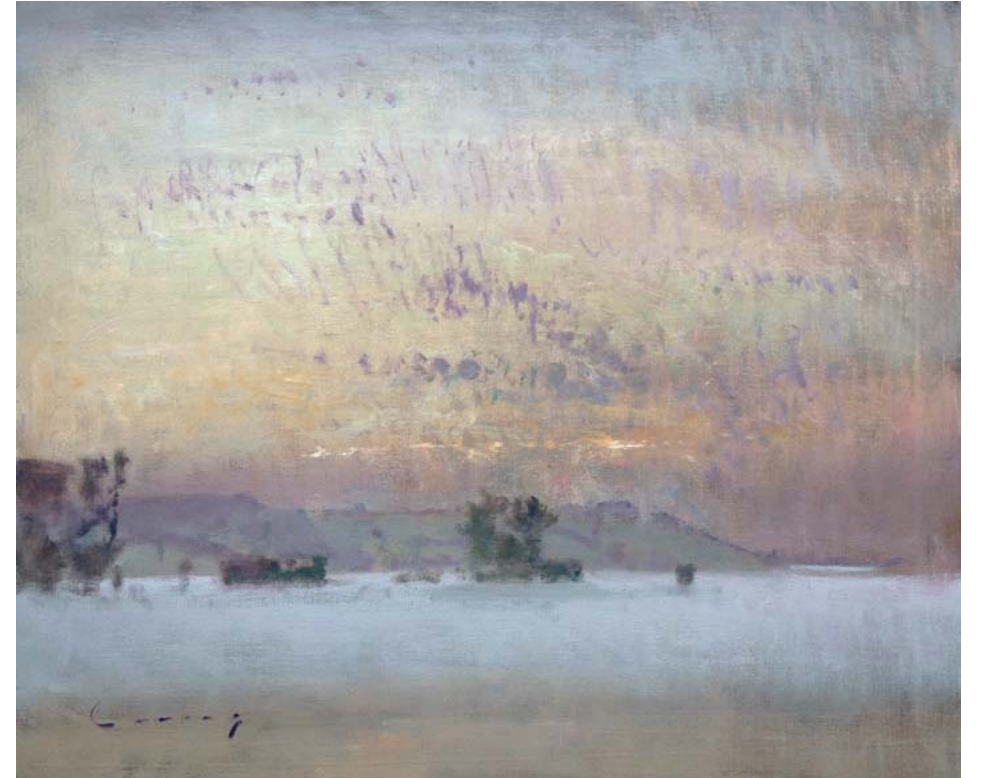
24. Will O' the Wisp | oil on canvas | 20 x 24 ins