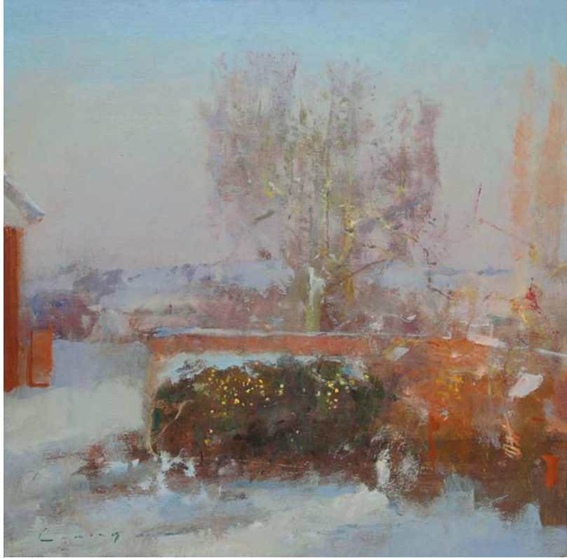
3. Winter Flowering Jasmine and Prunus | oil on canvas | 24 x 24 ins