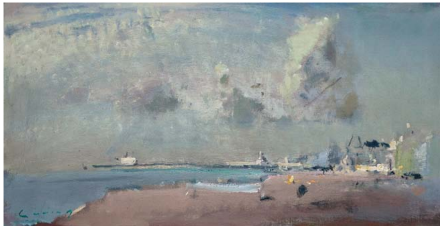
5. Hastings Pier | oil on panel | 12 x 24 ins