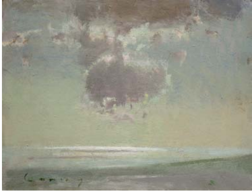
22. Cloud Study, Camber | oil on panel | 7 1/2 x 9 3/4 ins