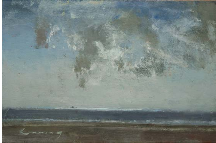
11. Clouds and Coastline | oil on panel | 8 x 12 ins