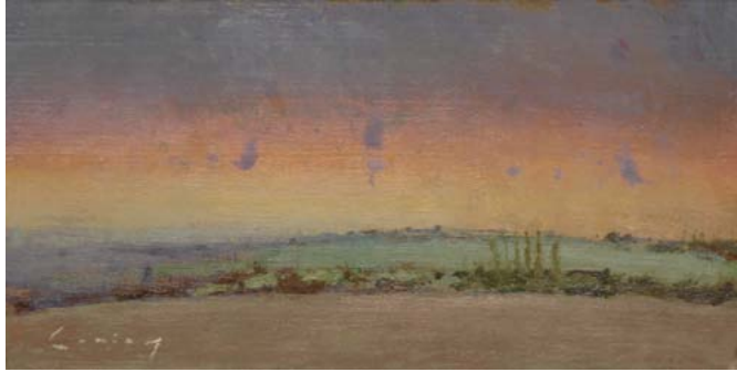
8. Colour Study, Evening | oil on panel | 6 x 12 ins