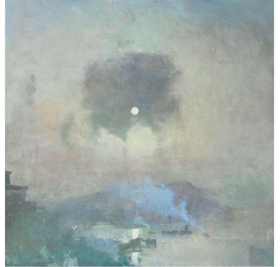
10. Fowey Harbour | oil on panel | 24 x 24 ins