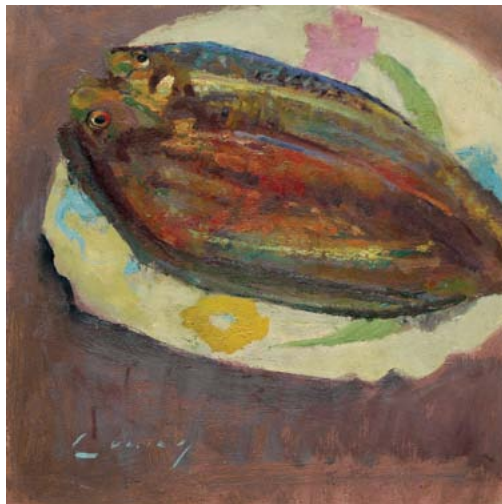
28. Kipper and Mackerel | oil on panel | 12 x 12 ins