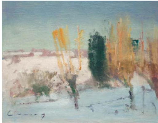
9. Snow | oil on panel | 8 x 10 ins