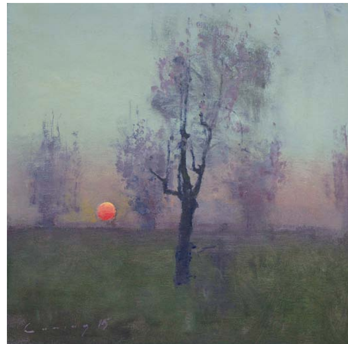
27. Winter Sun | oil on panel | 16 x 16 ins