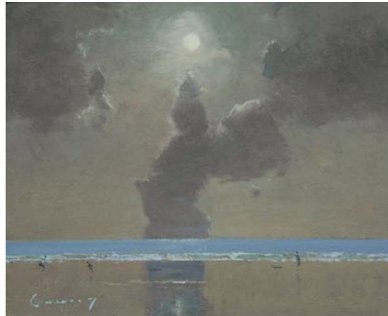
23. October Beach, Camber | oil on panel | 10 x 12 ins