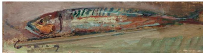
29. Mackerel | oil on panel | 2 x 2 ins