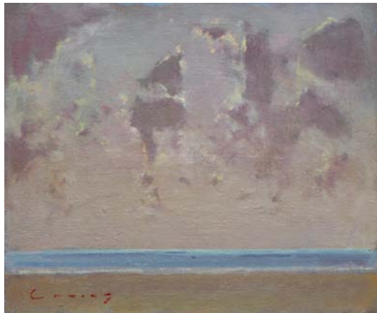
25. Clouds, Camber | oil on panel | 10 x 12 ins