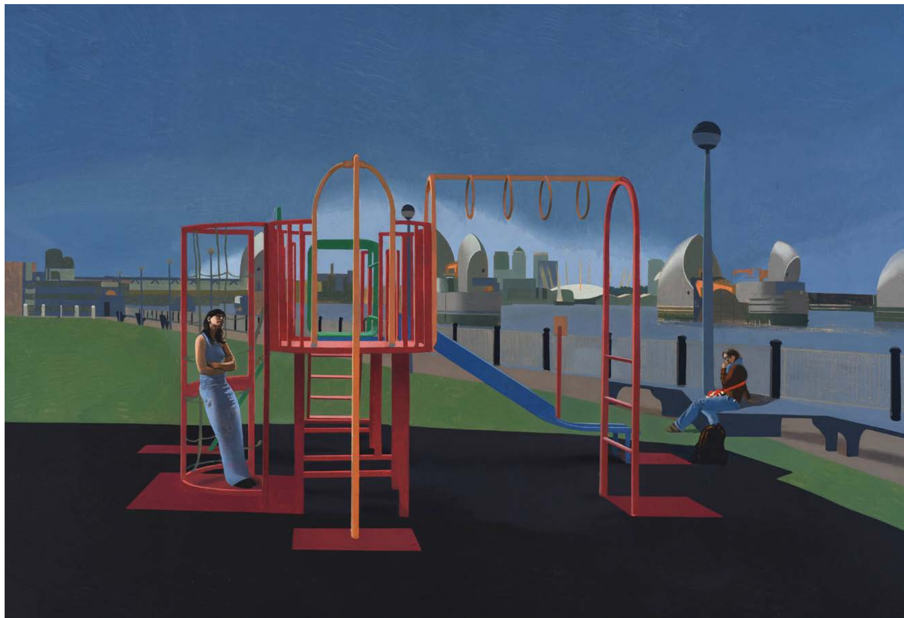
7. Barrier Playground | 83 x 122 cm