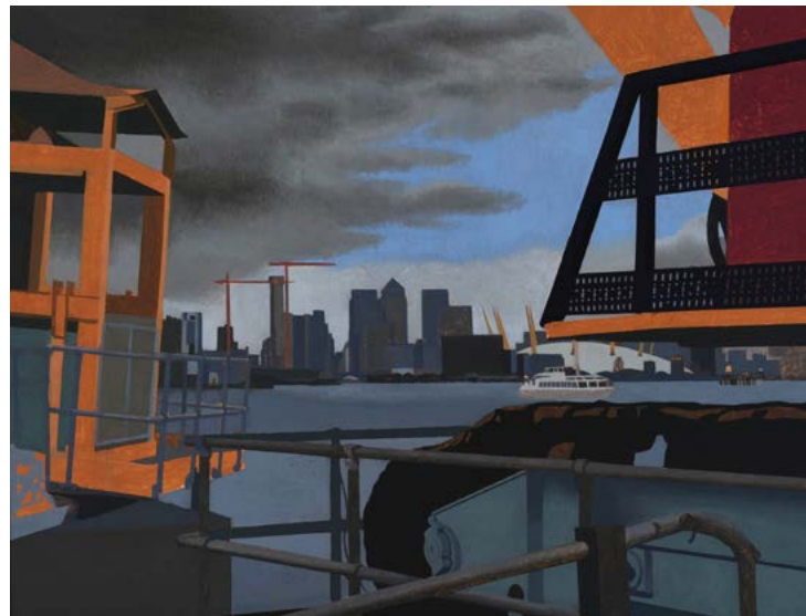
5. Wharfside | 45 x 59 cm