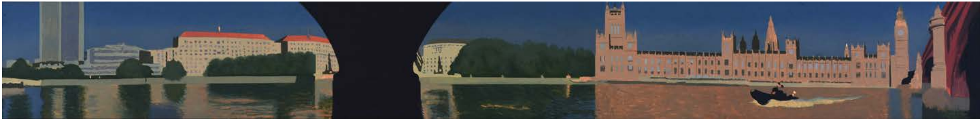
15. Westminster | 14 x 122 cm