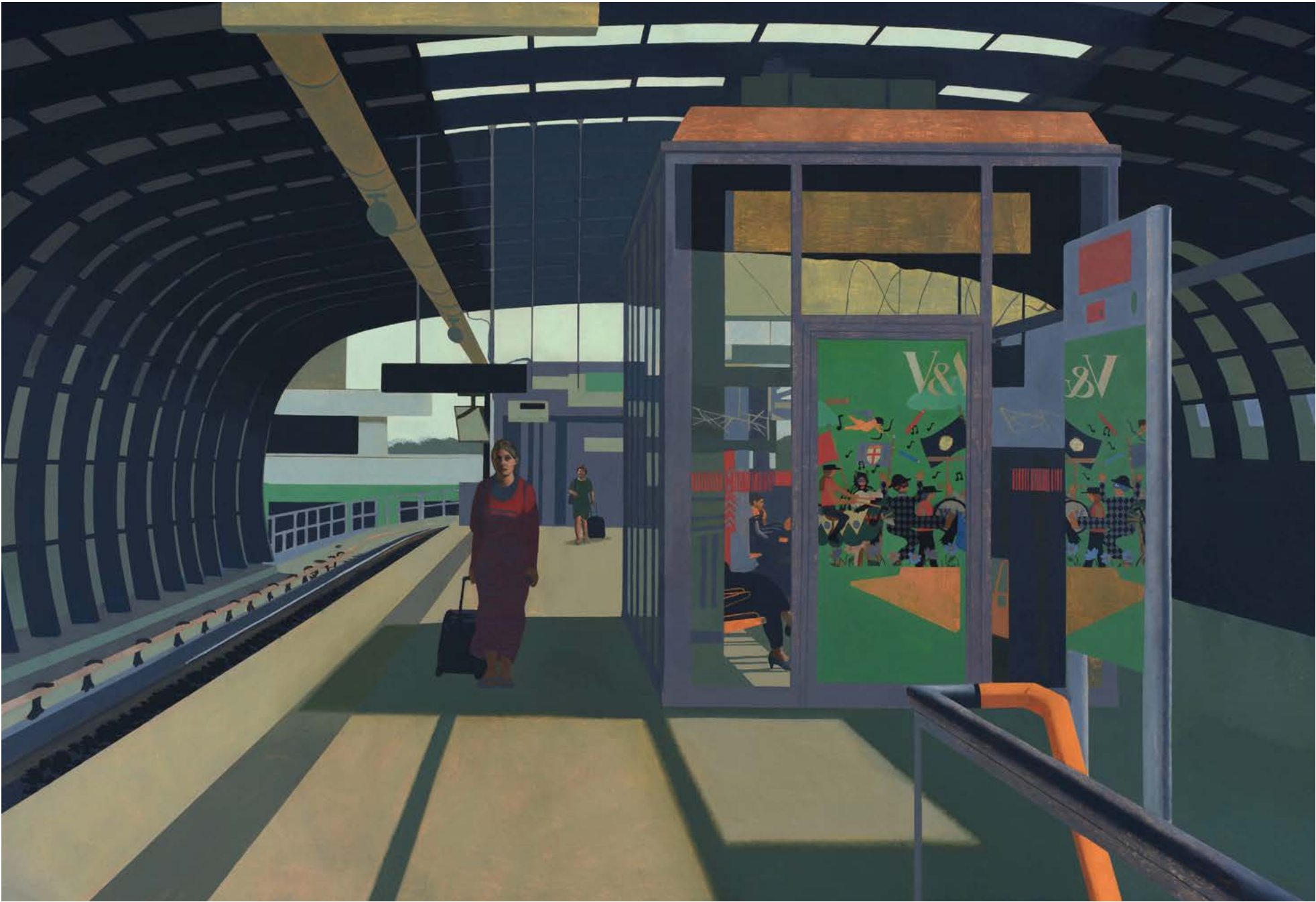
6. Platform II | 99 x 146 cm