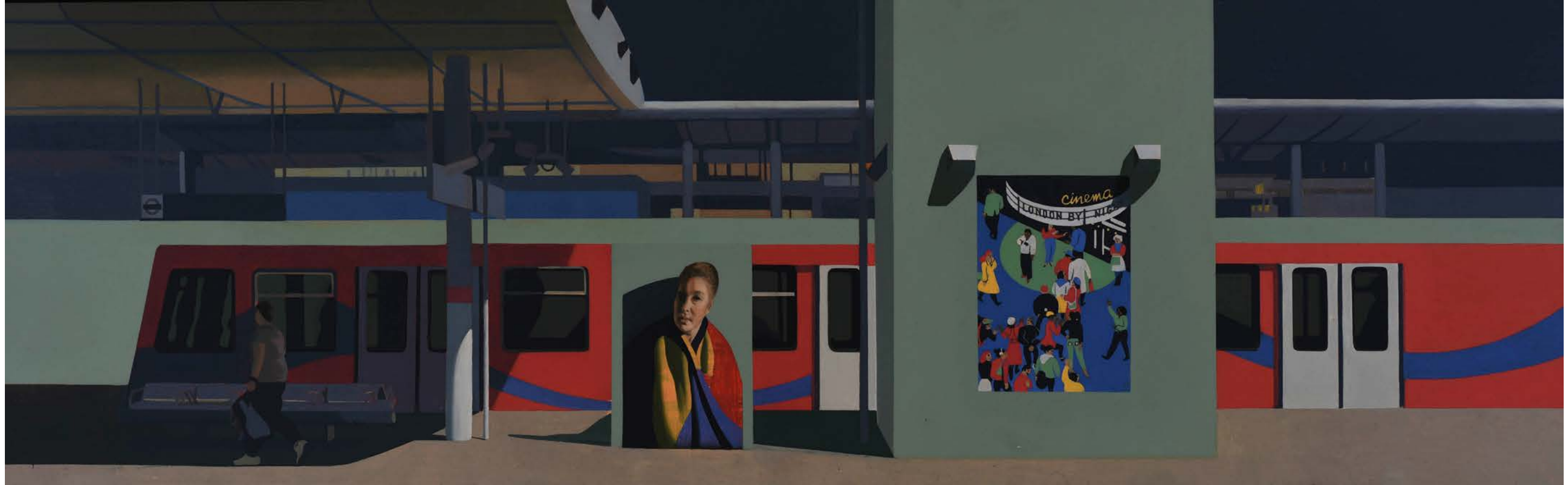
17. Platform IV | 37 x 121 cm