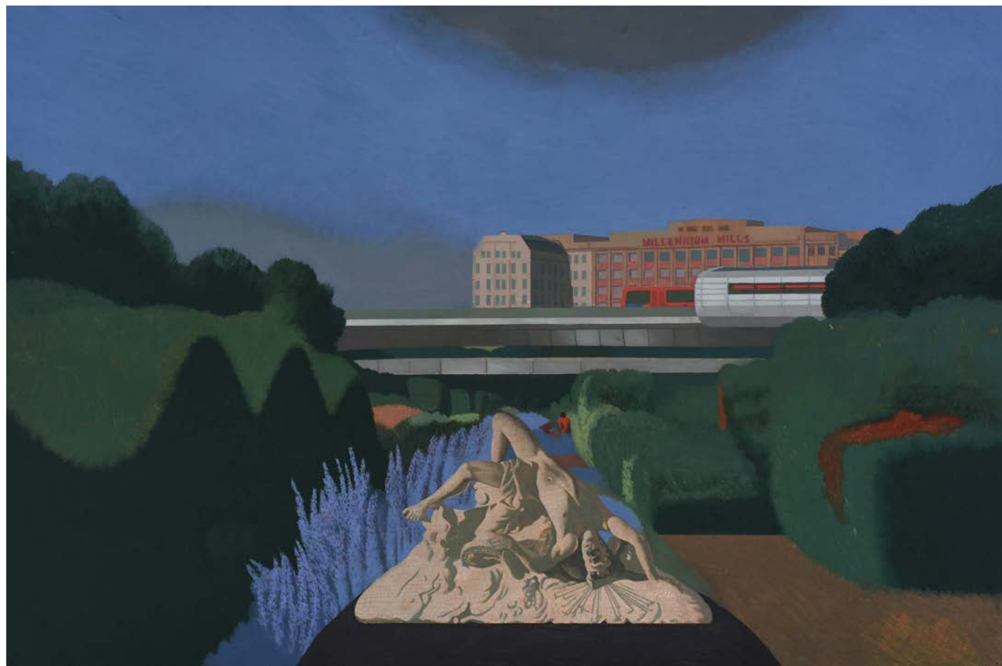
9. Barrier Park - Fall of Phaeton | 60 x 91 cm