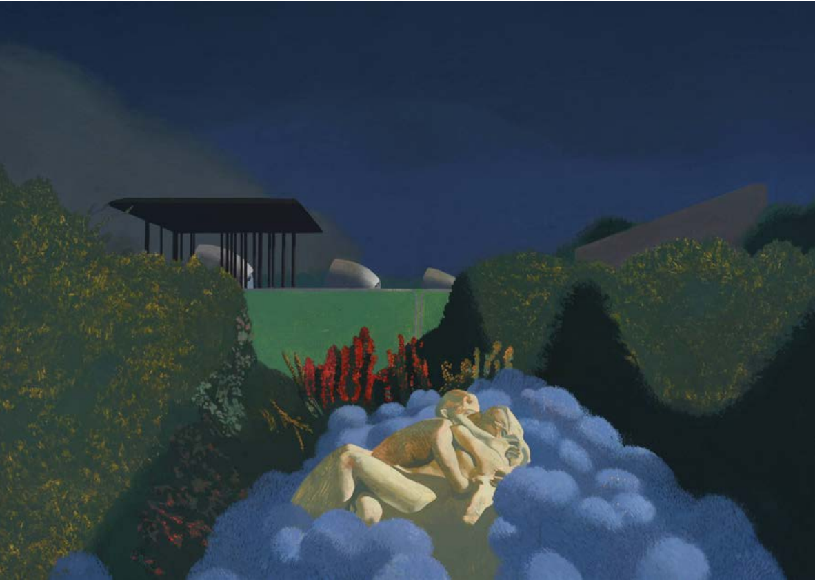
2. Barrier Park - Metamorphosis | 59 x 87 cm