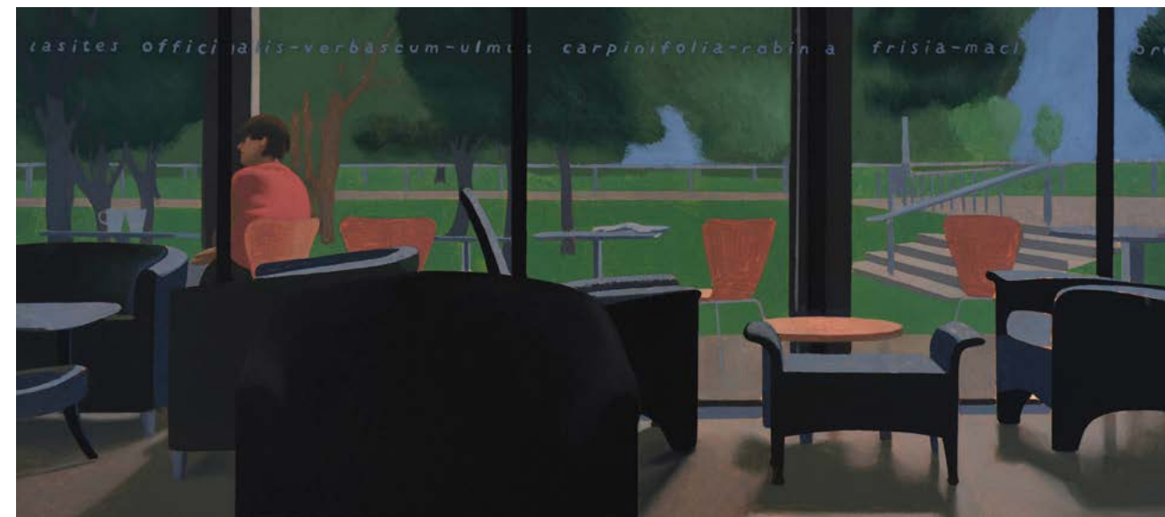
8. Barrier Park - Cafe | 26 x 59 cm