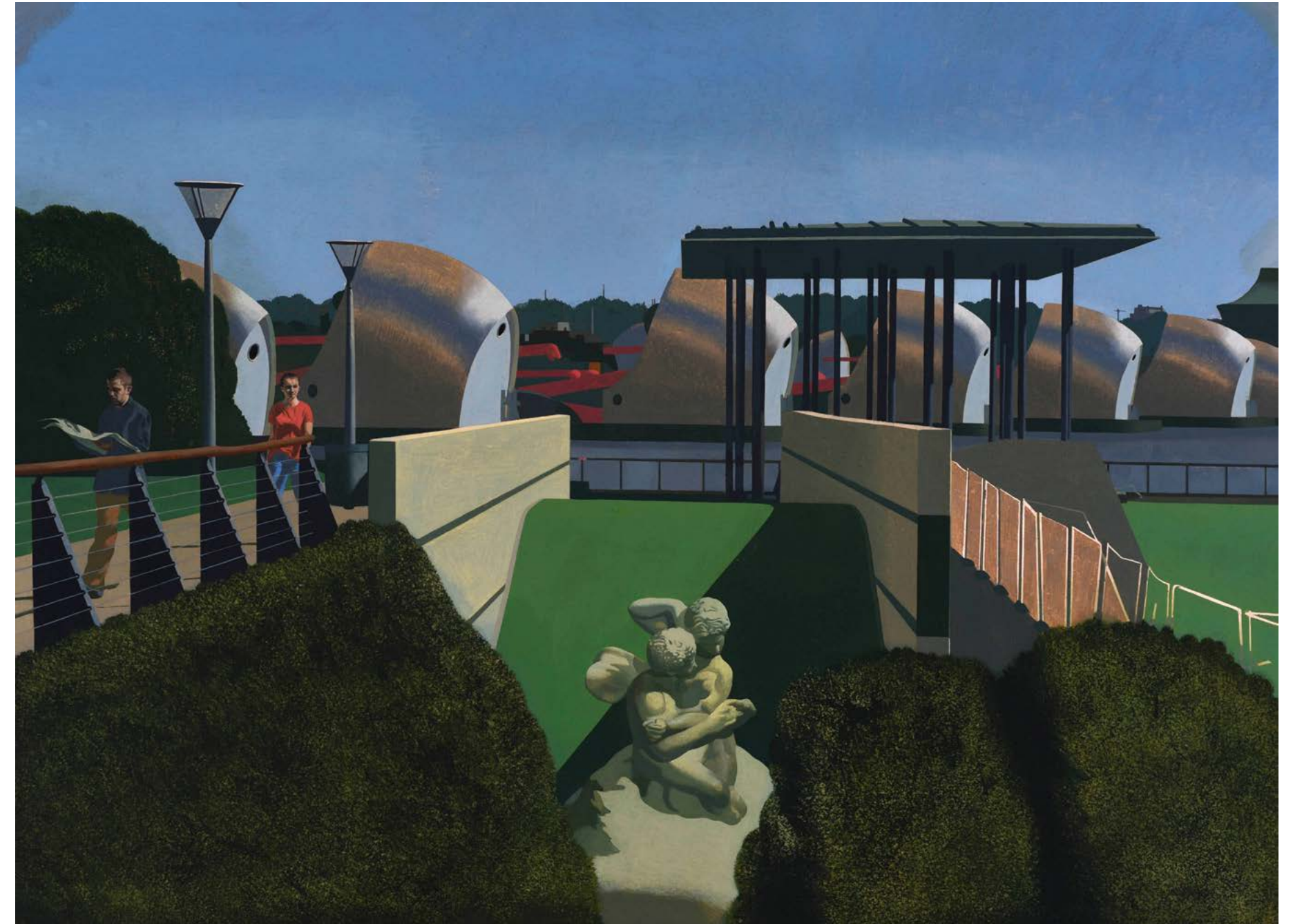
3. Barrier Park - Cupid & Psyche | 89 x 121 cm