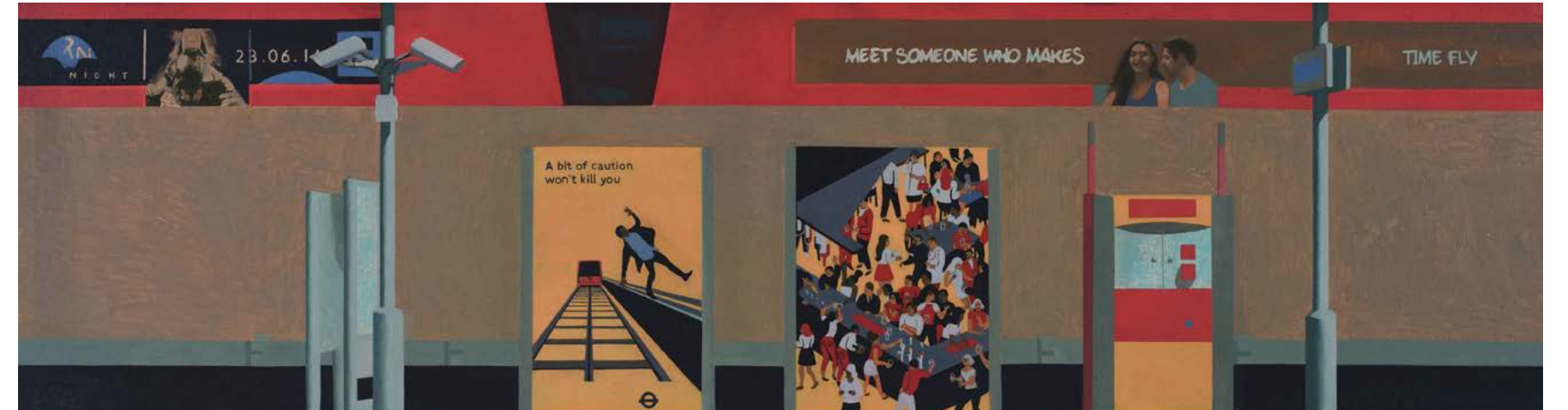
16. Platform III | 37 x 120 cm