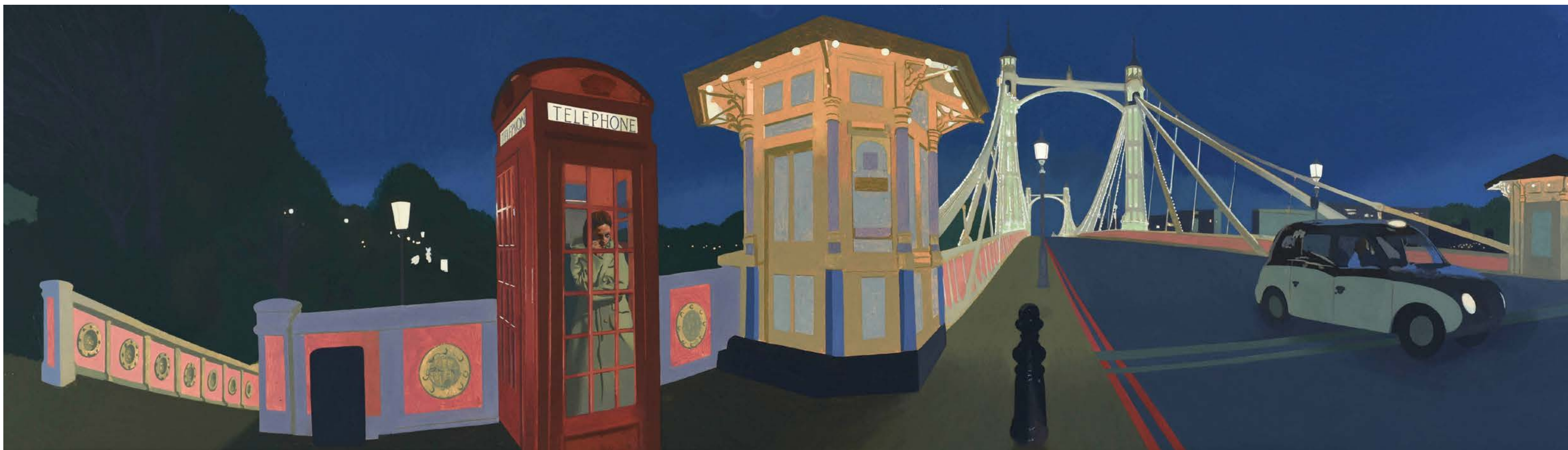
12. Albert Bridge | 42 x 146 cm