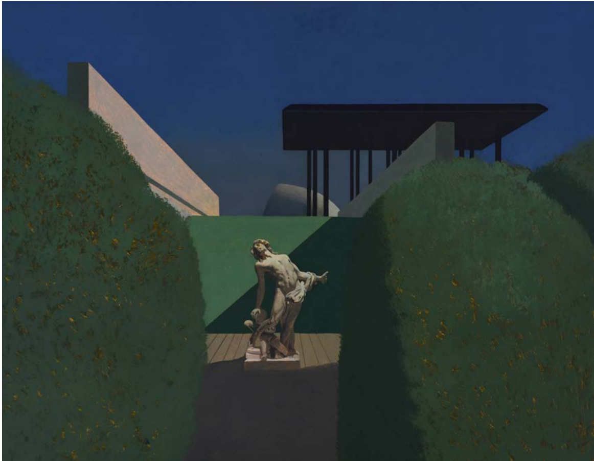
19. Barrier Park - Death of Achilles | 58 x 75 cm