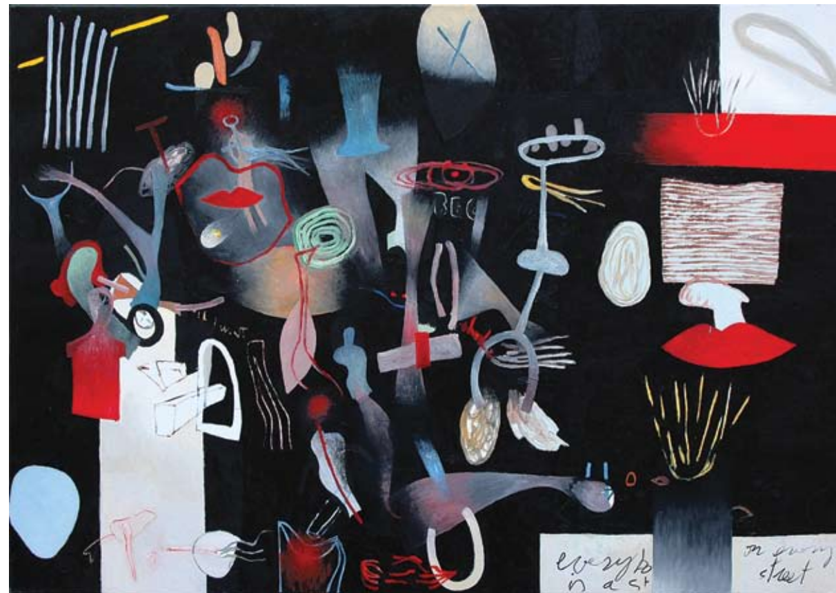
Everybody on this Street