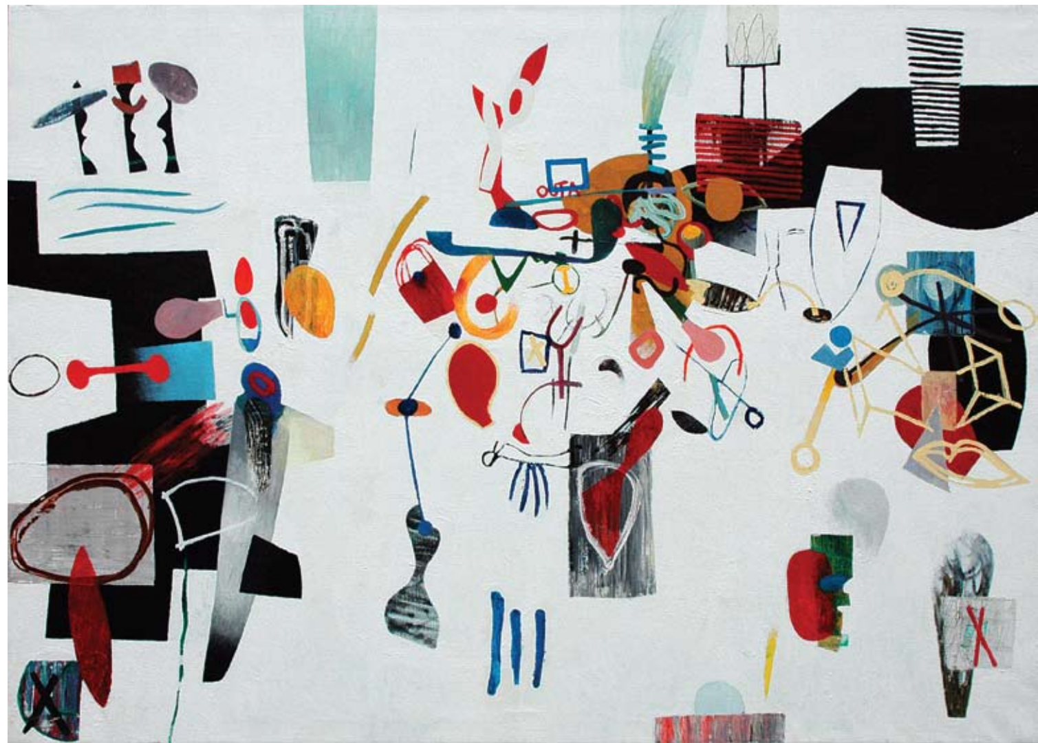
Seen Through the Mist