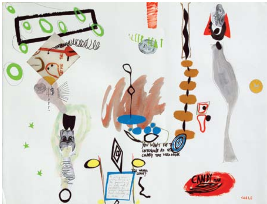
Let me Tell