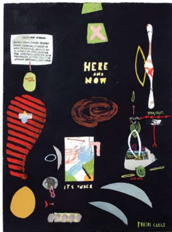
Here and Now