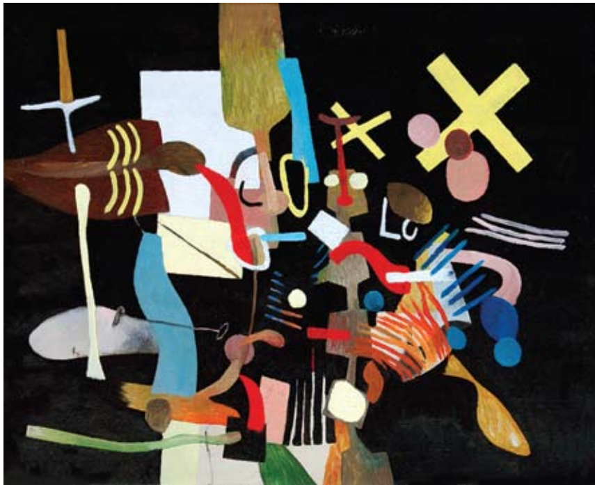
Ghost of My Past