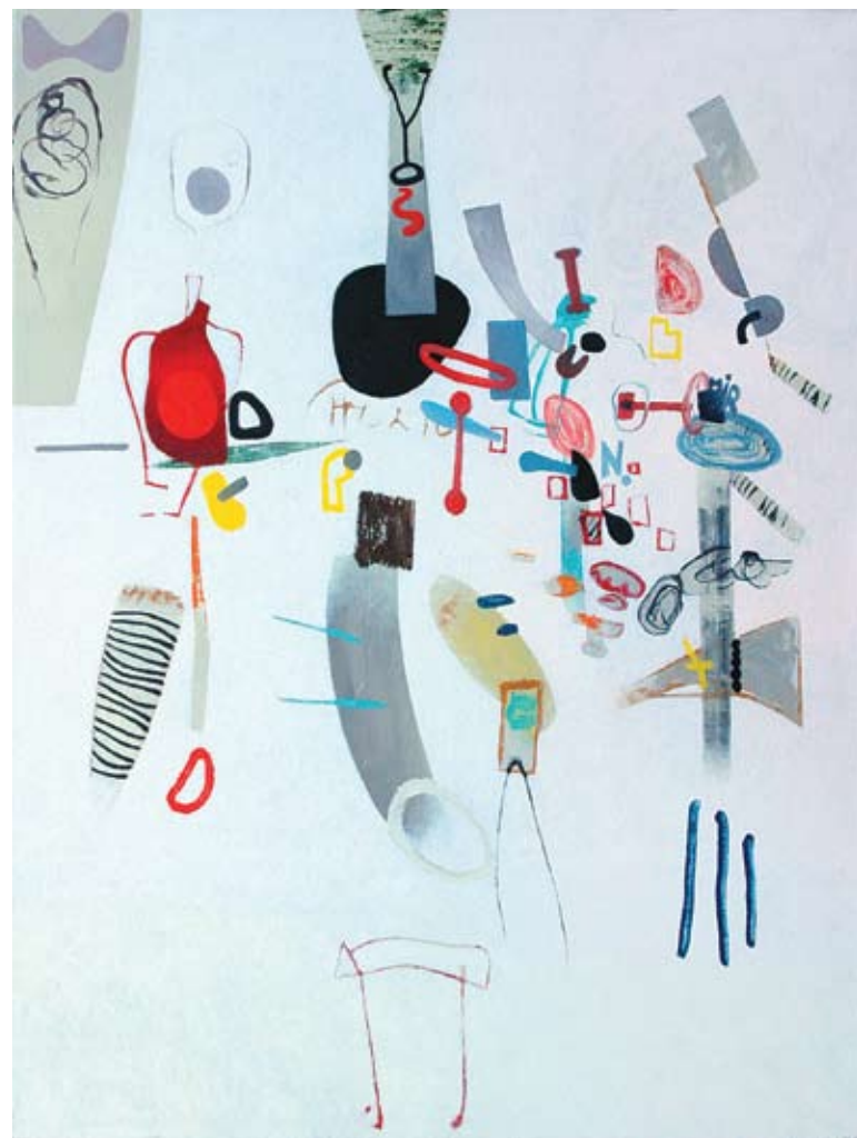
Terra del Fuego