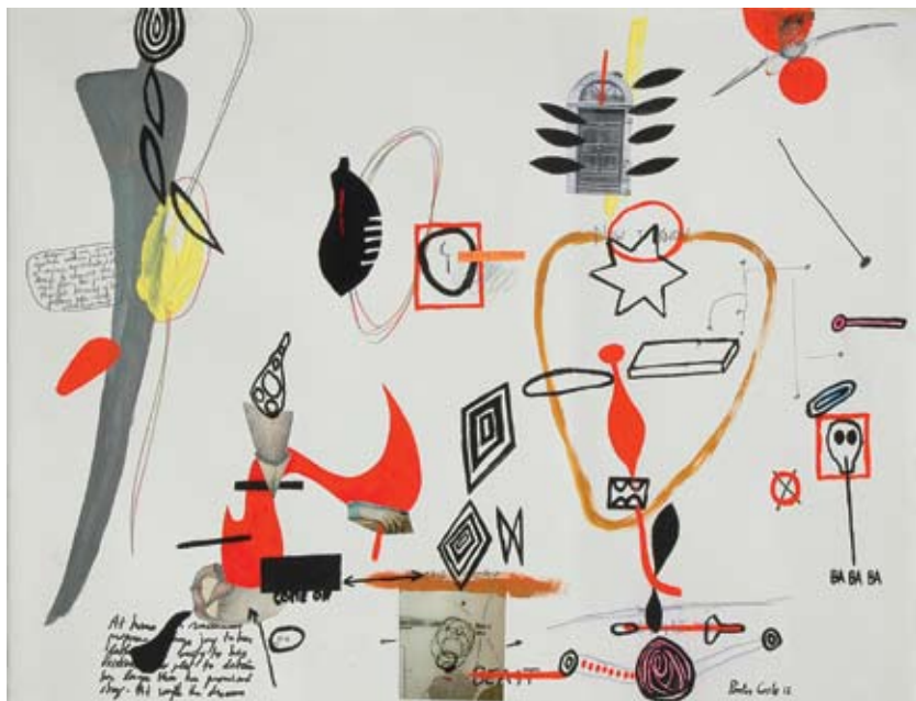
For One Person