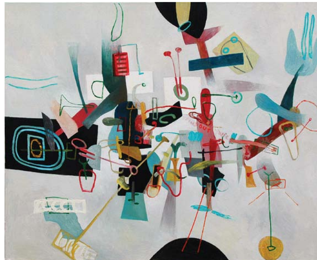
The Big Jump II