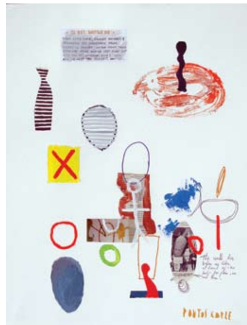
Il est Inute